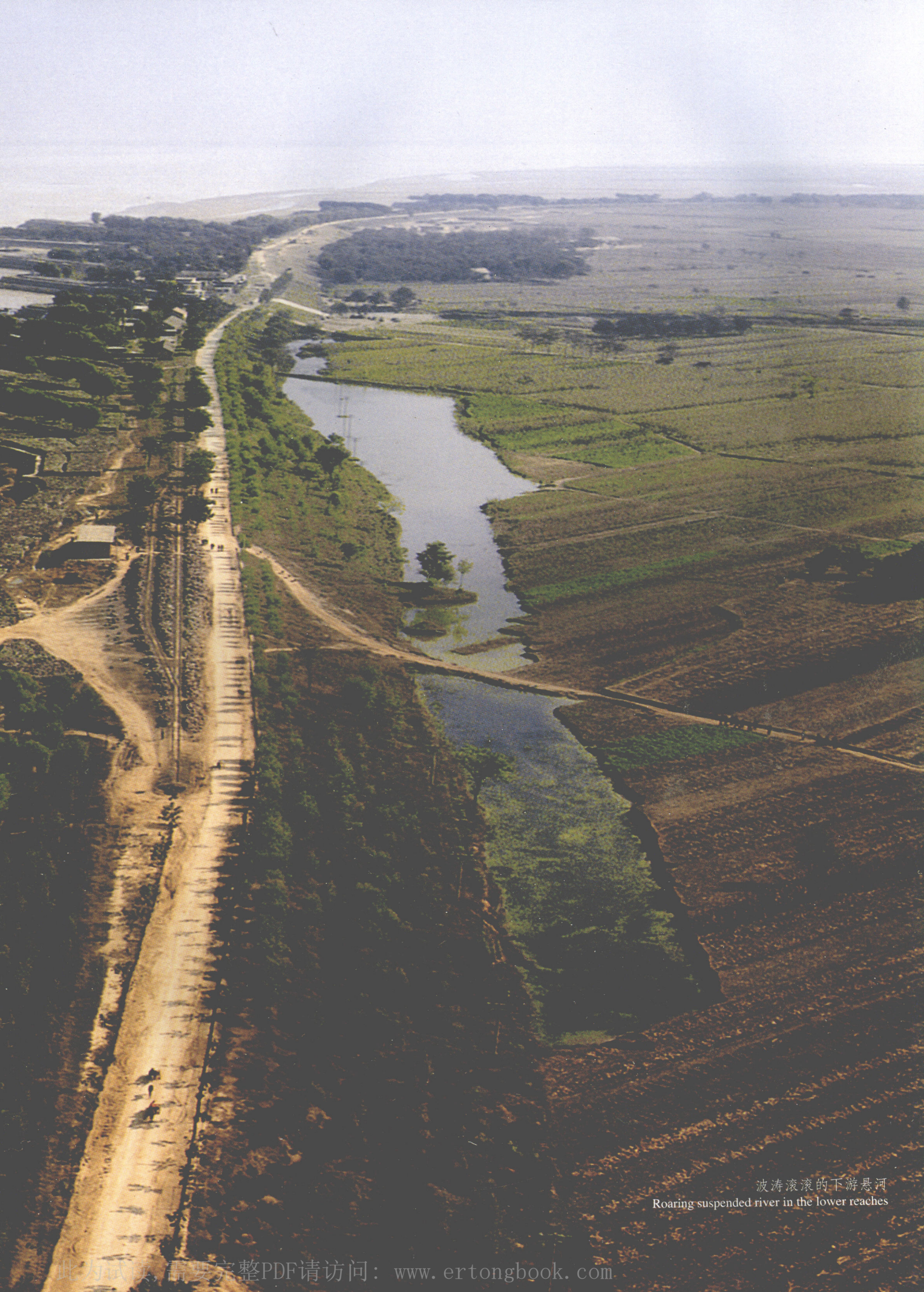
波涛滚滚的下游悬河 Roaring suspended river in the lower reaches