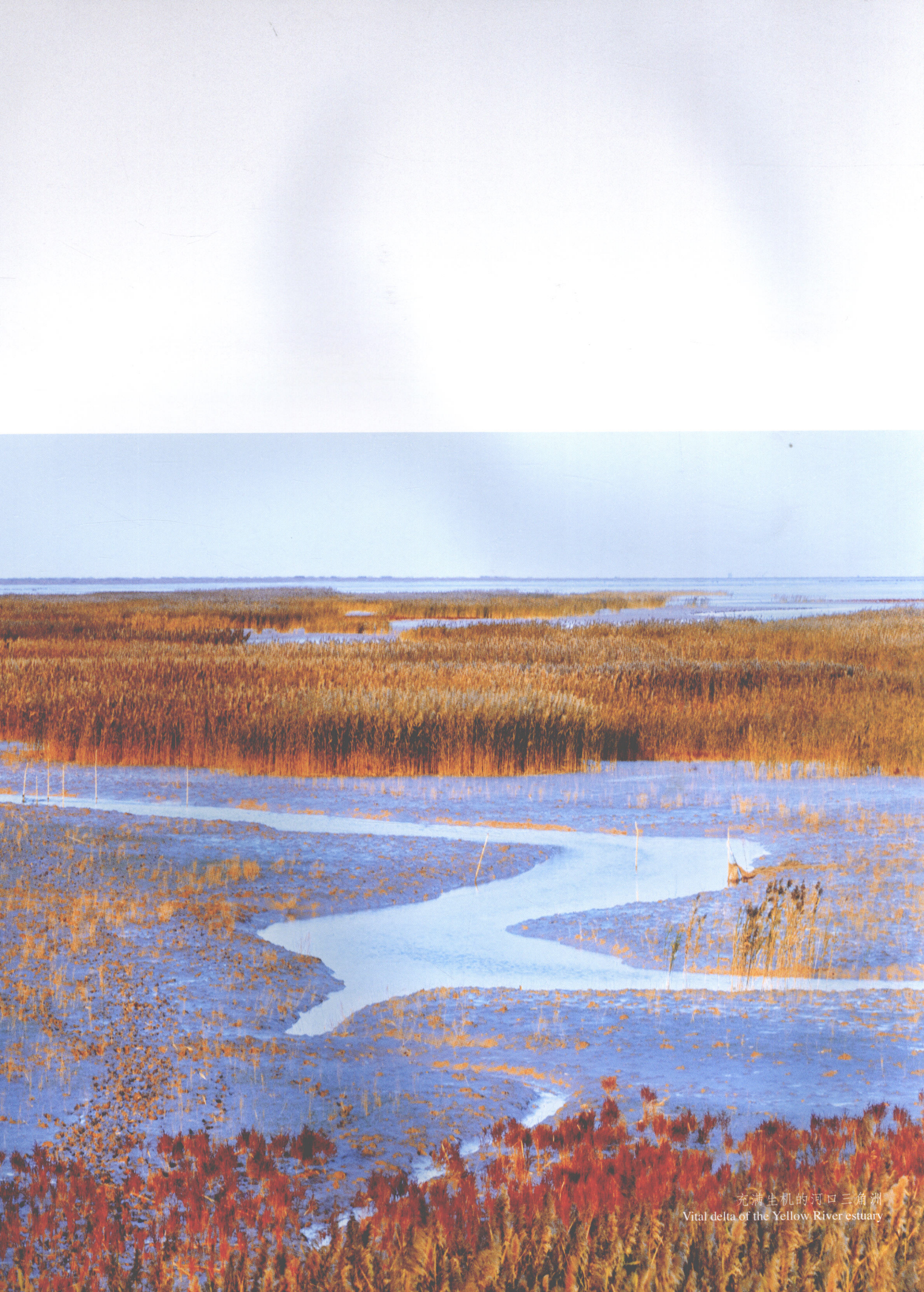
充满生机的河口三角洲 Vital delta of the Yellow River estuary