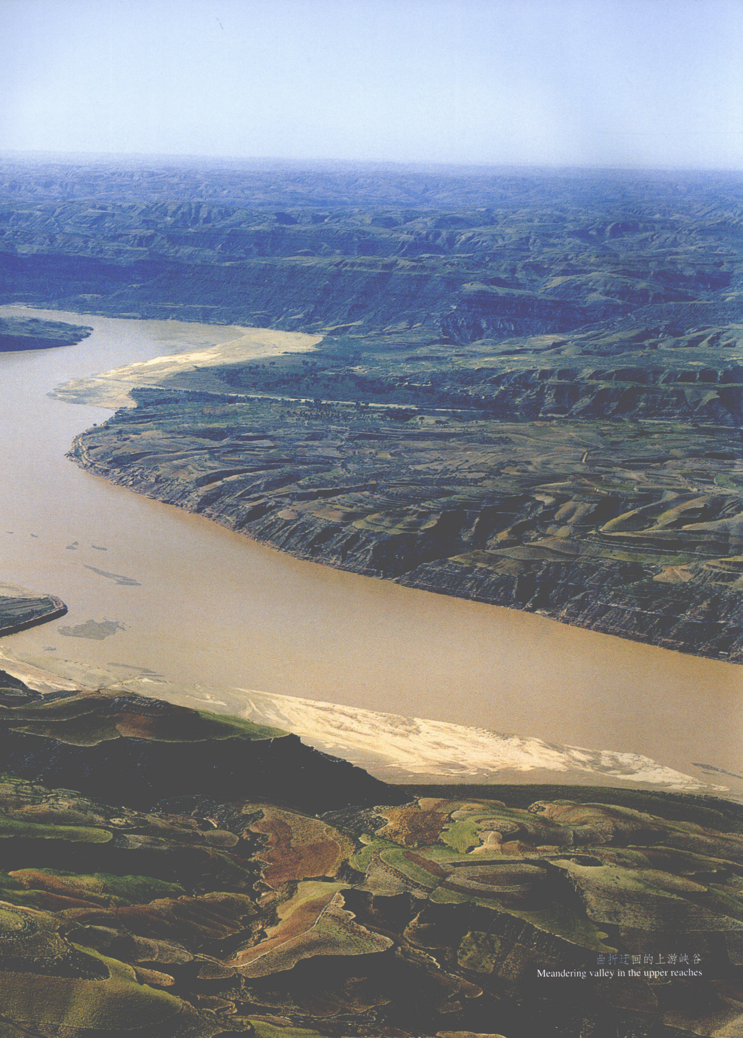
曲折迂回的上游峡谷 Meandering valley in the upper reaches