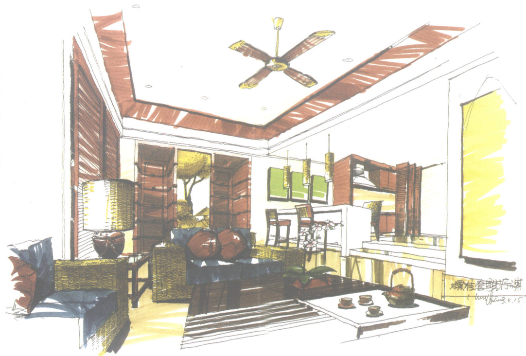
客房透视图 Perspective Drawing of Guest Room