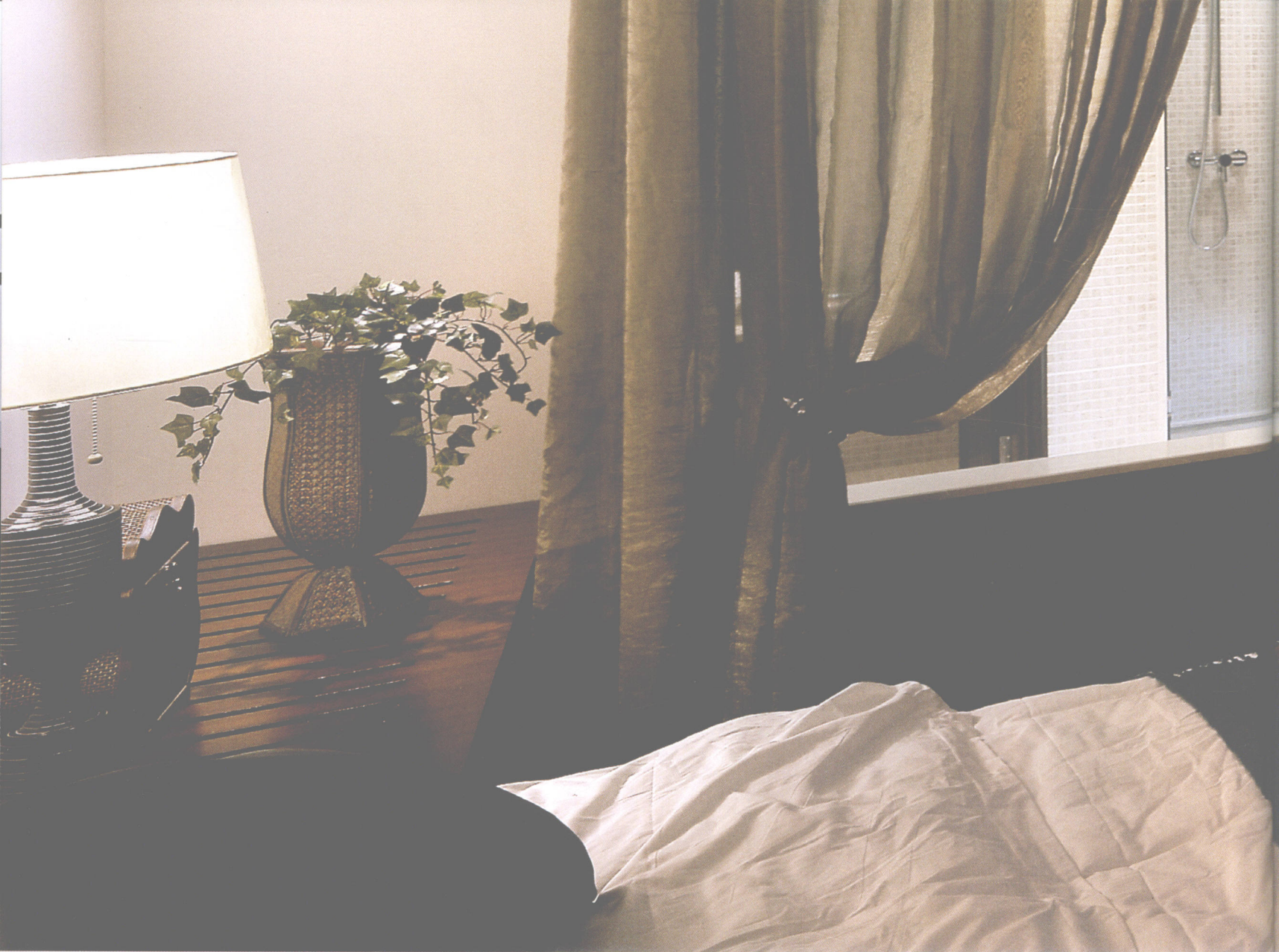
客厅 Living Room

香水湾酒店为产权式温泉度假酒店，其一期酒店占地面积为 13.45 公顷，建筑面积约 2 万平方米。建筑平面与用地内的天然湖泊（香水湖）结合，呈线型布置，依水而建，建筑层数为 2~3 层，建筑风格为略带东南亚风格的群体建筑。