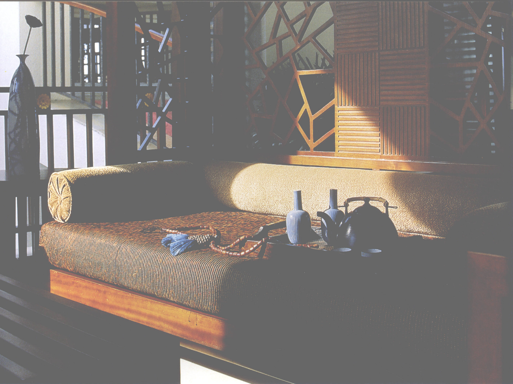
休息区 Rest Area