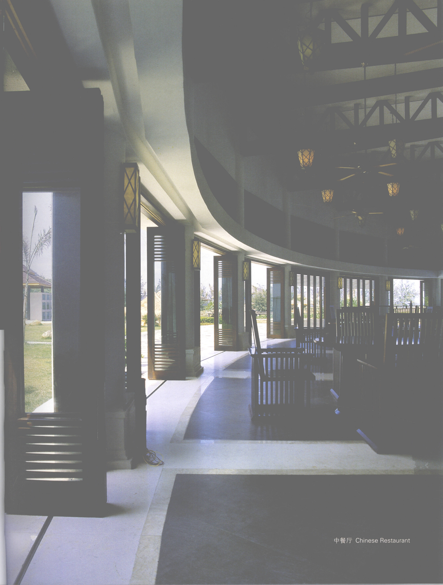
中餐厅 Chinese Restaurant