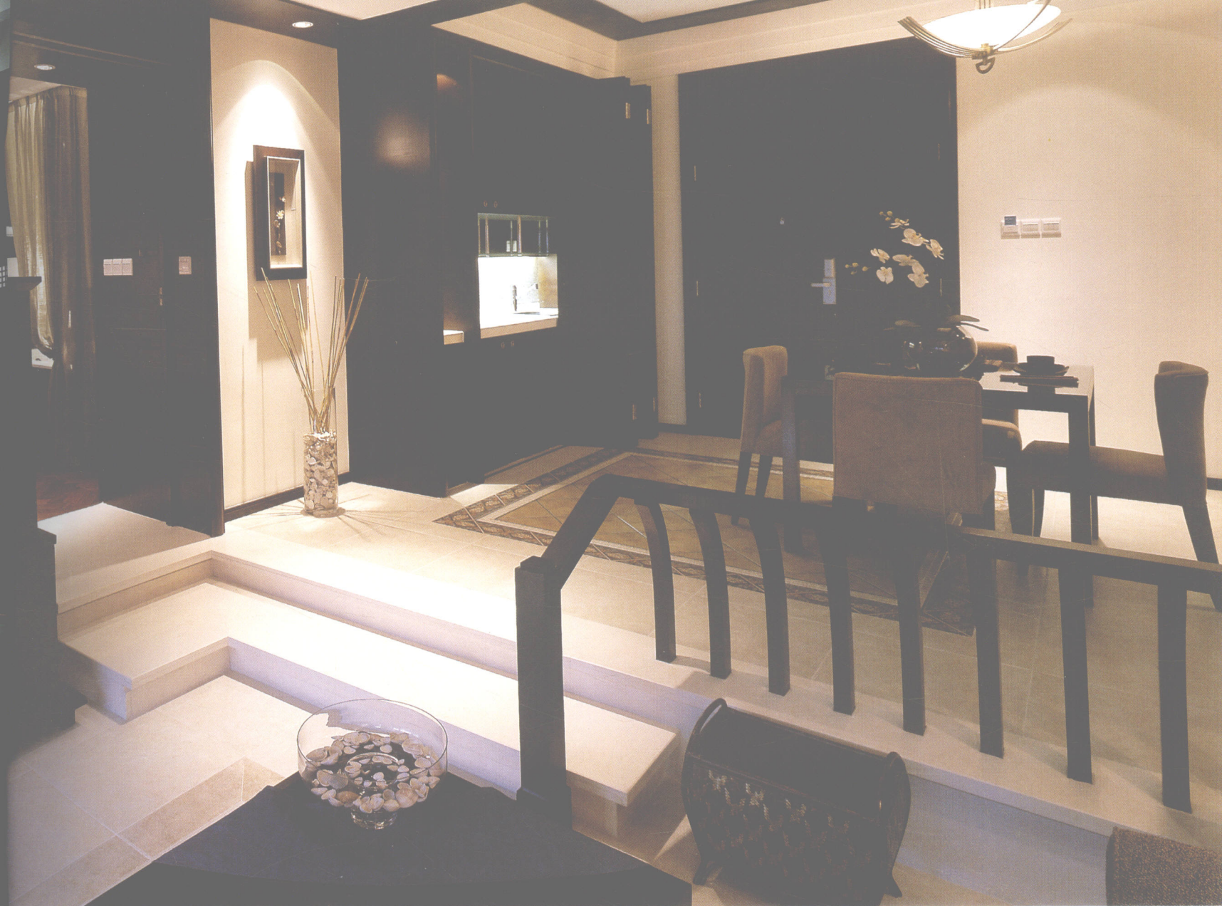
客房一角 A Corner of Guest Room