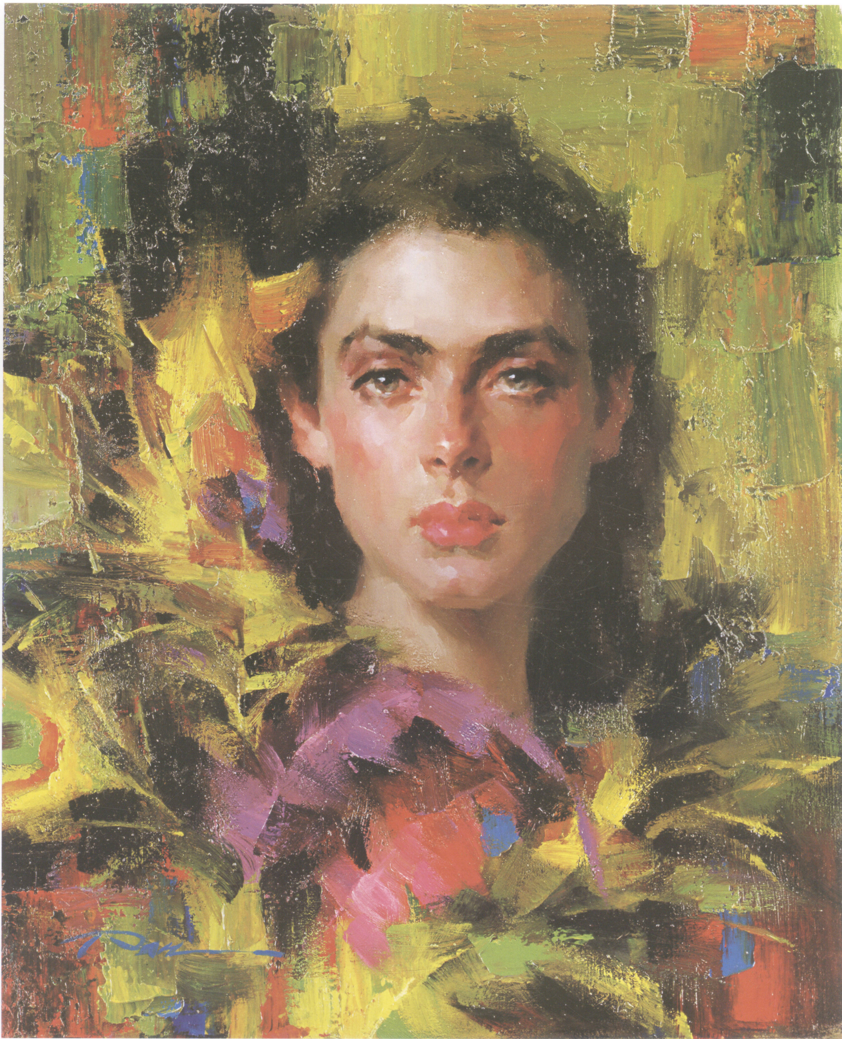
2. 演员 Showgirl 20in × 16in 50.8cm × 40.64cm