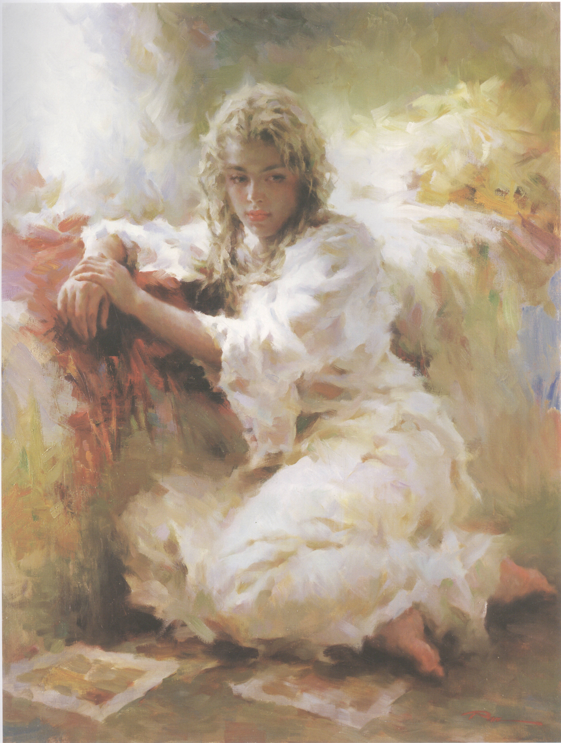
3. 意欲回眸 Nostalgia 40in × 30in 101.6cm × 76.2cm