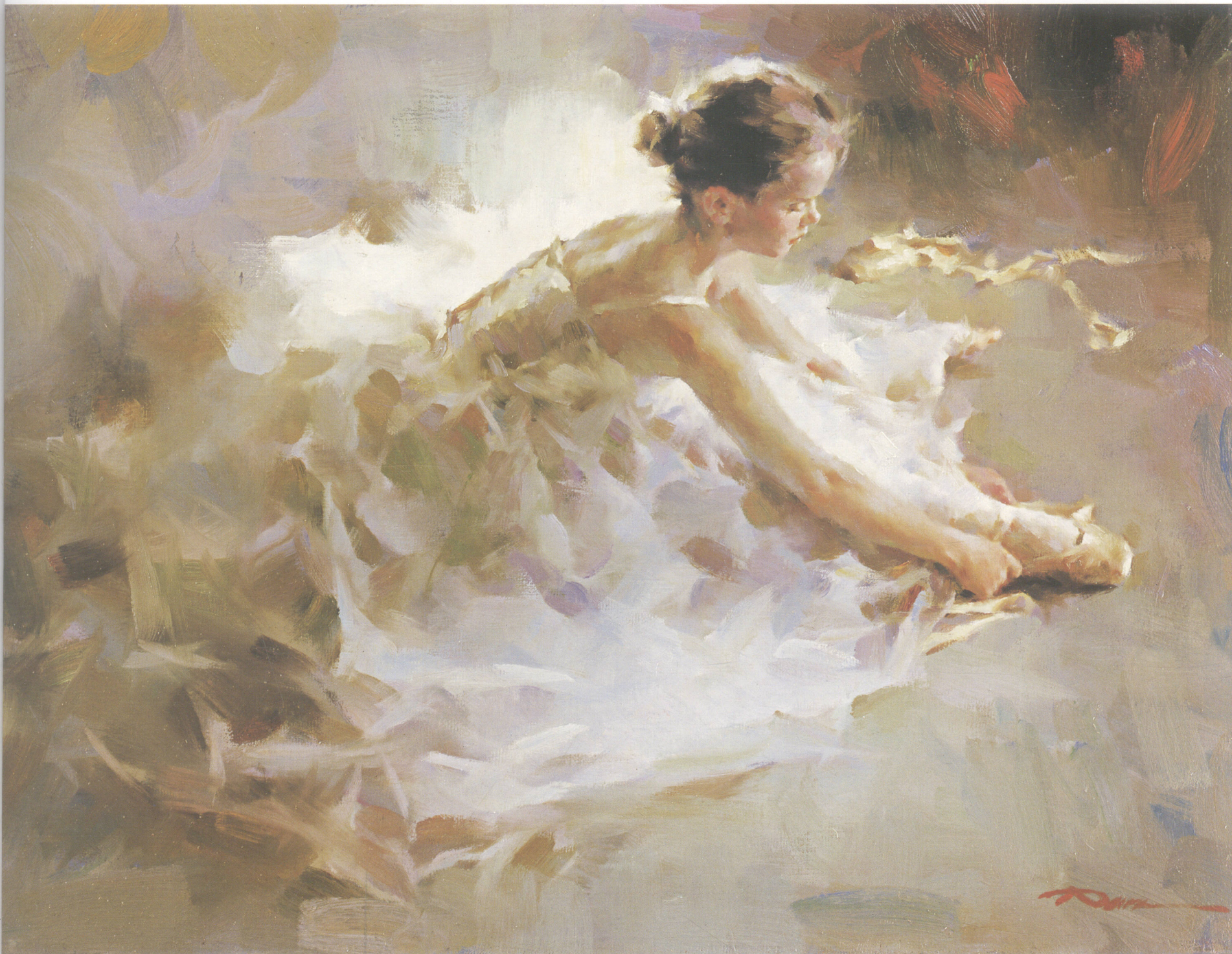
51.演出前 Before the Spotlight 18in × 24in 45.72cm × 60.96cm

潘仲武油画作品：汉英对照 / 潘仲武绘. — 天津：天津人民美术出版社，2007.5 (海外中国油画家)