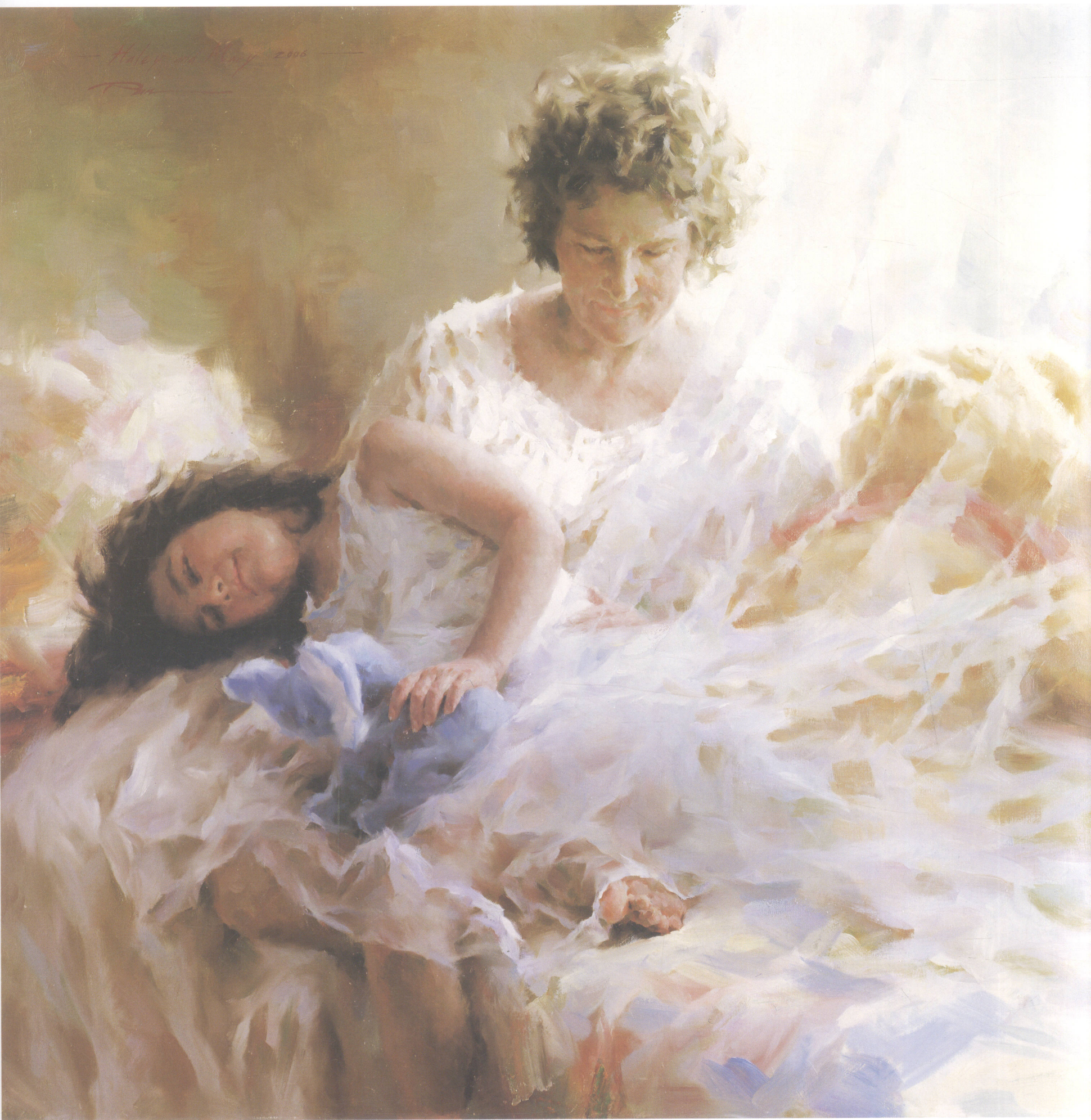
8. 憩 Daybreak 40in × 40in 101.6cm × 101.6cm