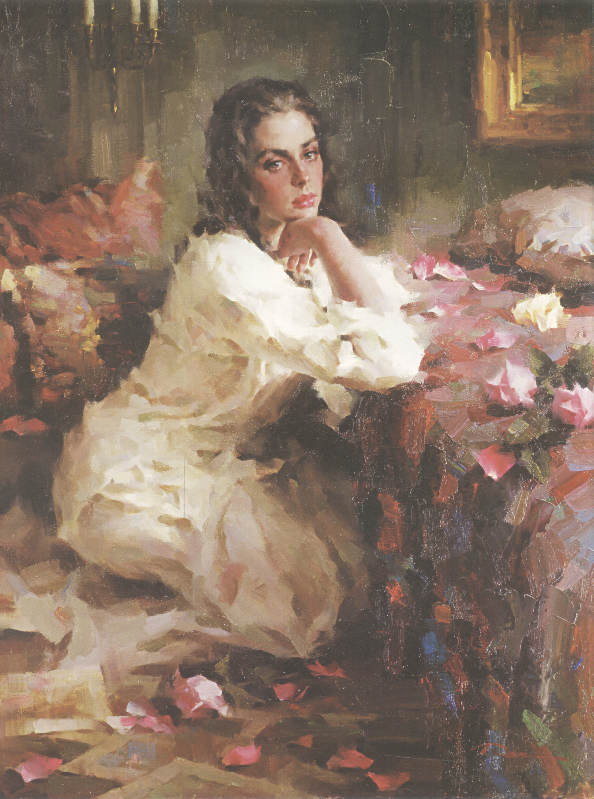
1. 思念 Memory of You 40in × 30in 101.6cm × 76.2cm