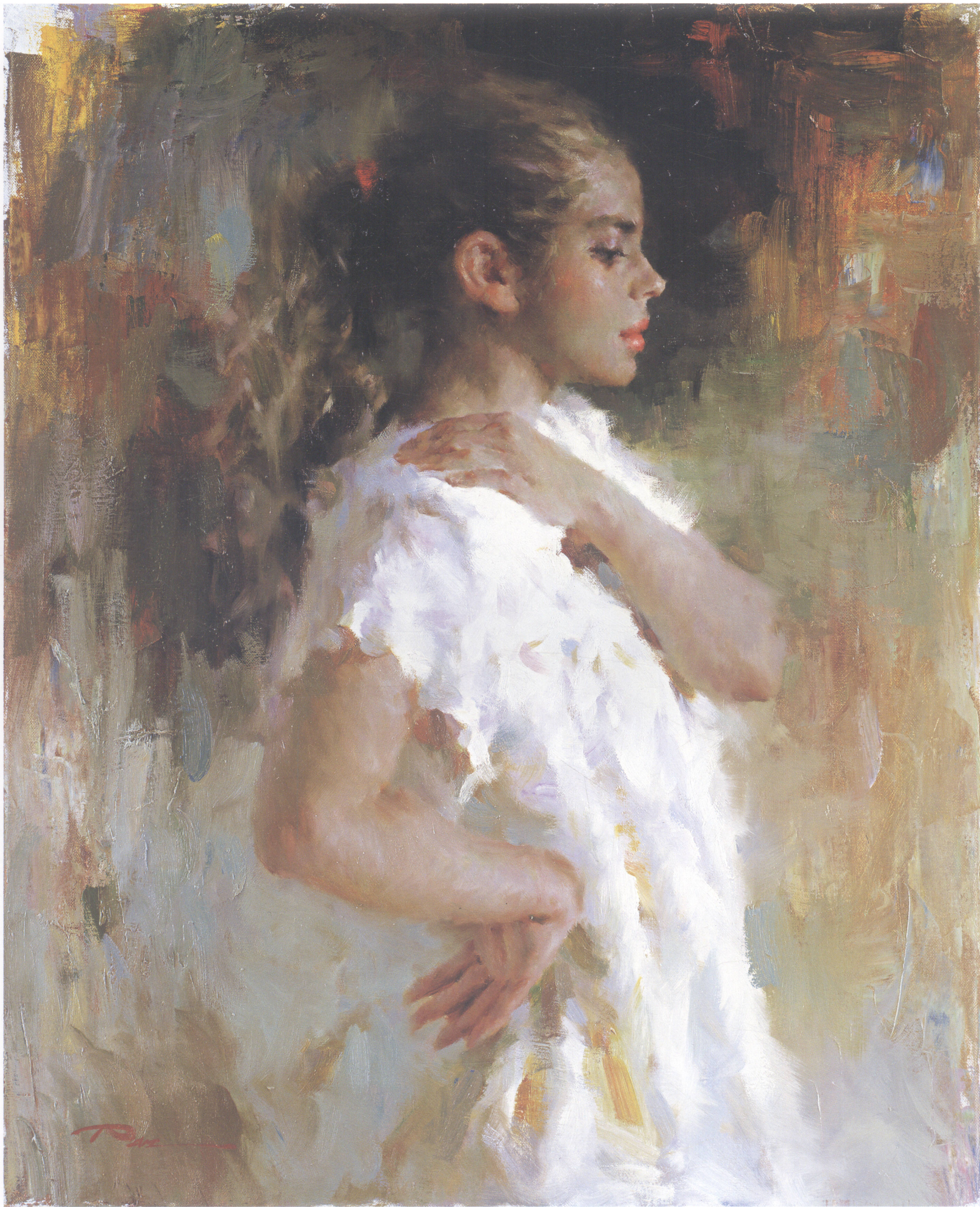
4. 凝思 Prudence 30in × 24in 76.32cm × 60.96cm