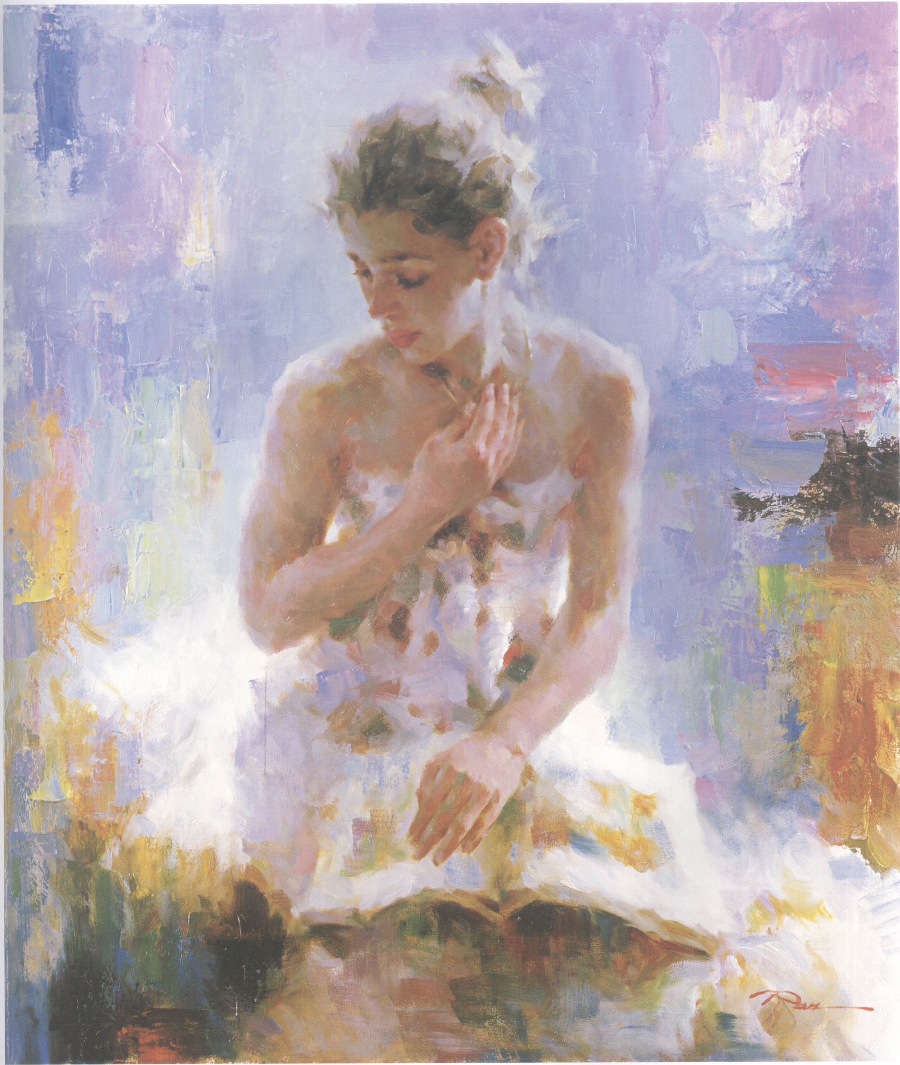
11. 静思 Intimate Memory 36in × 30in 91.44cm × 76.2cm