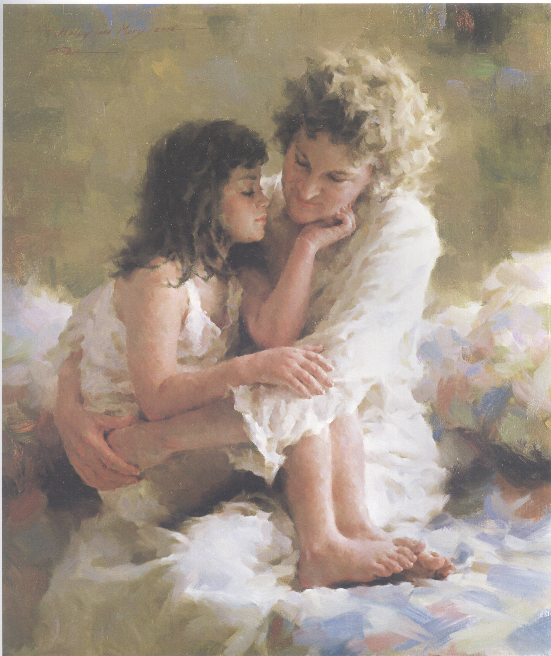
7. 母爱 Mother's Day 36in × 30in 91.44cm × 76.2cm