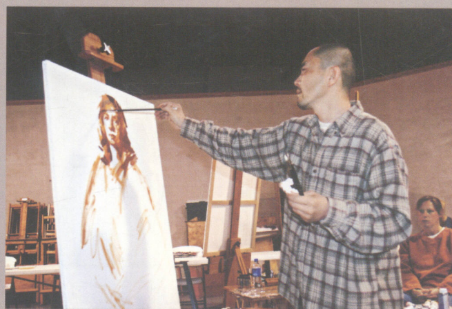
在作直接画法写生示范 Demonstration of direct painting technique