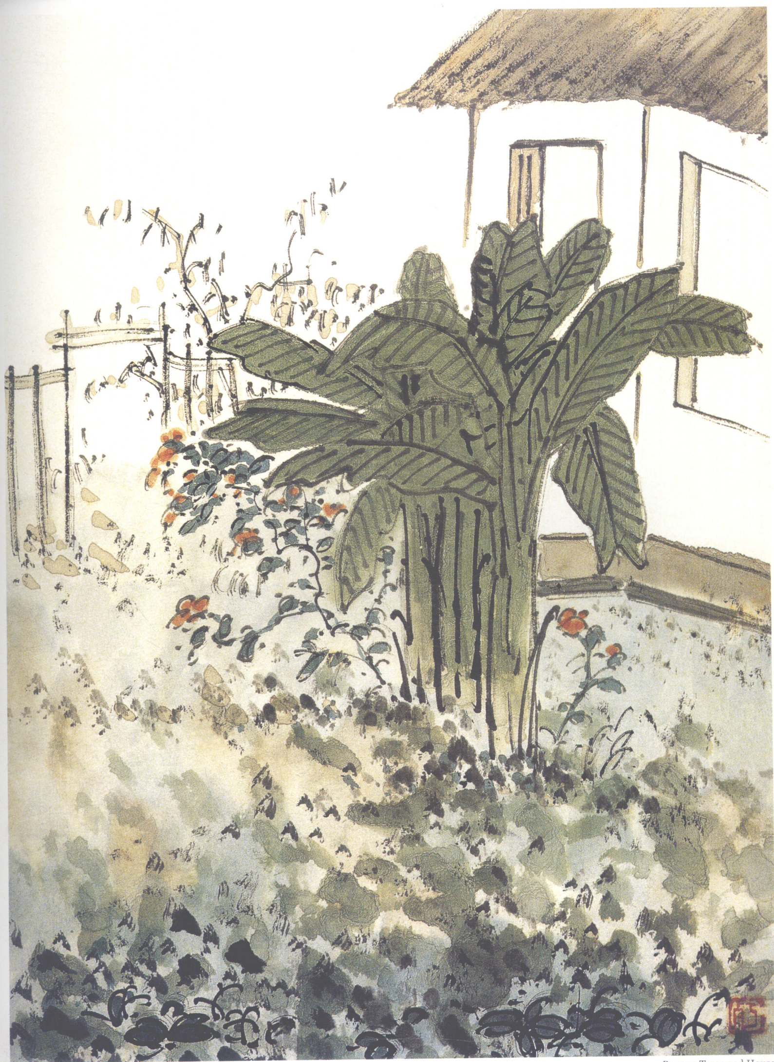
Banana Trees and House 蕉林幽居