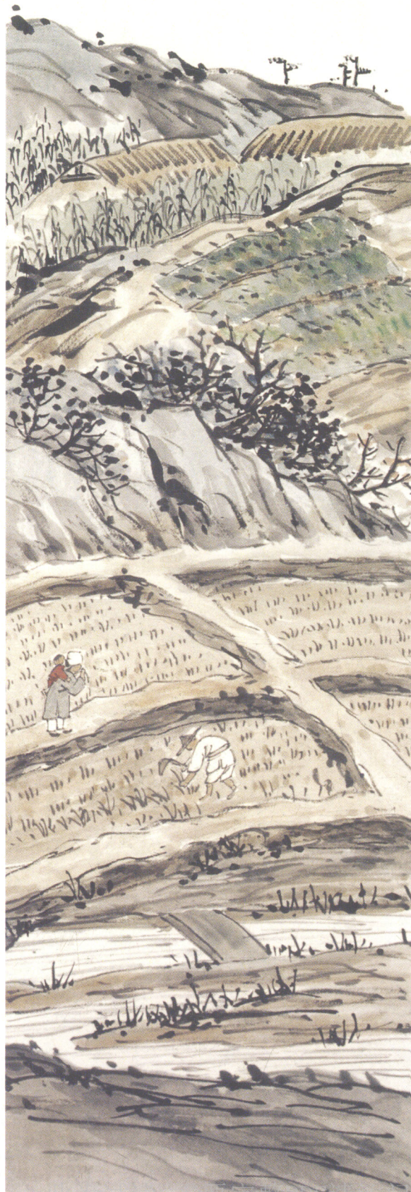
A Harvesting Scene in a Riverside Village