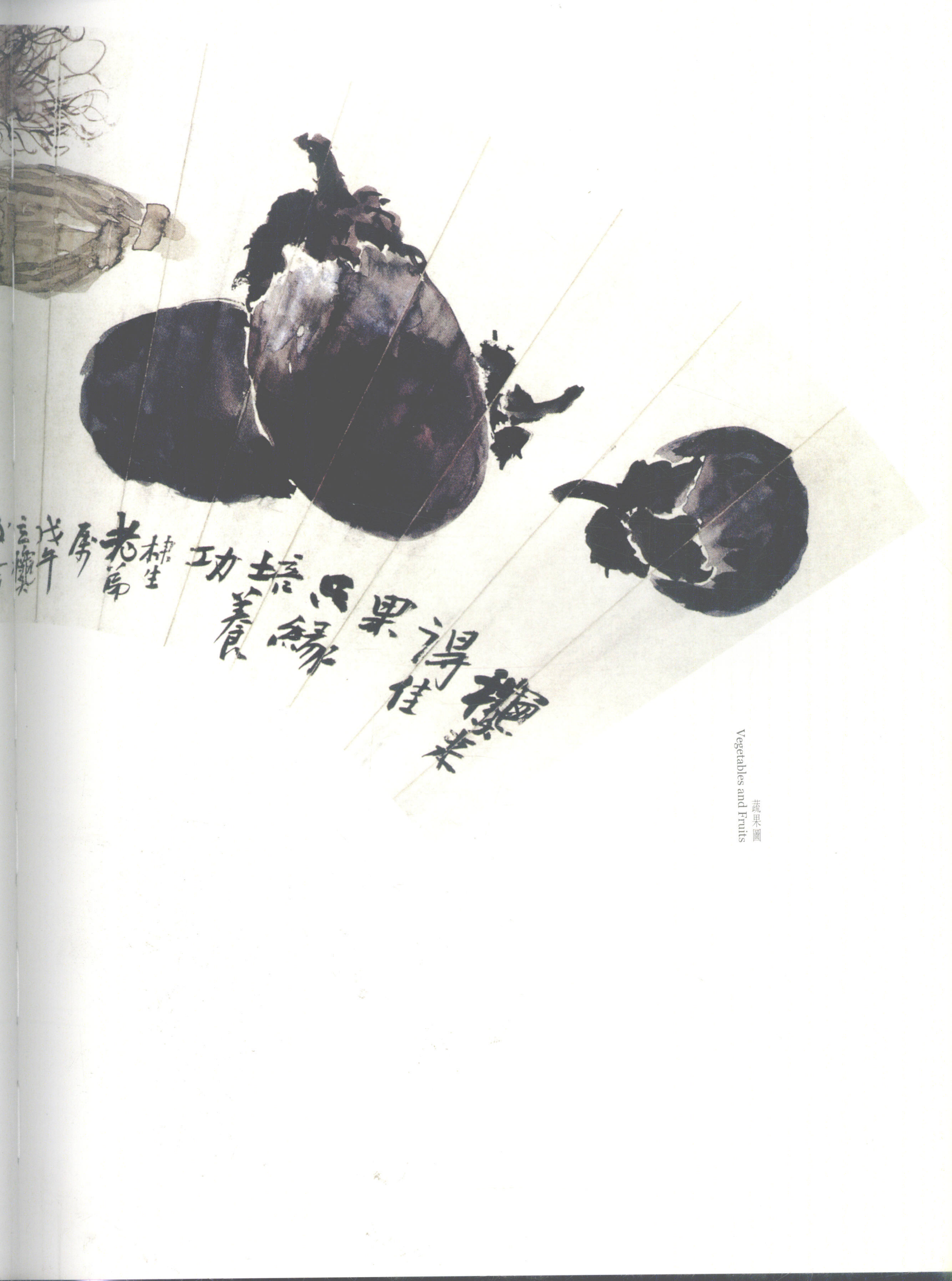
蔬果圖 Vegetables and Fruits