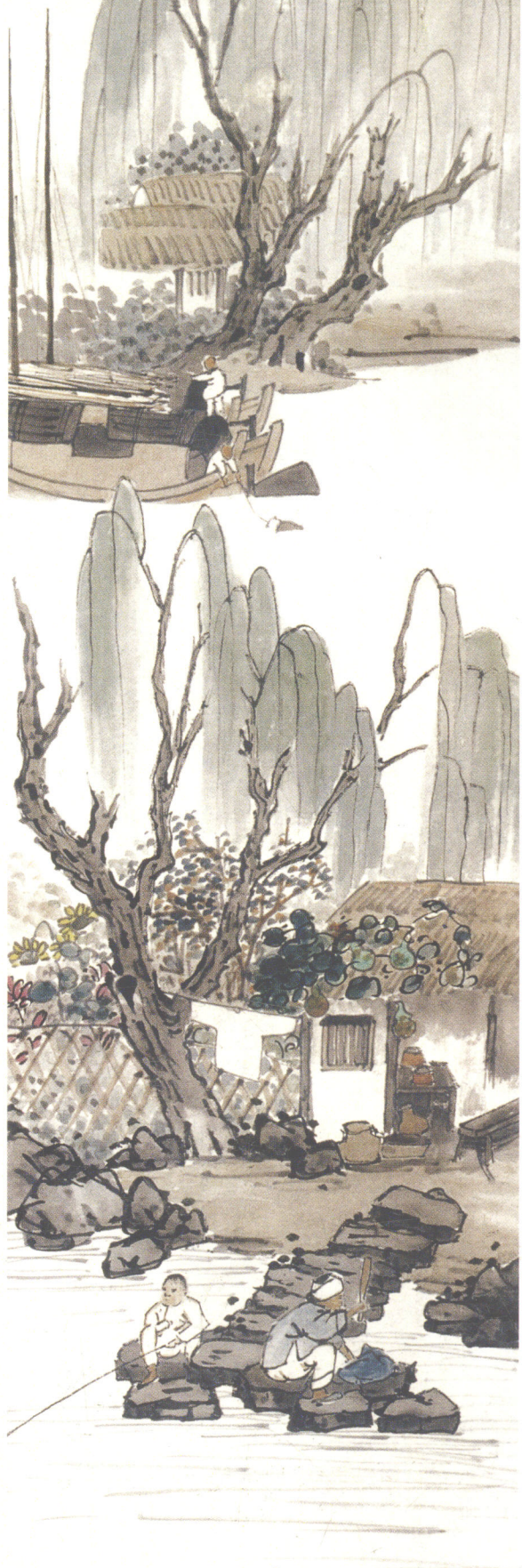
Washing Clothes in the River 溪流浣衣