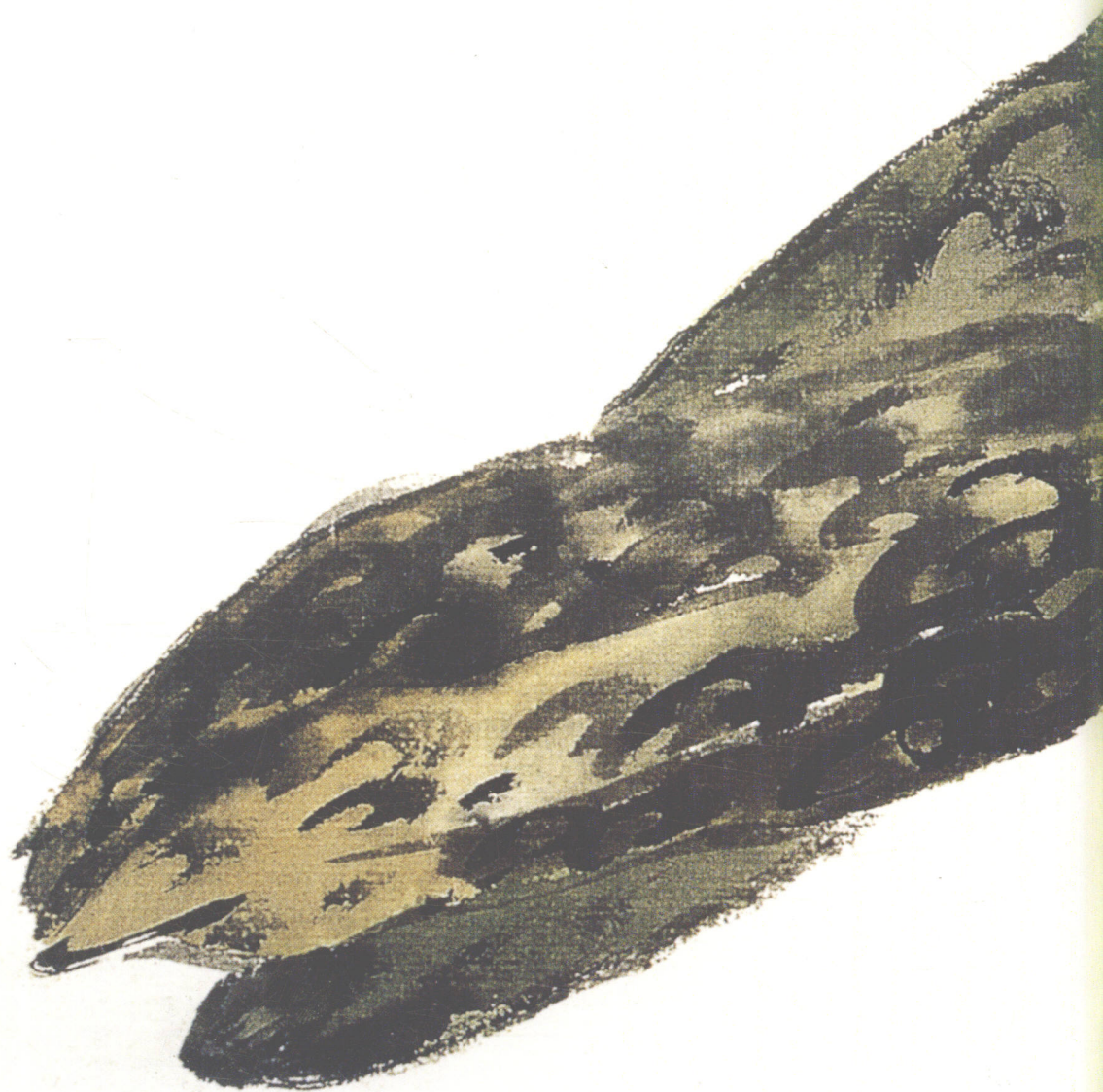
苦瓜那能待客 Bitter Melon