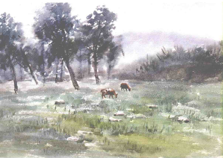
八渡小景 The scene of Badu 56cm x 38cm