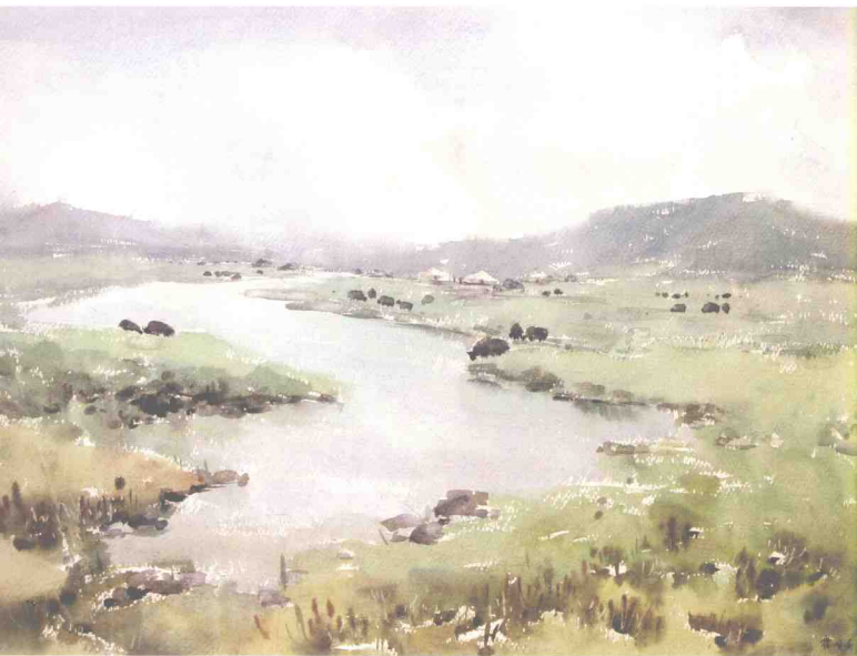
草原风情 Prairie local conditions and social customs 53cm x 39cm