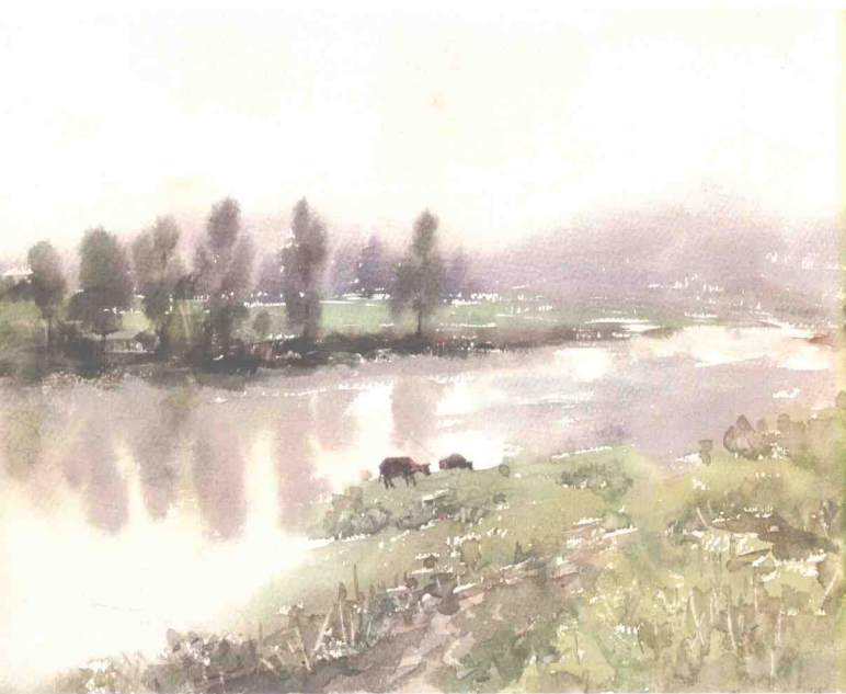
秦巴晓雾 Qinba morning fog 37cm×28cm