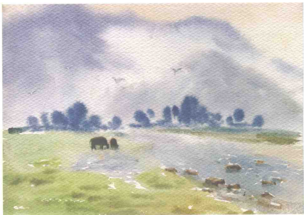
巴山小景 The scene of Bashan 56cm × 38cm