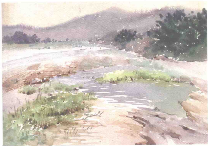
陕南小景 The scene of Shannan 44cm×31cm