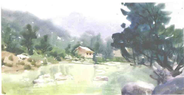
净土 Pure land 52cm × 27cm