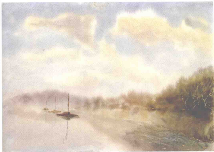
湖 Lake 45cm×32cm