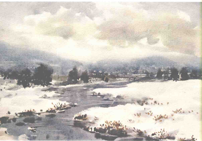
雪景 Snowscape 55cm×37cm