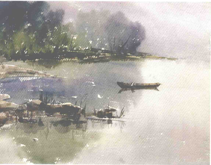
湖边 Bund 42cm×31cm