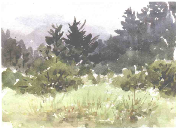
平河梁上 Bridge over Pinghe 31cm x 23cm