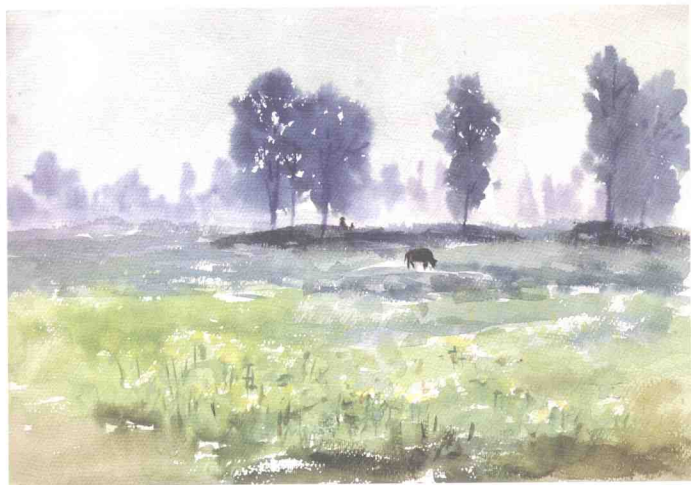
油菜花香 Rape flower fragrance 43cm×30cm