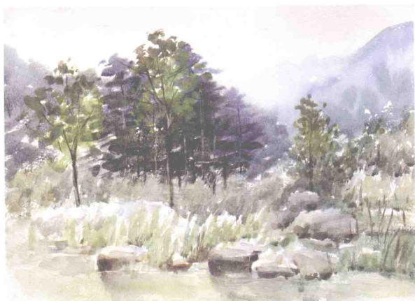
山中 In mountain 38cm x 28cm