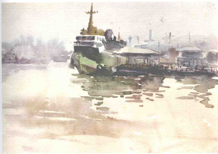
码头 Landing 30cm×21cm