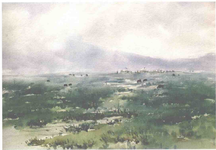
牧区风情 Prairie local conditions and social customs 56cm×39cm