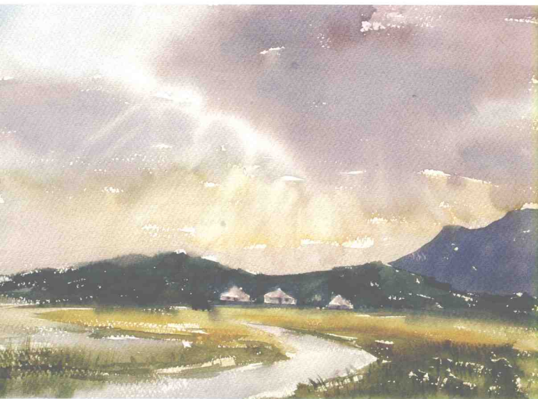
草原夕照 Prairie evening glow 41cm×30cm