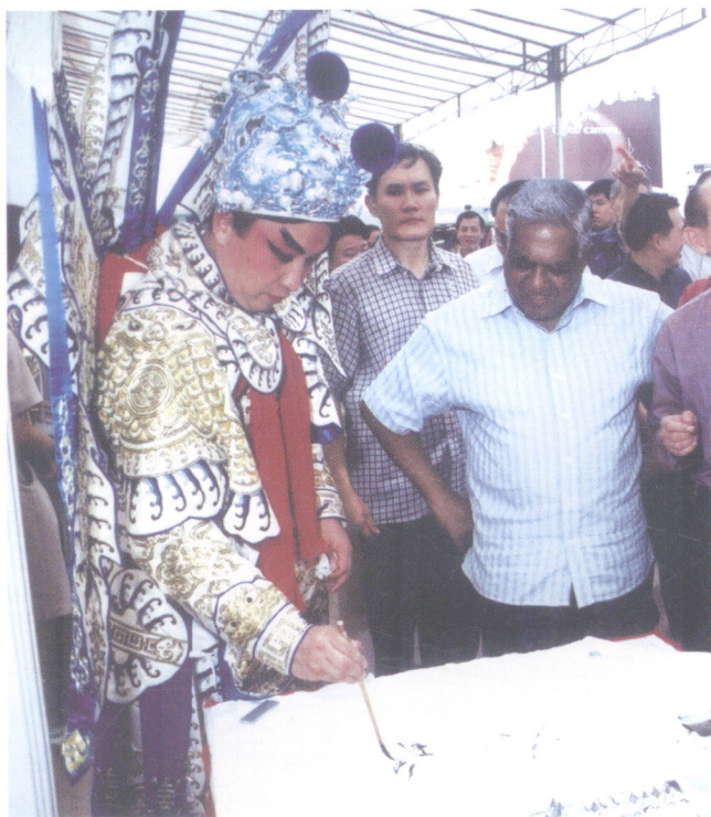
2003 年 11 月 8 日在新加坡为总统纳丹演出中国京剧 《长坂坡》后, 当场画了一张戏曲画送给纳丹

On November 8, 2003, invited to Singapore to perform Beijing Opera, a part of "The Battle of Long Board Slope" for President Nadan, after the performance painted a picture and sent it to him on the spot