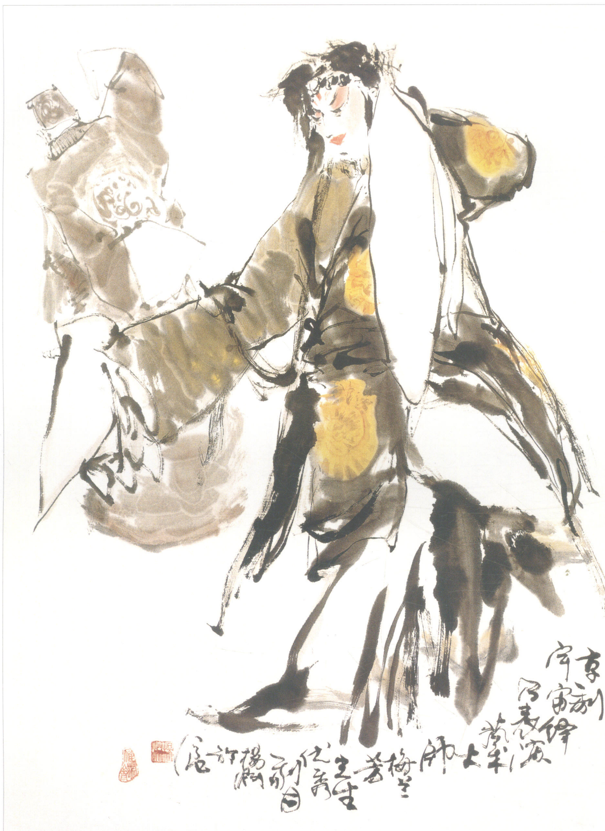
梅兰芳演宇宙峰 (56 × 47)