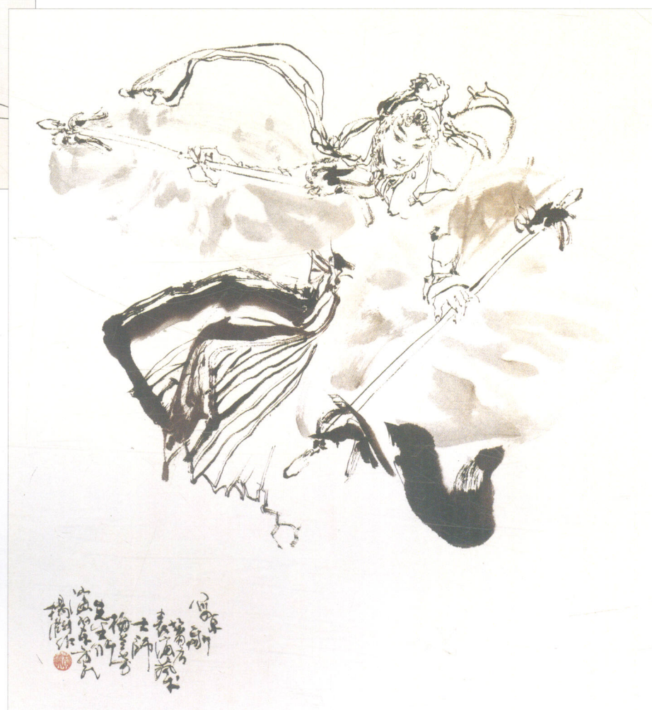
梅兰芳演虹霓关 (67 × 58)