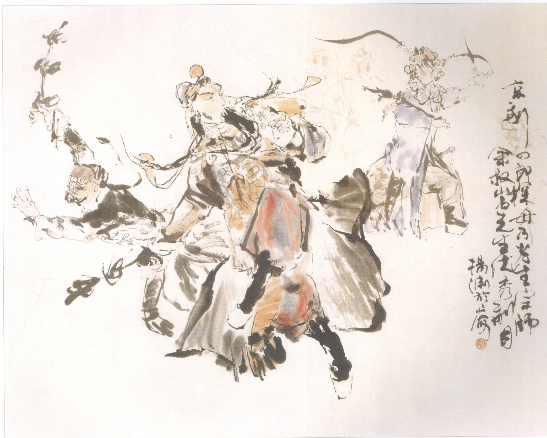
余叔岩演四郎探母 (84 × 66) Yu Shuyan plays Si Lang Tan Mu