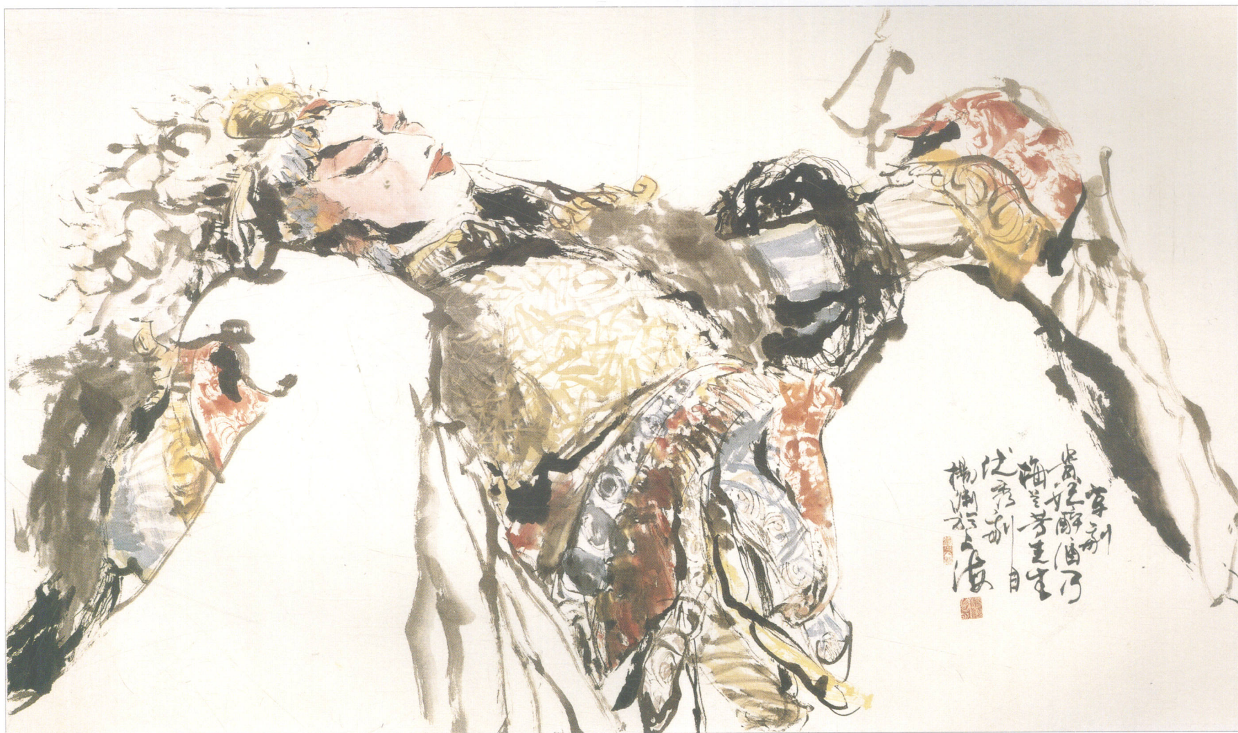
梅兰芳演贵妃醉酒 (176 × 95) Mei Lanfang plays Gui Fei Zui Jiu