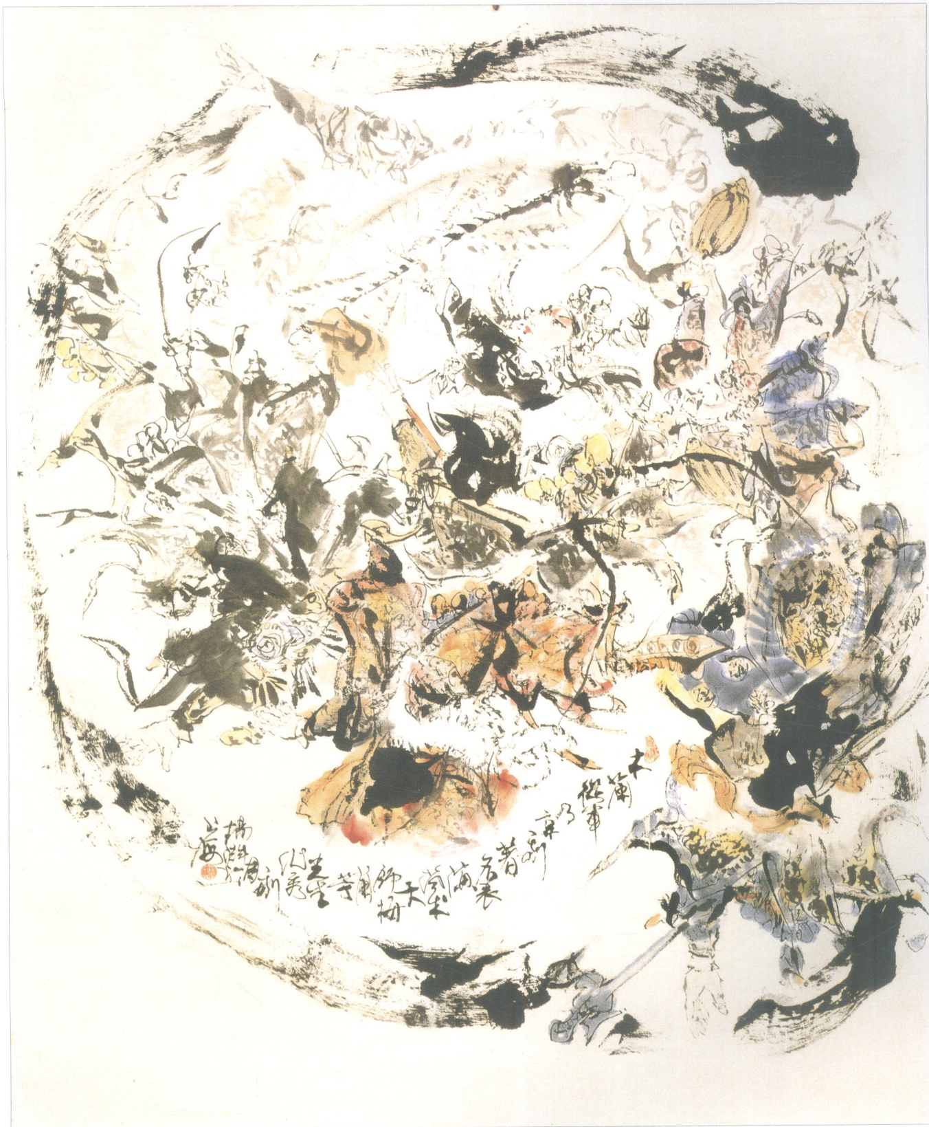
梅兰芳演花木兰 (118 × 93) Mei Lanfang plays Hua Mu Lan