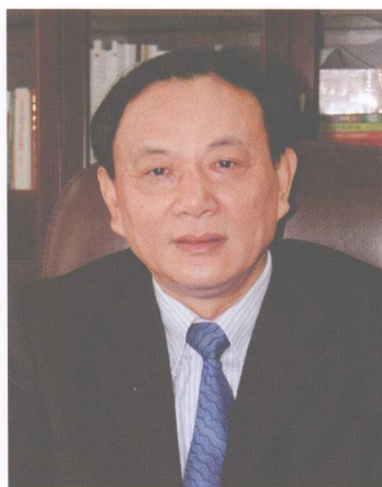
副局长 杨国庆 Vice Minister Yang Guoqing