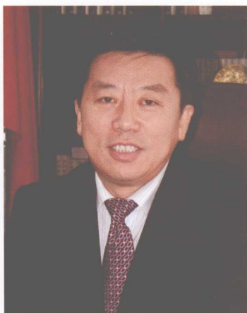
副局长 高宏峰 Vice Minister Gao Hongfeng