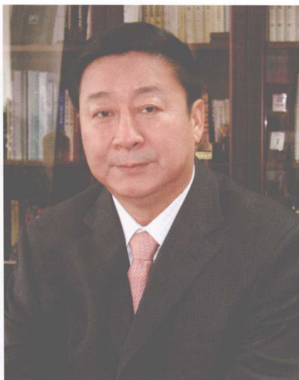
局长 杨元元 Minister Yang Yuanyuan