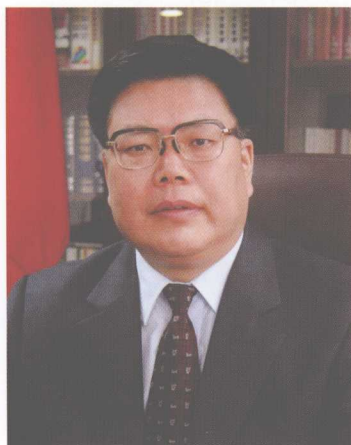
副局长 王昌顺 Vice Minister Wang Changshun