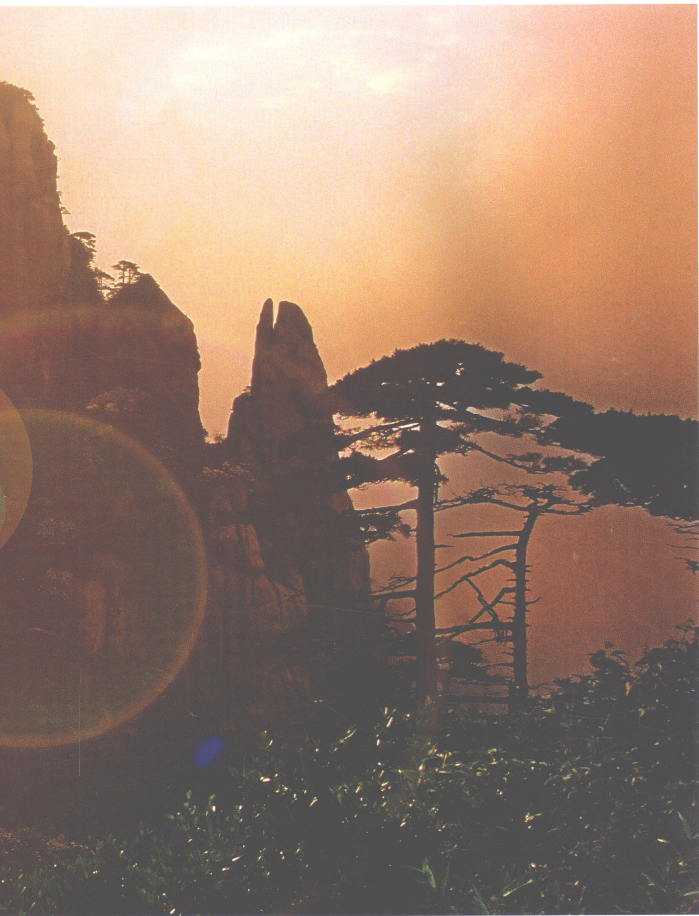
夏日光华 Splendid summer