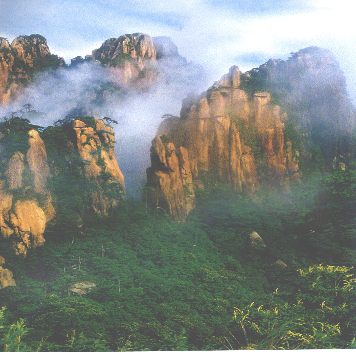
人间仙境 A Wonderland World