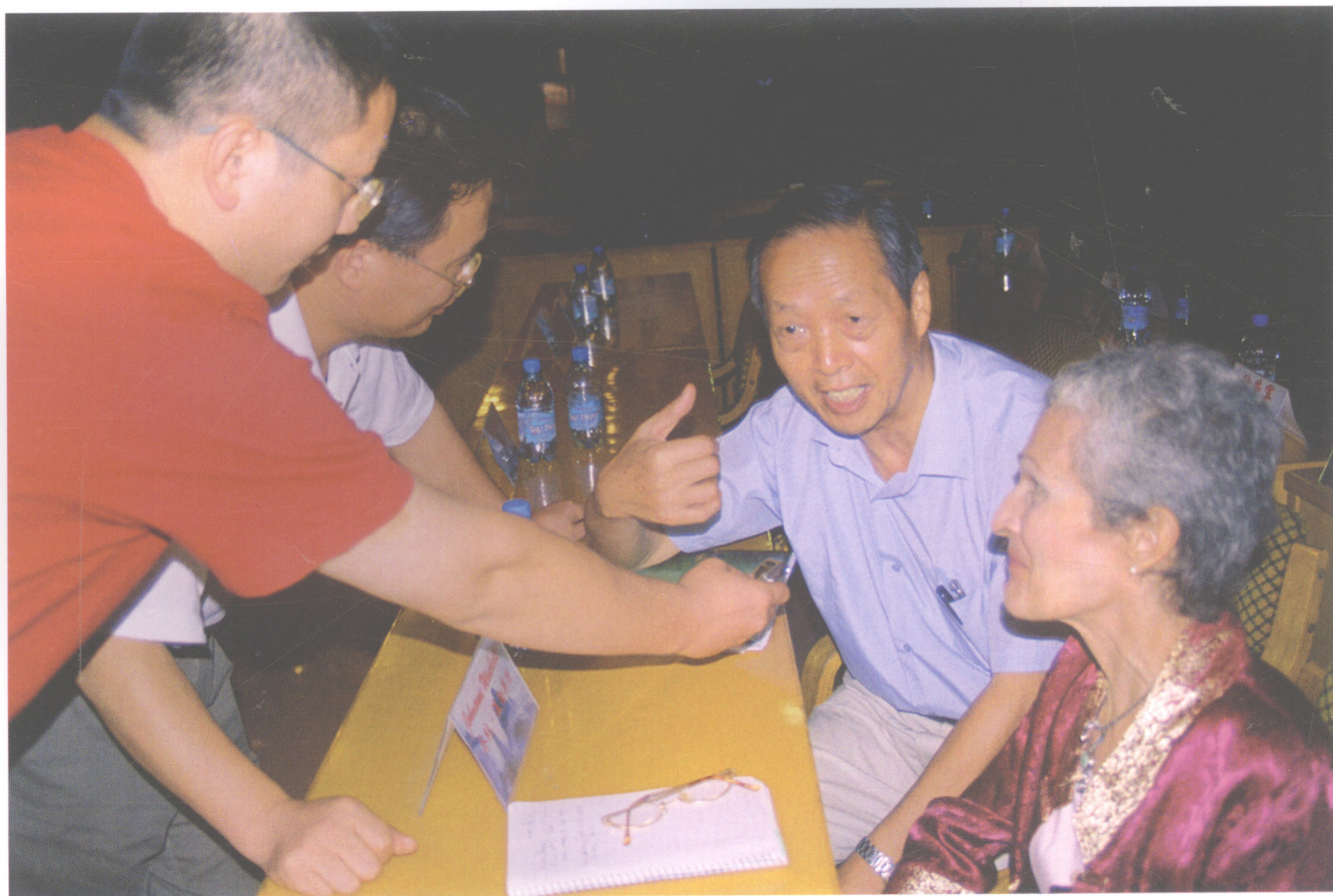
中外专家在共同研讨三清山花岗岩地质地貌相关问题 Together the experts from home and abroad deliberated on the granite geology and physiognomy of sanqing mountain

At the conference, the delegates deliberated on the fundamental theory of granite geology and physiognomy, and the establishment and management for granite scenic areas. During the meeting, more than one hundred experts from home and abroad made on-the-spot investigations of the granite geology and physiognomy of the landscapes, analyzed its process of formation and evolution... and made suggestions on the establishment and management of granite scenic areas to ensure continued promotion of the Sanqing Mountain declaration to the World Natural Heritage and World Geopark.