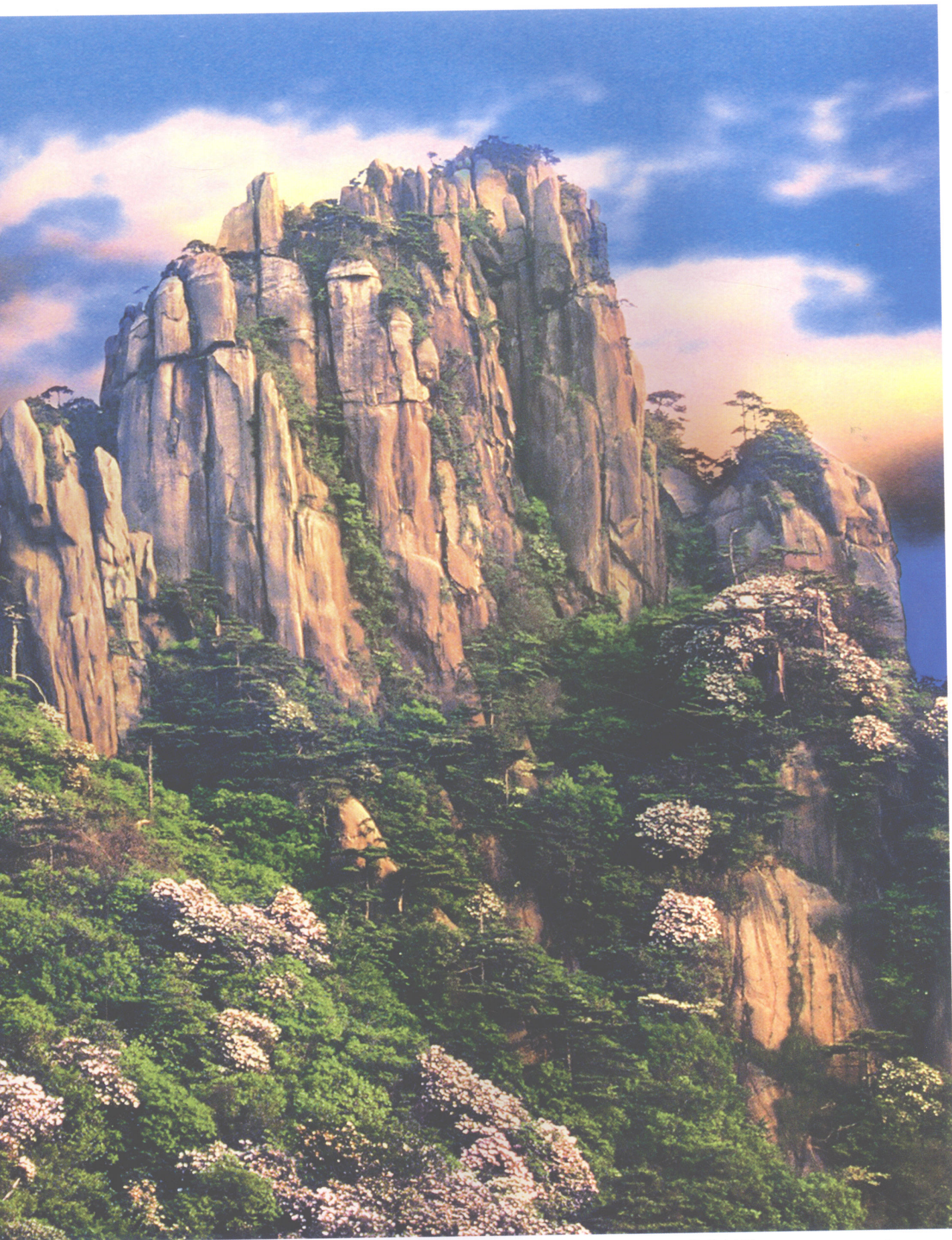
春花烂漫 The brilliant spring flowers