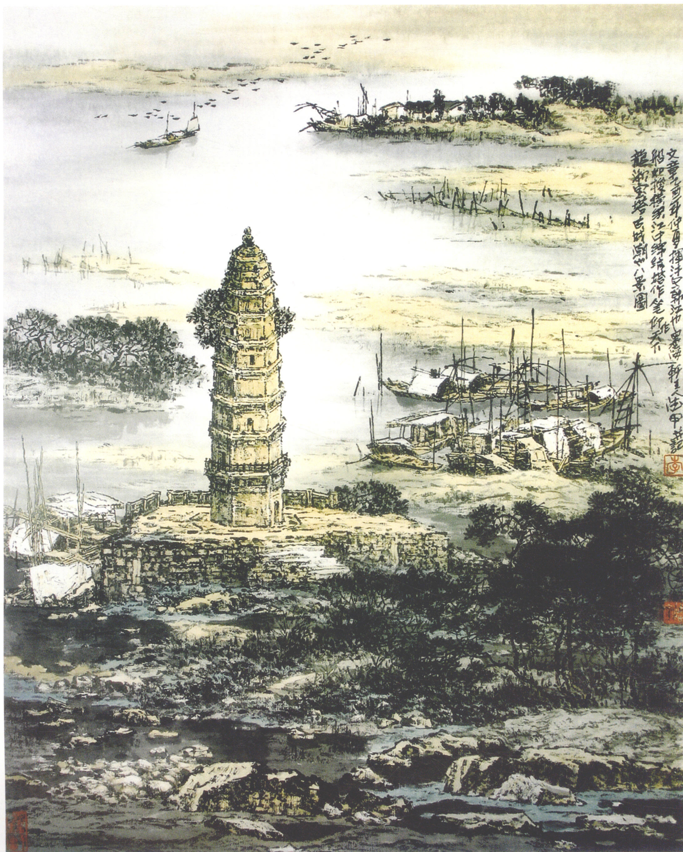
龙湫宝塔 李德甲 57.5 × 59.5cm