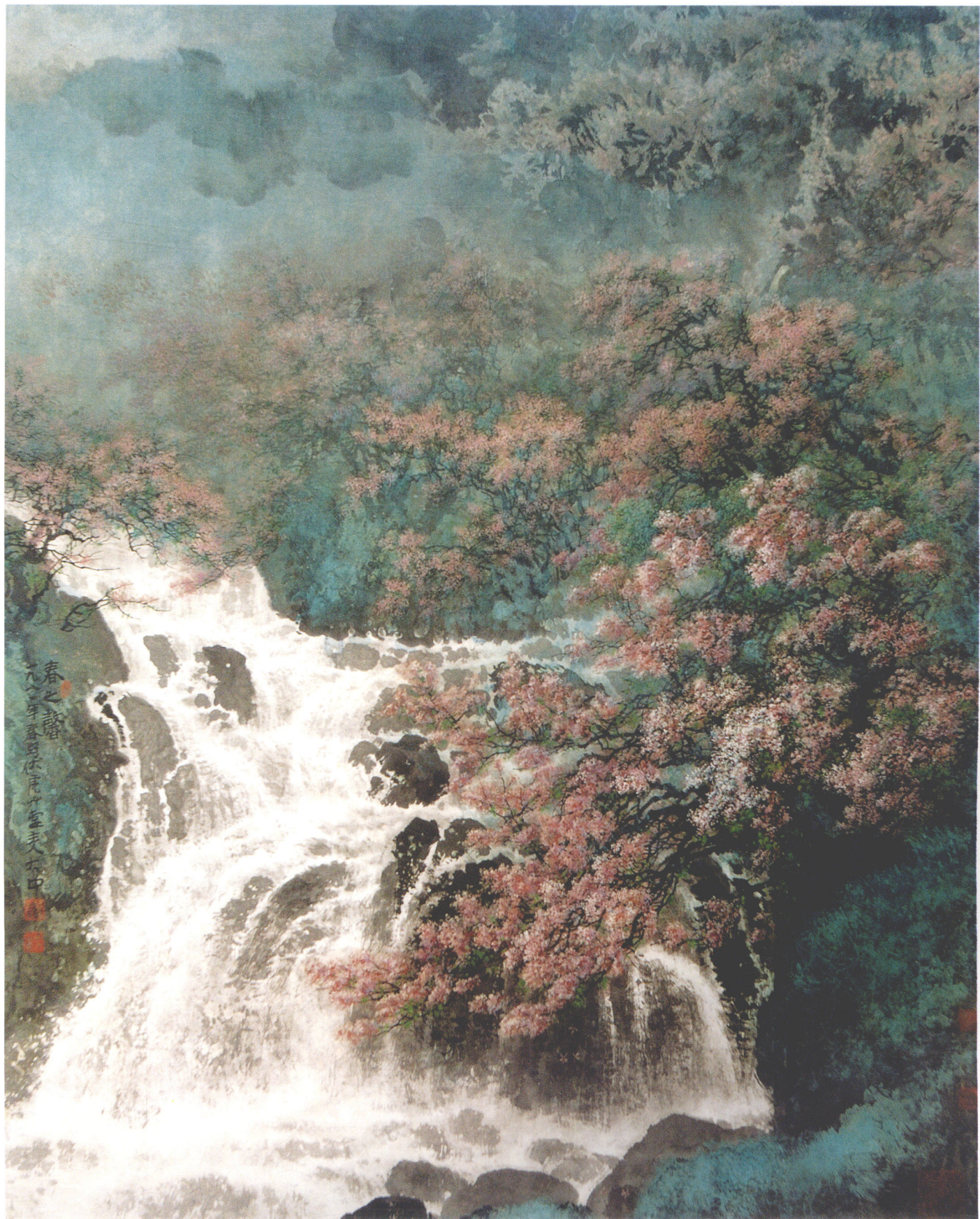
春之馨 冯大中 180 × 140cm