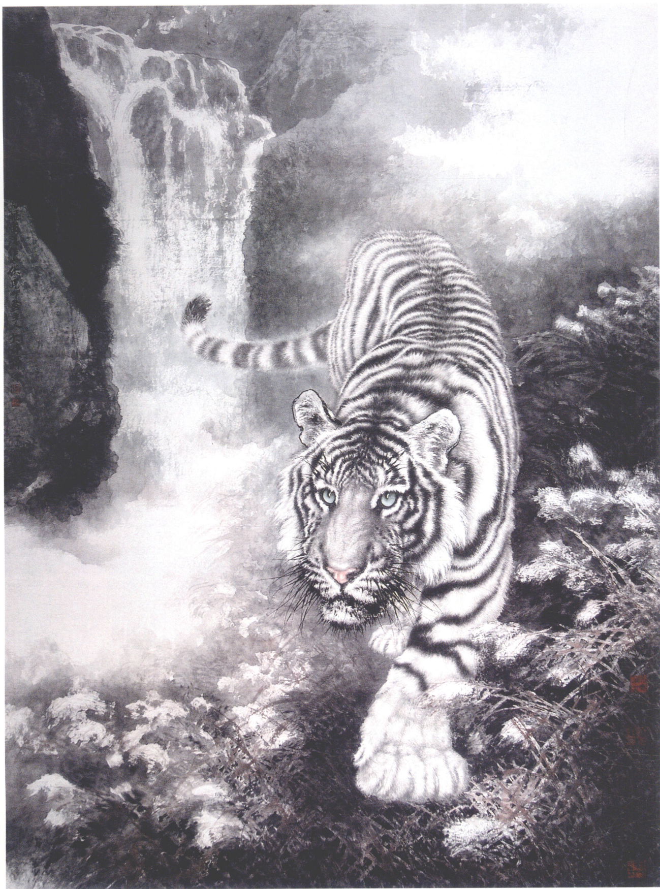
青山着意 冯大中 250 × 150cm