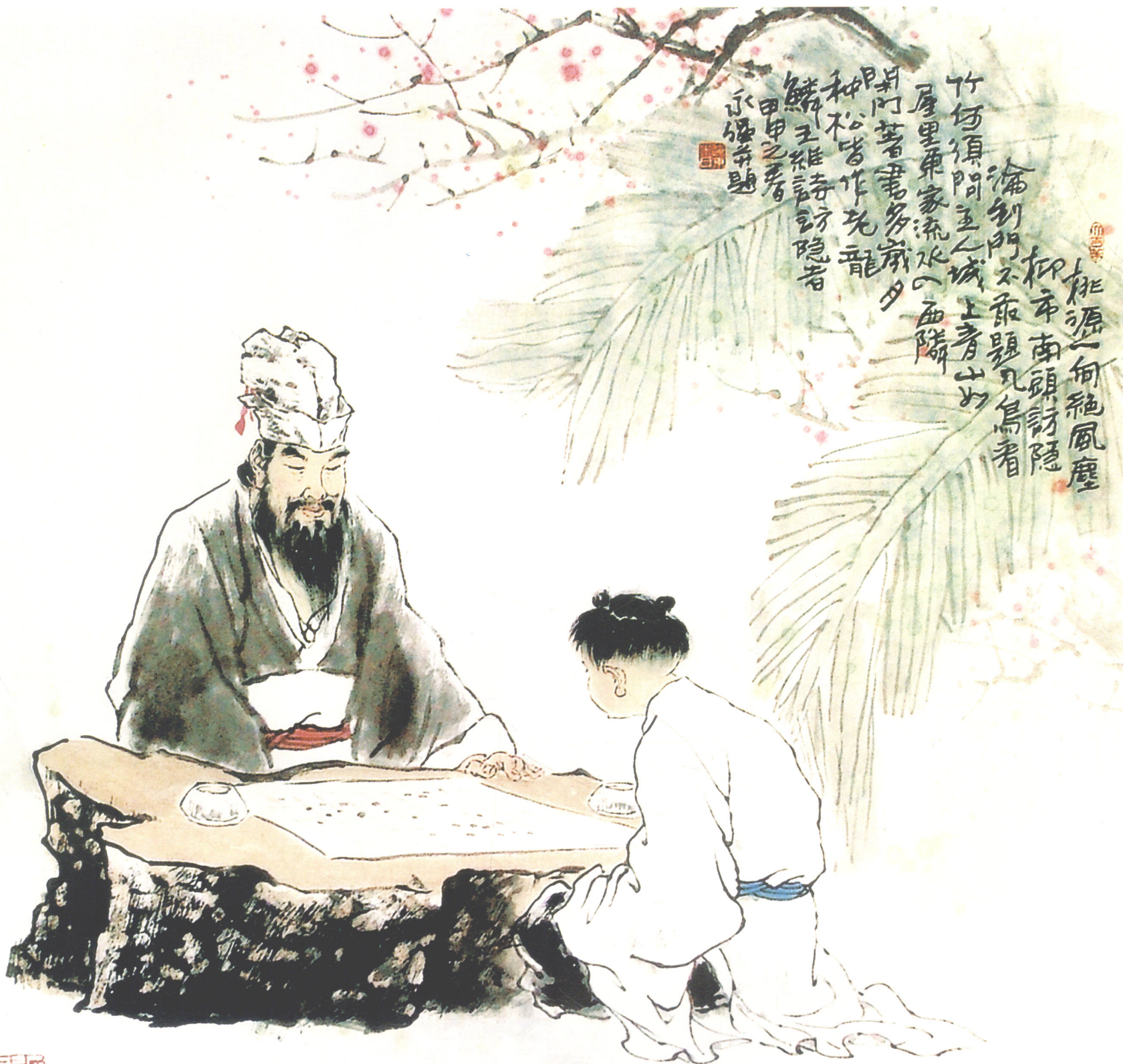
对弈图 米永强 69 × 69cm