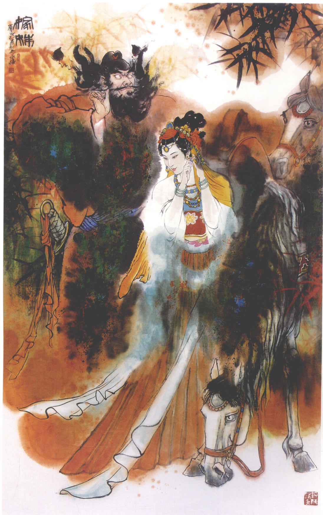
嫁妹 米永强 180 × 120cm