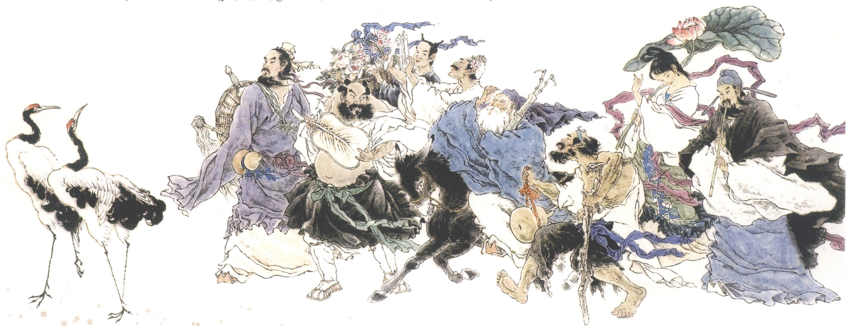
八仙图 米永强 180 × 70cm