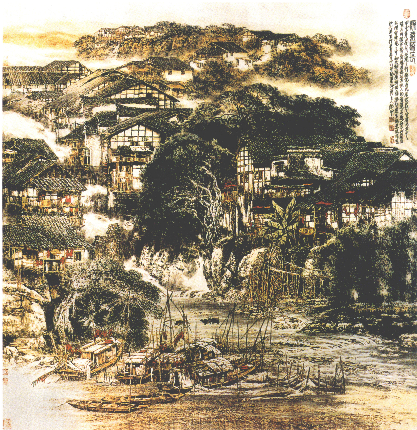
源远流长 李德甲 59 × 47cm