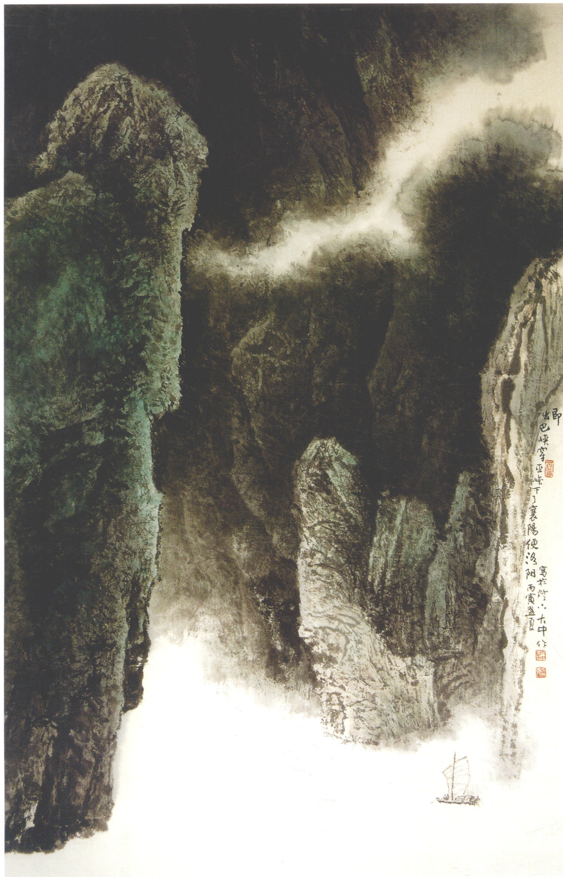
巫峡清秋 冯大中 180×120cm