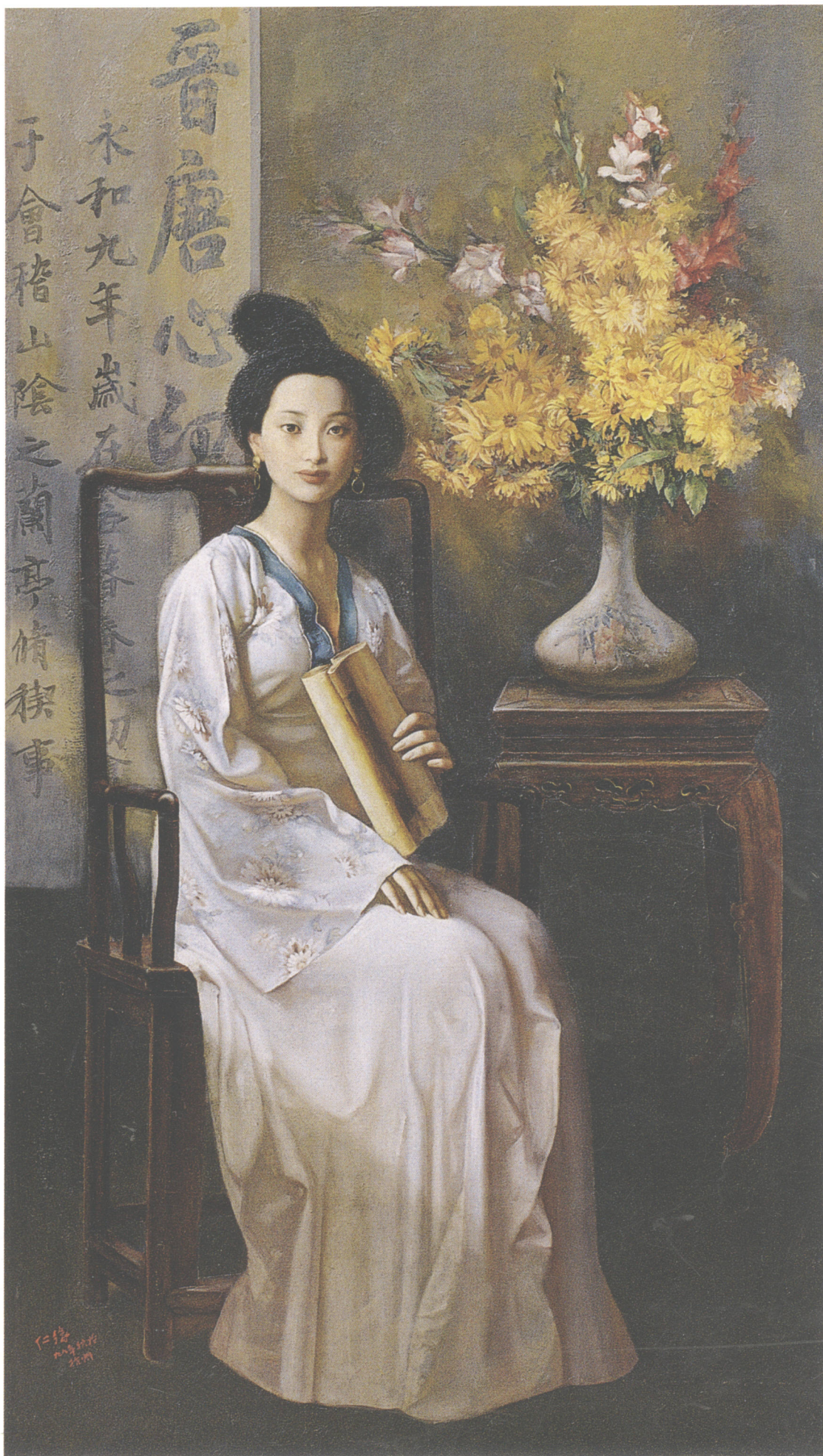
书香门第 A Scholarly Family