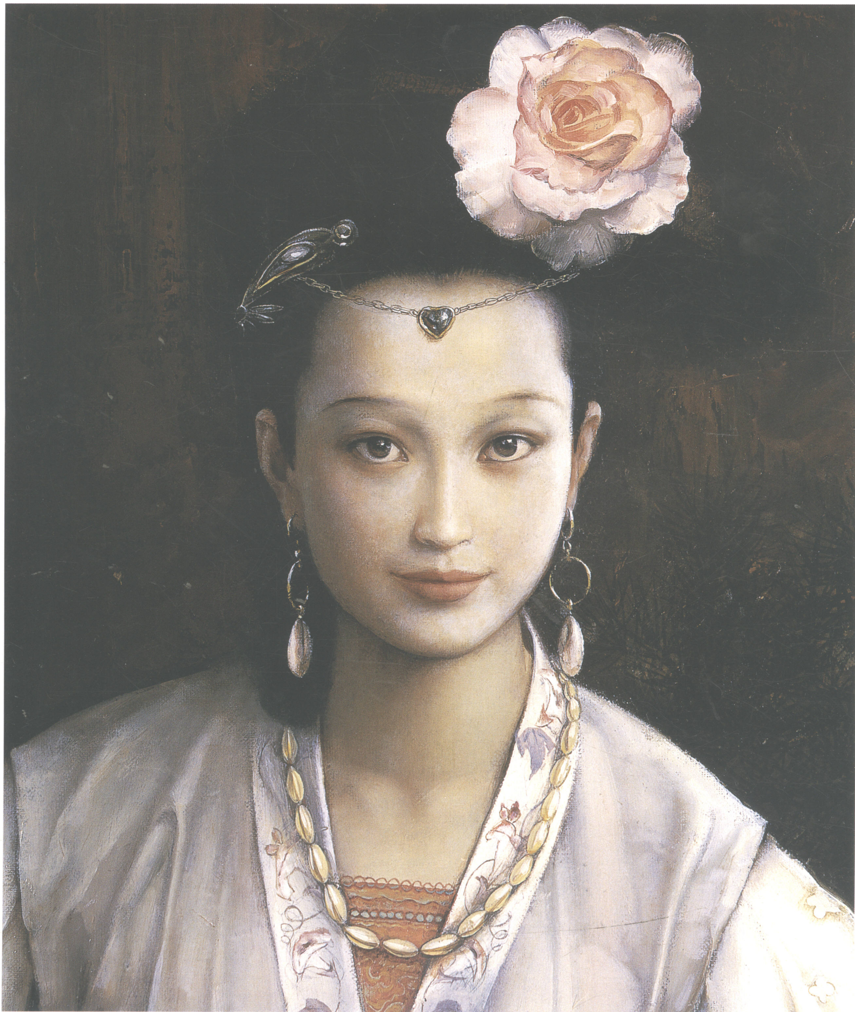
古琴春秋（局部） Graceful Lady Playing Guzheng (Detail)