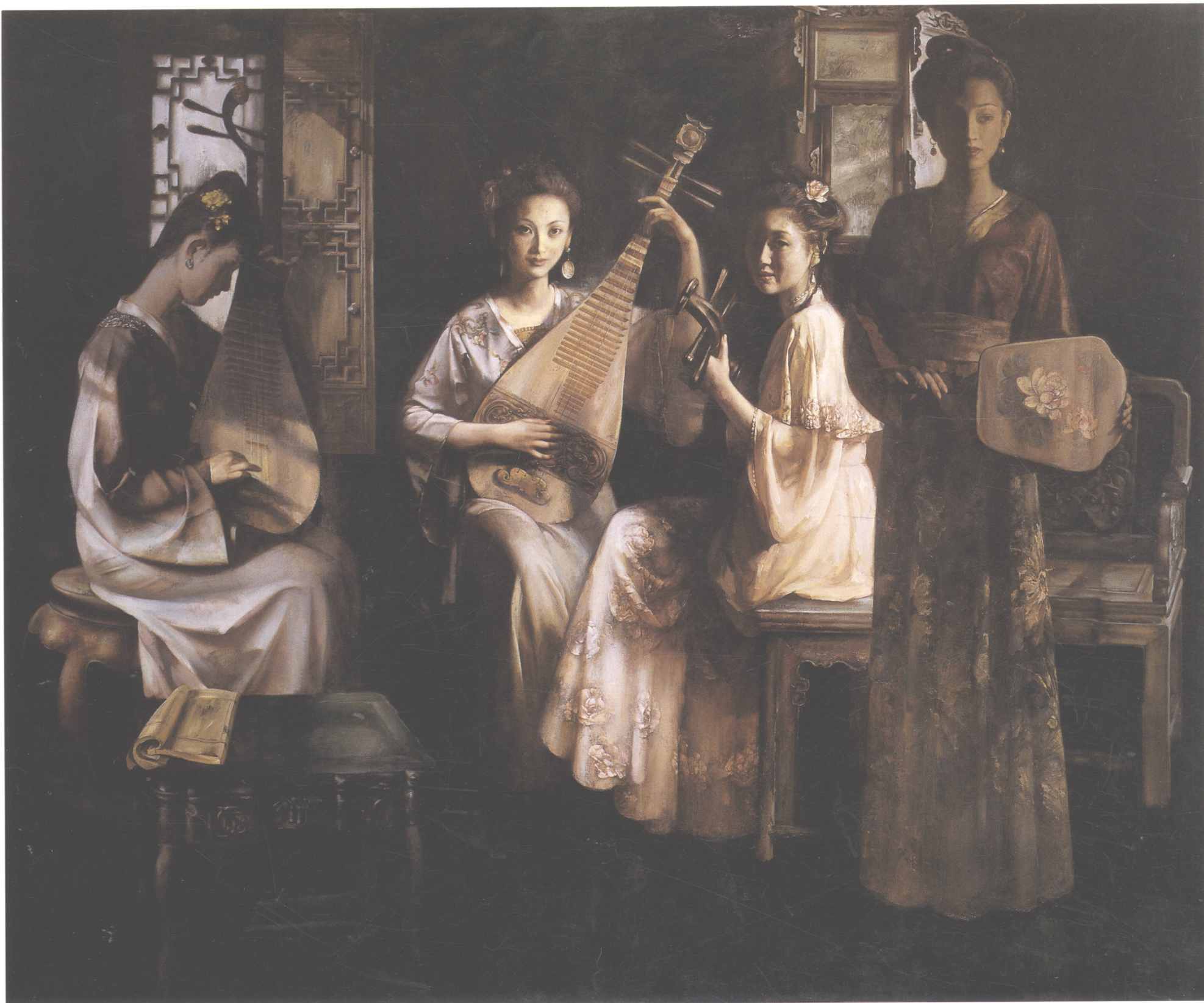
四季歌 Music of All Four Seasons