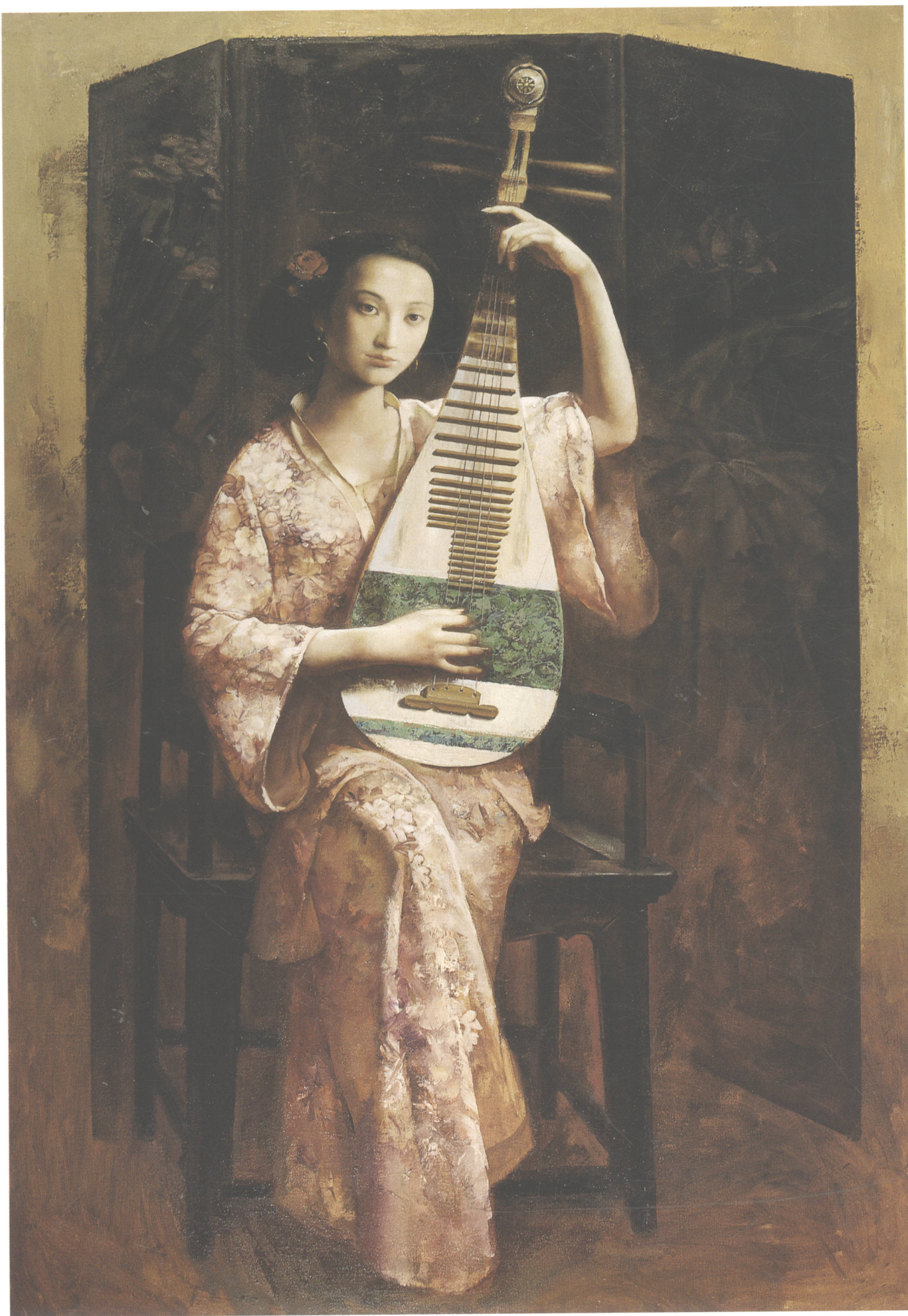
情系琵琶 Passion for Lute