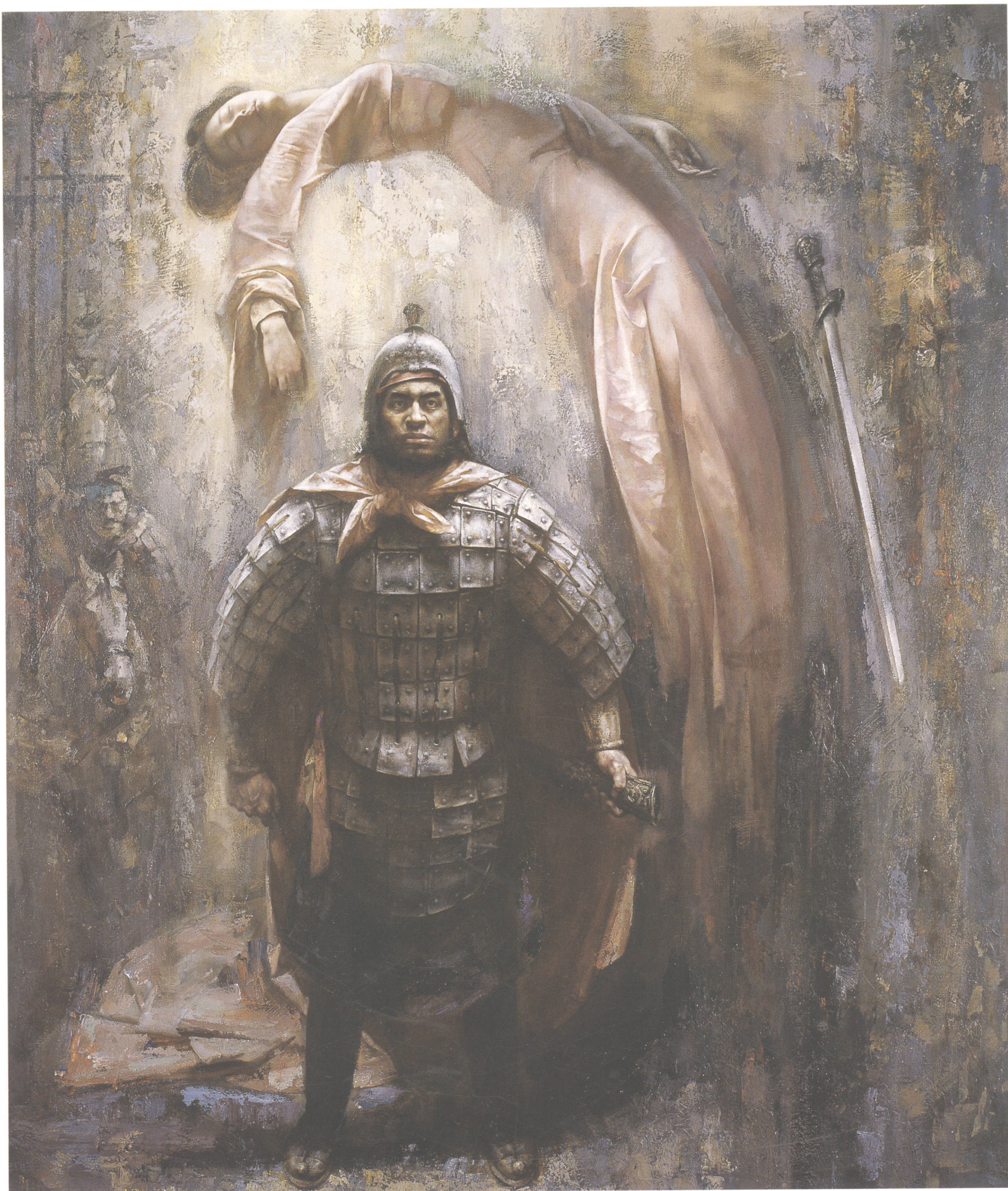
霸王别姬 Farewell to My Concubine