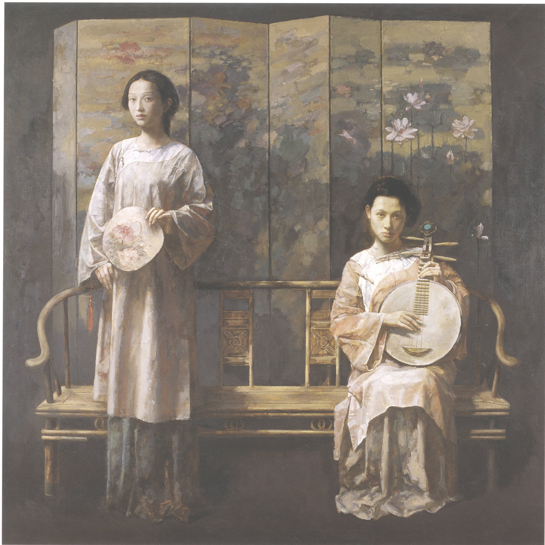
风月颂 Eulogy by Two Graceful Ladies