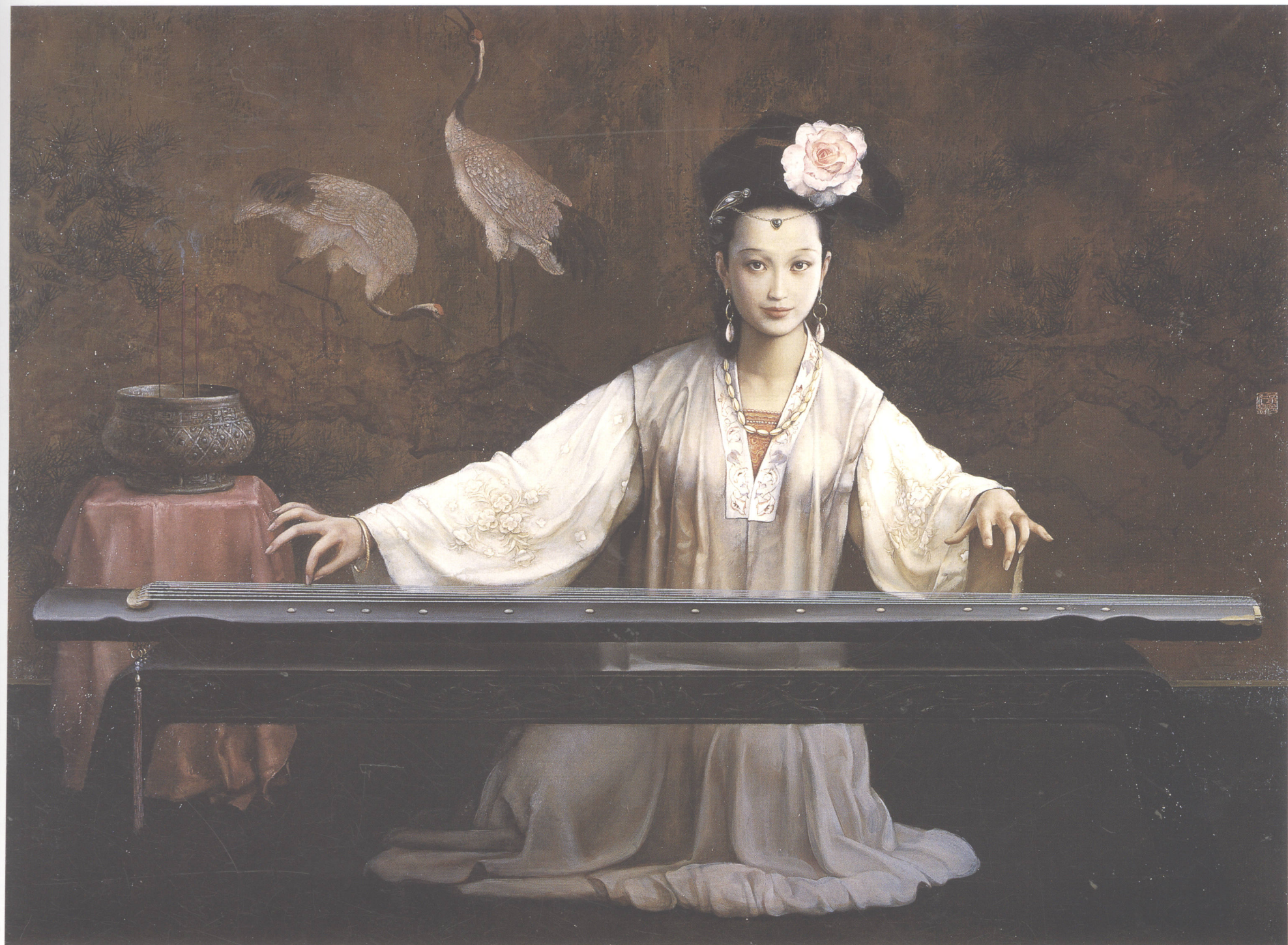
古琴春秋 Graceful Lady Playing Guzheng