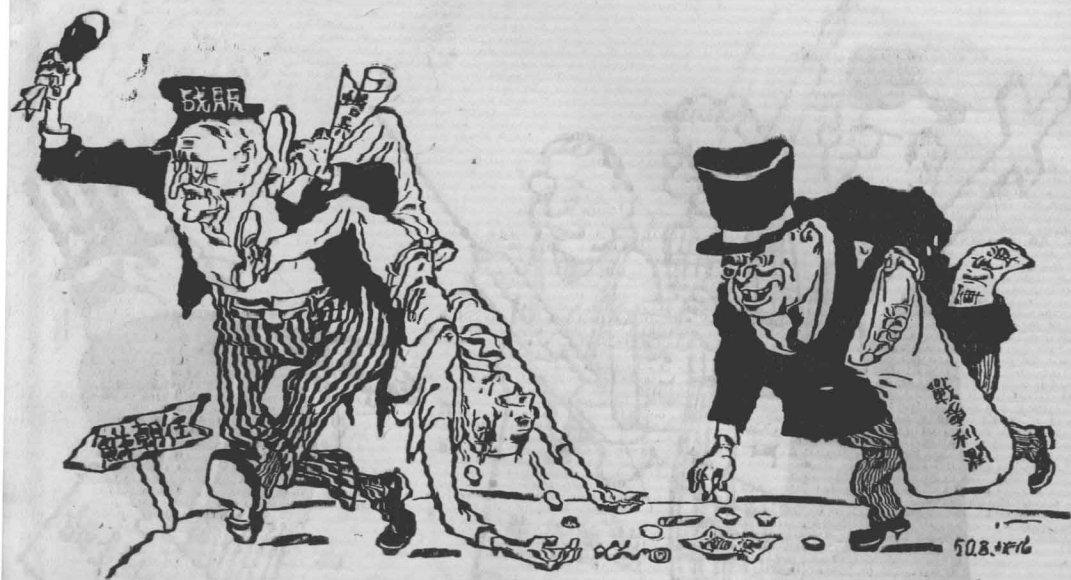
CHANG WEN-YUAN: The Gleaner

While the American man is being dragged to the battle-field in Korea, the gentleman with the nice tophat gracefully picks up every cent shaken out of the poor fellow's pocket.