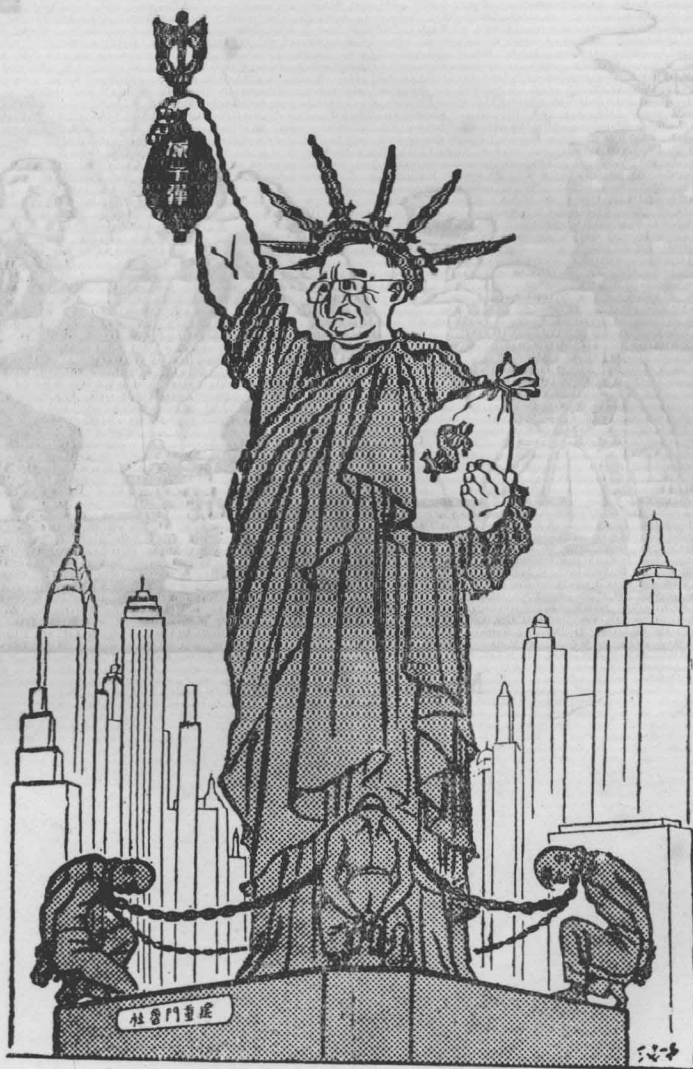
YEH CHIEN-YU: Statue of Liberty

It now has nothing to do with the ideals of the American people; it represents the Wall Street profiteers.