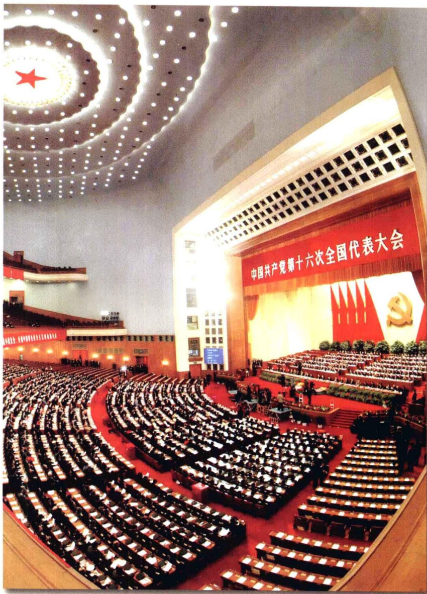
On November 14, 2002, the 16th National Congress of the CPC is brought to a successful conclusion.