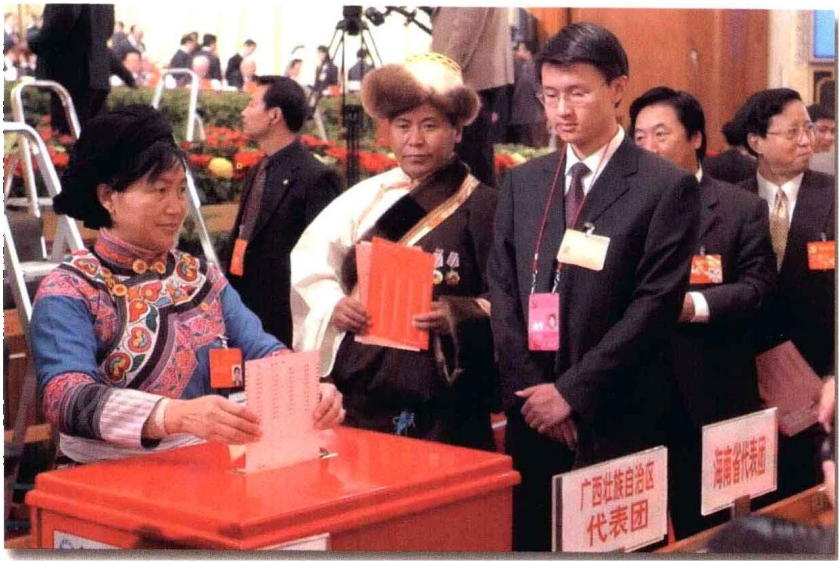
Delegates cast their votes.