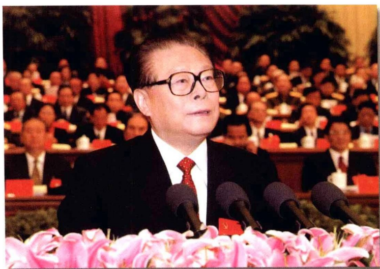
Jiang Zemin, on behalf of the 15th CPC Central Committee, makes a report to the 16th National Congress of the CPC.