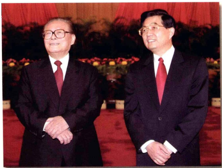
Jiang Zemin (left) and Hu Jintao, the general secretaries of the 15th and 16th CPC Central Committees, respectively.