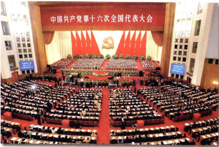
On November 8, 2002, the 16th National Congress of the CPC is inaugurated at the Great Hall of the People in Beijing.