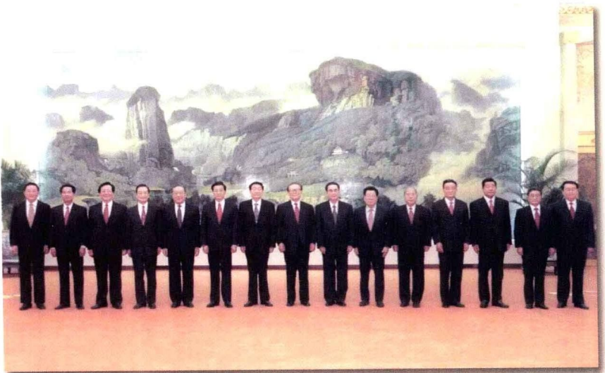
The members of the Politburo Standing Committee of the 15th and 16th Party Central Committees.