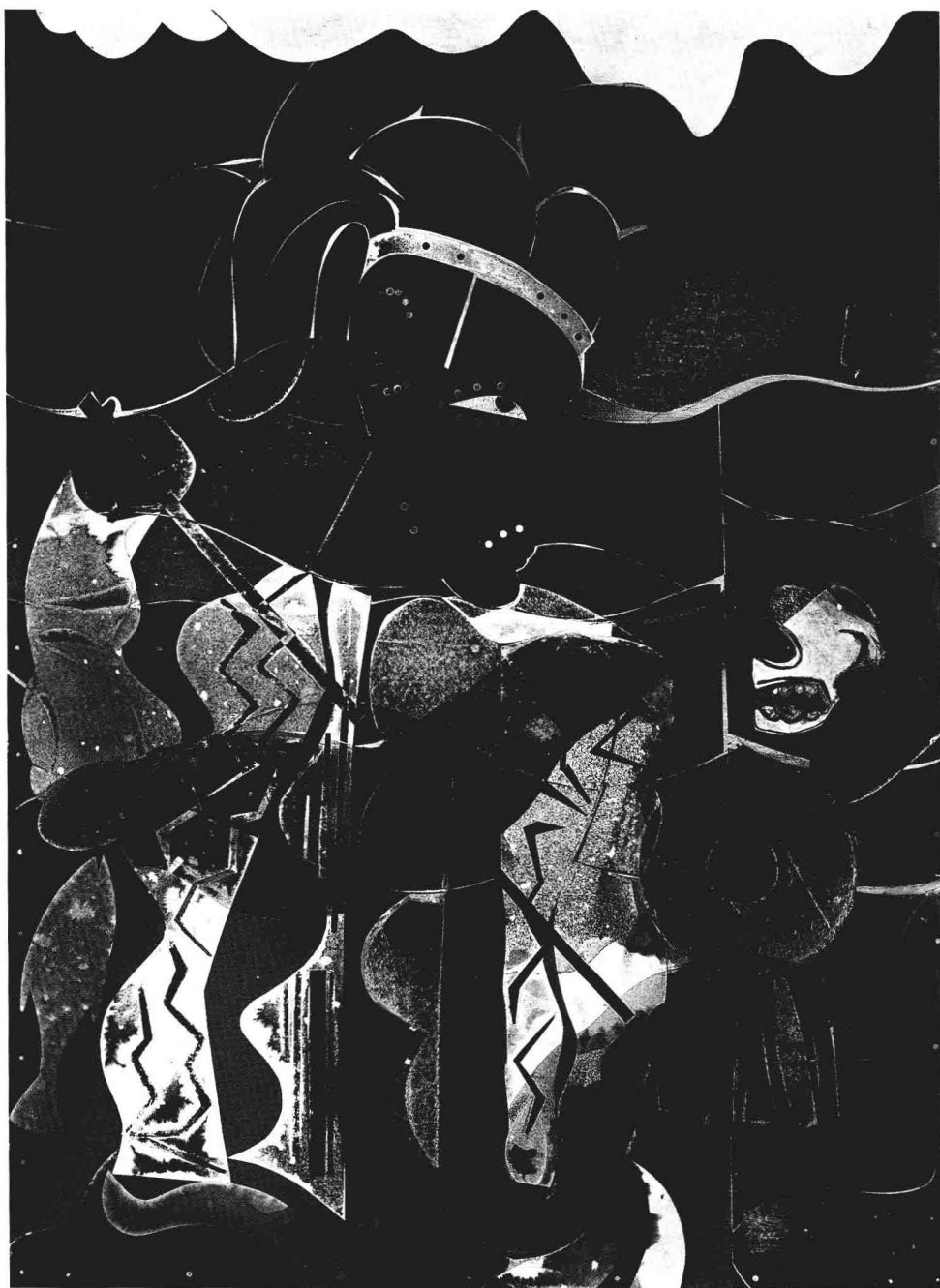
Figure 0.1 The Sea God . 1977. Collage with mixed media on board. Art © Romare Bearden/Licensed by VAGA, New York, NY