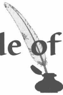
Table of Cases