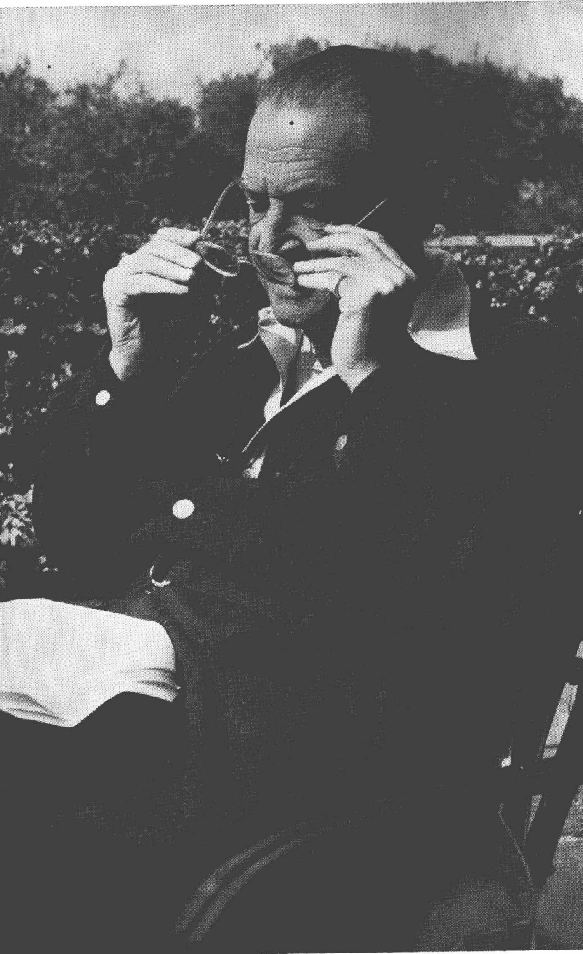
W. SOMERSET MAUGHAM