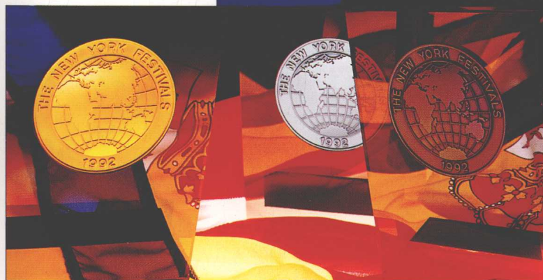
Gold, Silver, and Bronze Awards