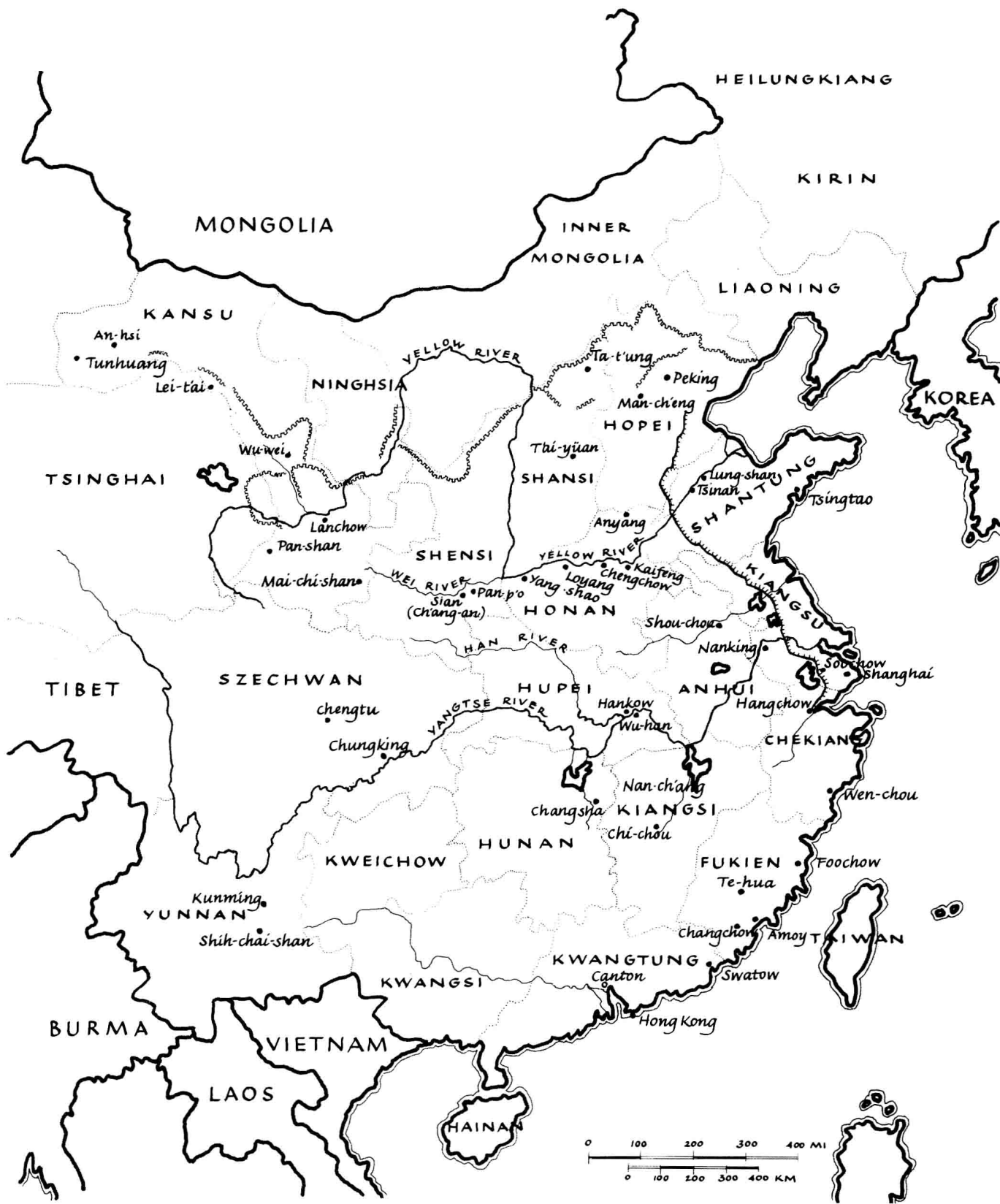
MAP I Modern China.