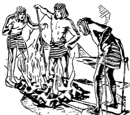
Early Egyptian Method.

While the Egyptians' furnaces were crude, consisting merely of pits into which the ore and fuel were placed, the enduring quality of the wrought iron produced in them is indicated by the excellent condition of implements and other equipment found when exploring ancient tombs.