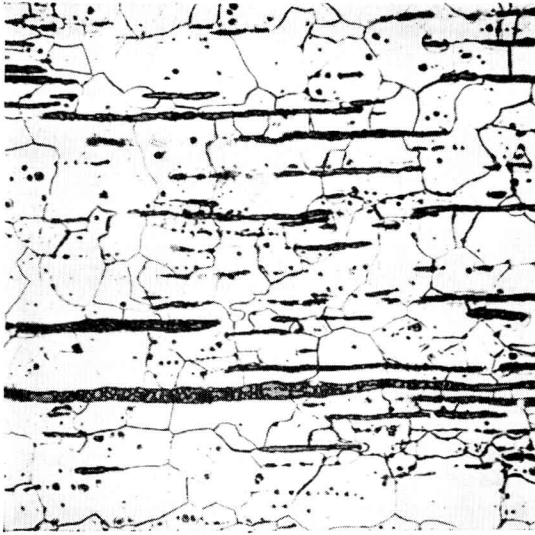
This photomicrograph of wrought iron, taken at 100 magnifications, shows clearly the glass-like siliceous slag fibres entrained in the high purity iron base metal.

particularly its resistance to corrosion and to fatigue.