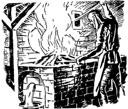
13th Century Improvement — Catalan Forge.

About the eighth century A.D. a new furnace known as the Osmund furnace was developed and used extensively. It was square in cross section, somewhat larger at the top than at the bottom, and approximately ten feet high.