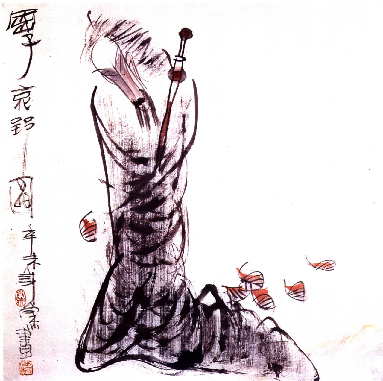
屈子哀郢 Qu Yuan Felt Sorry for the Chu State in the Period of Warring States of Ancient China.(68cm × 68cm)