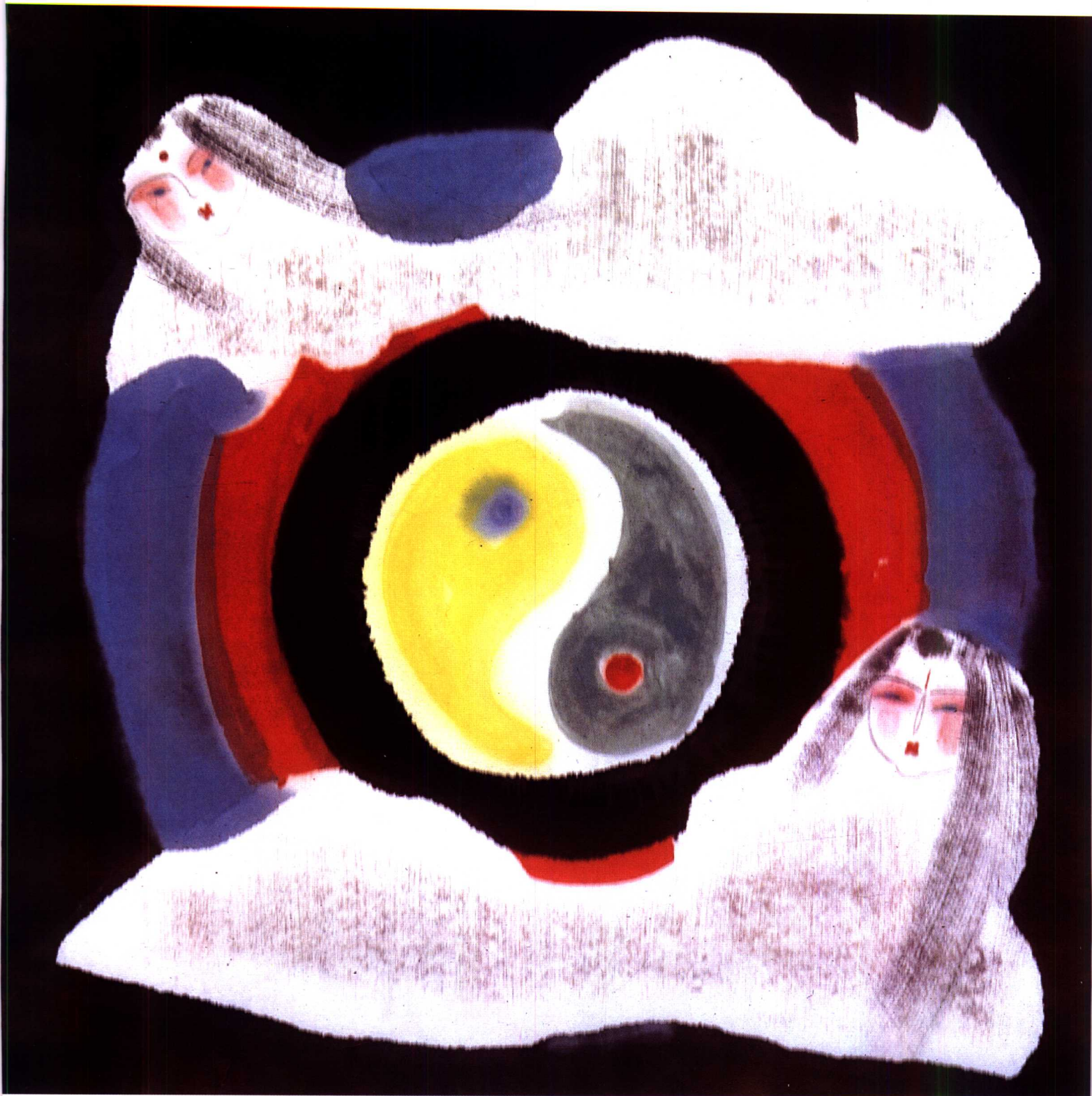
太 极 Taijiquan (shadow boxing). (68cm × 68cm)