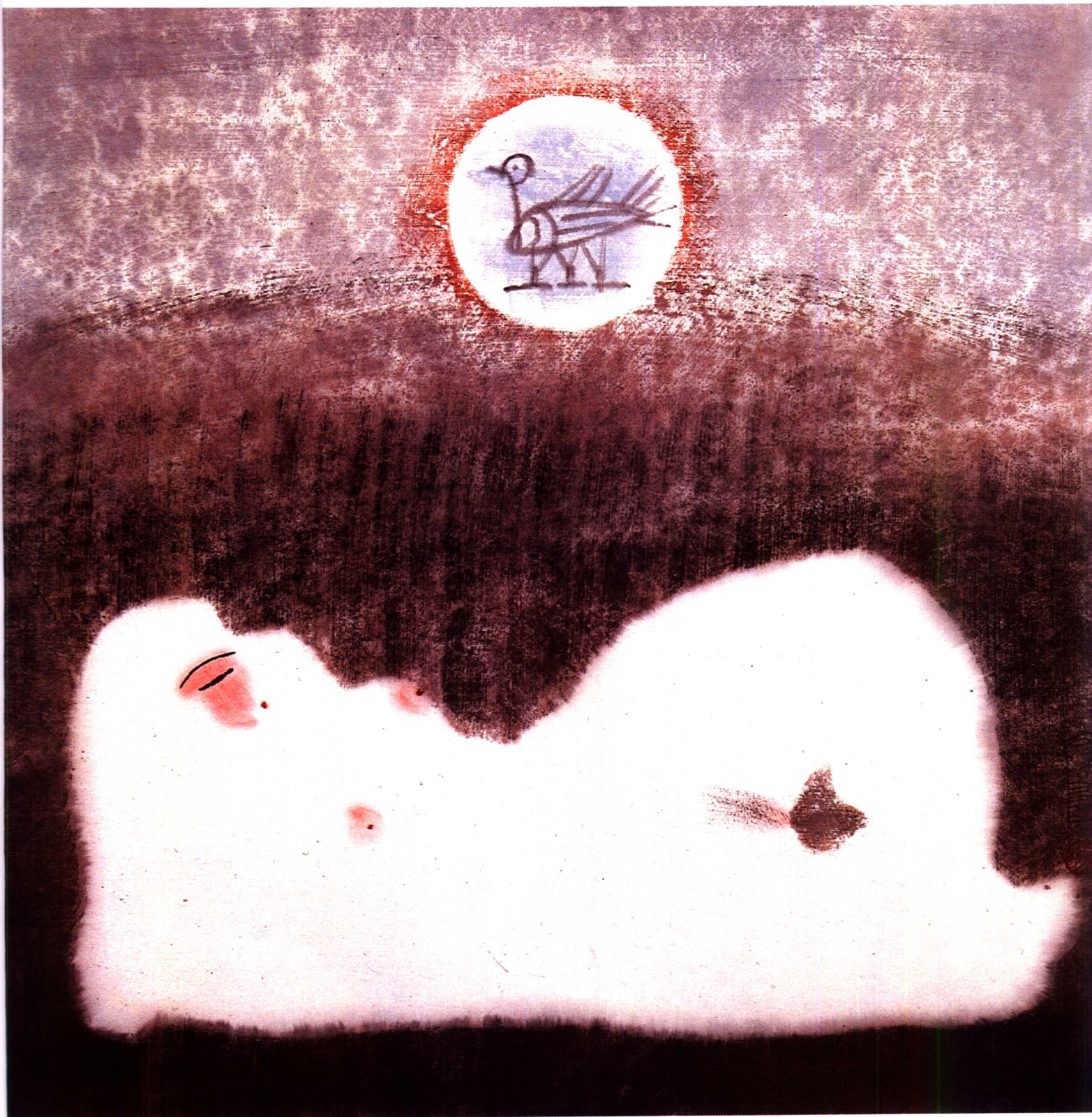
乾坤之间 Celestial and Terrestrial Forces in Harmony. (68cm × 68cm)