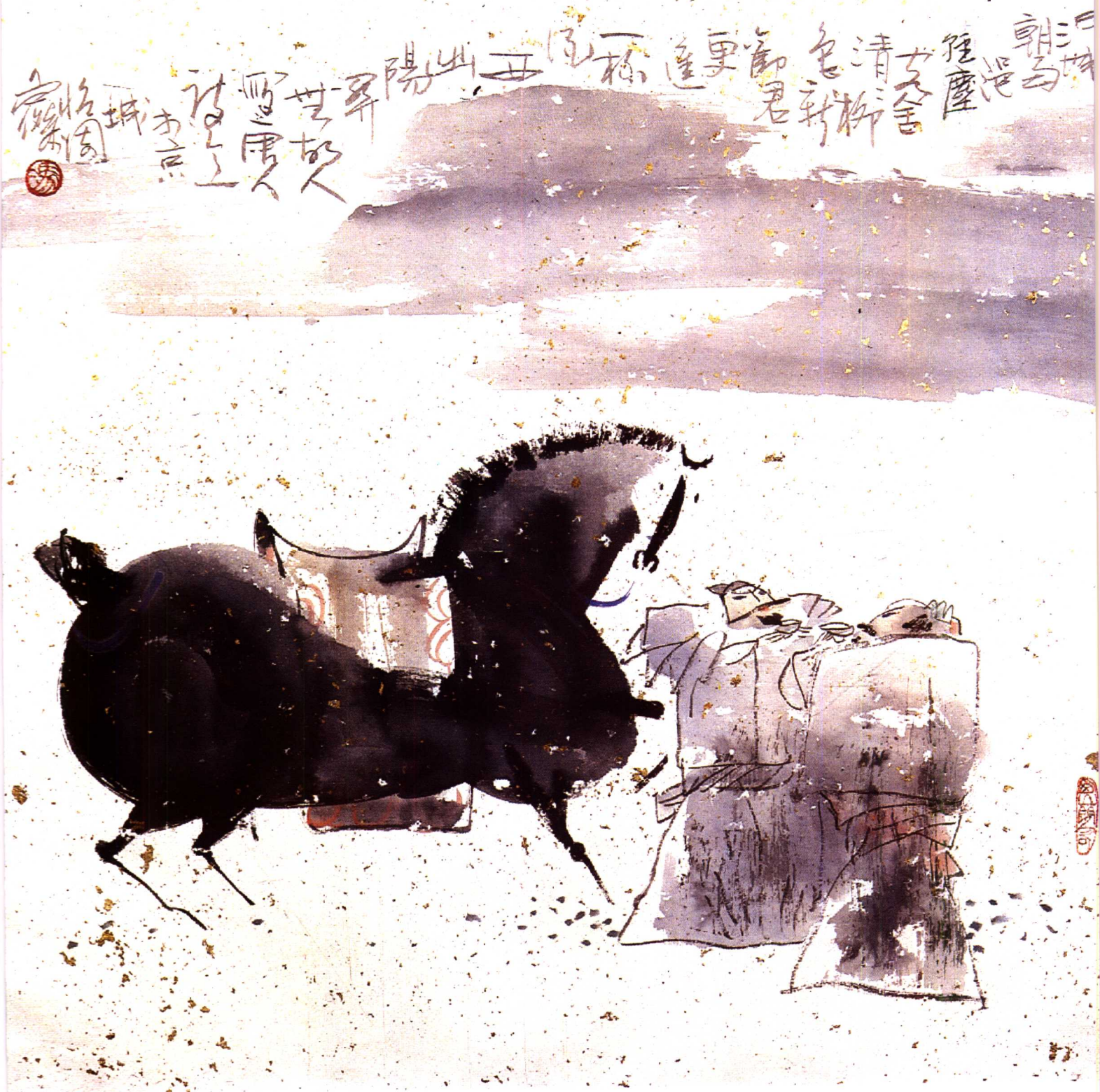
唐人诗意 The Tang Dynasty, Rich in Poetic Flavor. (66cm × 66cm)