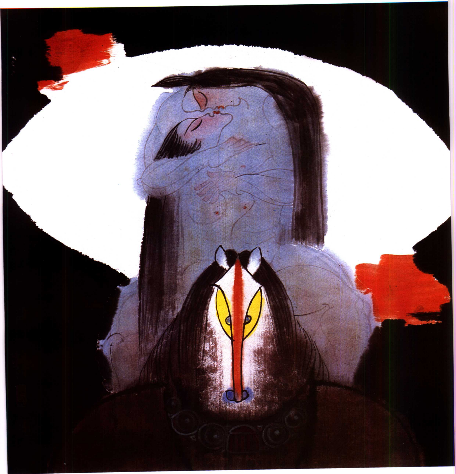
静洁世界 Tranquil World. (68cm × 68cm)