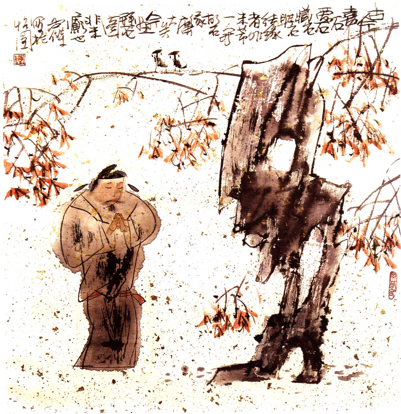
拜石图 Praying before Grotesque Stones. (66cm × 66cm)