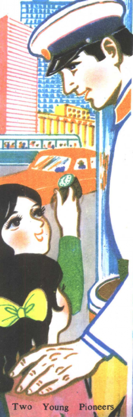
Two Young Pioneers