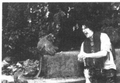
Two monkeys chatting