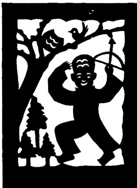
胡巢戴帽 作者 * 賈四貴 Hu Chao Wearing a Cap