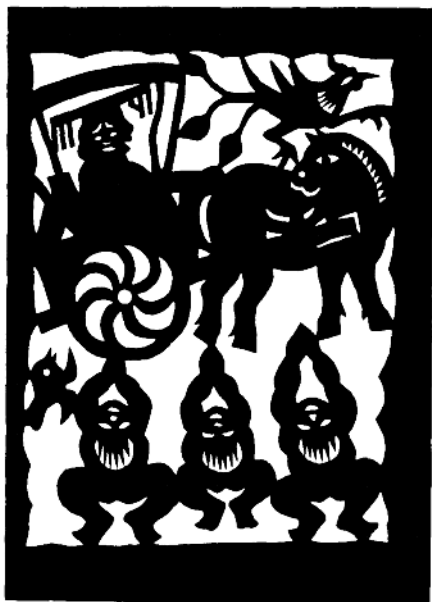
黃帝到橋園 作者 * 賈四貴 Yellow Emperor Coming to Bridge Garden