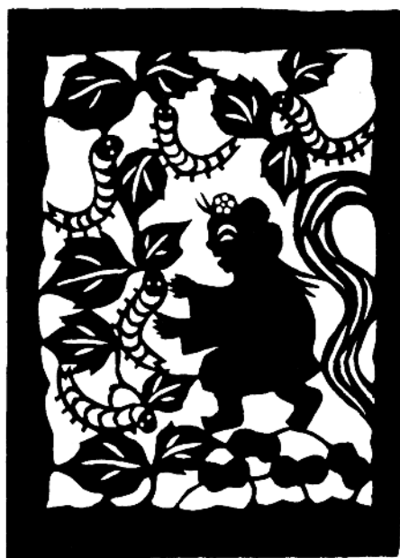
嫫祖養蠶 作者 * 賈四貴 Luo Zu Feeding Silkworms