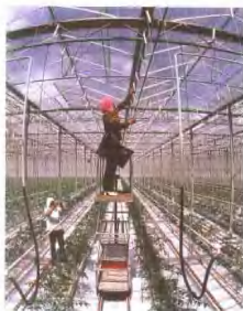
孙桥现代农业开发区 Sunqiao Modern Agriculture Development Zone