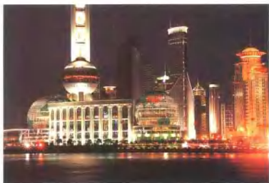
上海国际会议中心 Shanghai International Convention Center