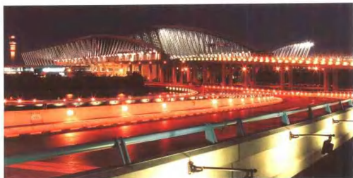
浦东国际机场 Pudong International Airport