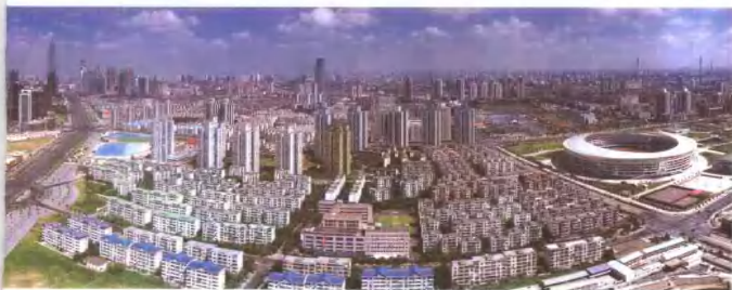
浦东住宅群 Apartment Buildings in Pudong