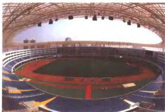
浦东源深体育场 Pudong Yuanse Sports Center