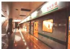
地铁二号线 Metro Line Two