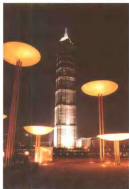
金茂大厦 Grand Hyatt Shanghai