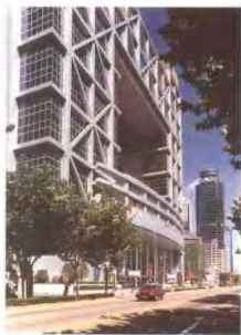
上海证券交易所 Shanghai Securities Exchange