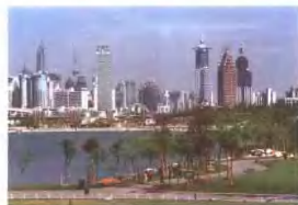
世纪公园 Century Park