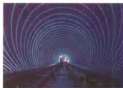
黄浦江越江观光隧道 Huangpu River Pylstran Tunnel for Sightseeing