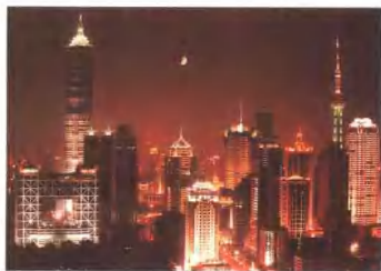
绚丽多彩的中央商务区 Bright And Colorful Central Business District