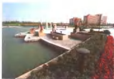
中农高科技园区 Zhongnong High-Tech Park