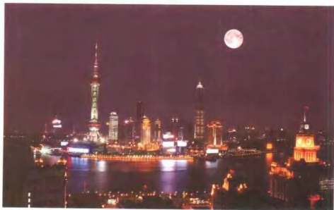
灯火辉煌的浦东新区 Brilliantly Illuminated PNA