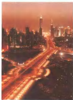
世纪大道 Century Boulevard