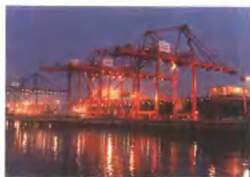
外高桥保税区码头 Wharf in Waigaoqiao Free Trade Zone