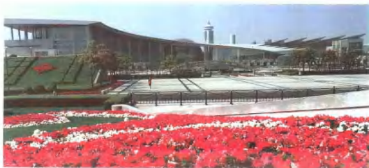
上海科技馆 Shanghai Science And Technology Museum