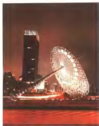
城市雕塑——太阳冠 City Sculpture — Solar Crown