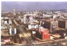
金桥出口加工区 Jiaopin Export Processing Zone