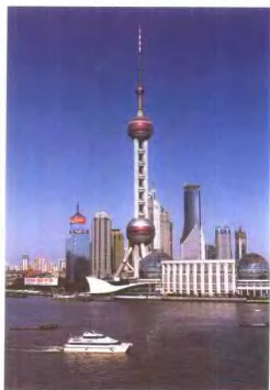
上海东方明珠广播电视塔 Shanghai Oriental Pearl Radio And Television Tower