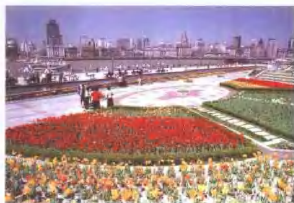
滨江大道 Bijiang Boulevard