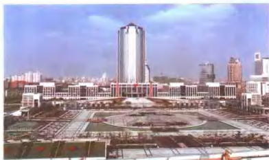
浦东行政办公大楼 Office Building of PNA Government