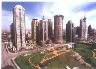
陆家嘴金融贸易区中心绿地 Central Green in Lujiazui Finance And Trade Zone