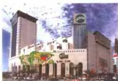
浦东第一八佰伴商厦 Pudong New Century Commercial Building of Shanghai Yaohan