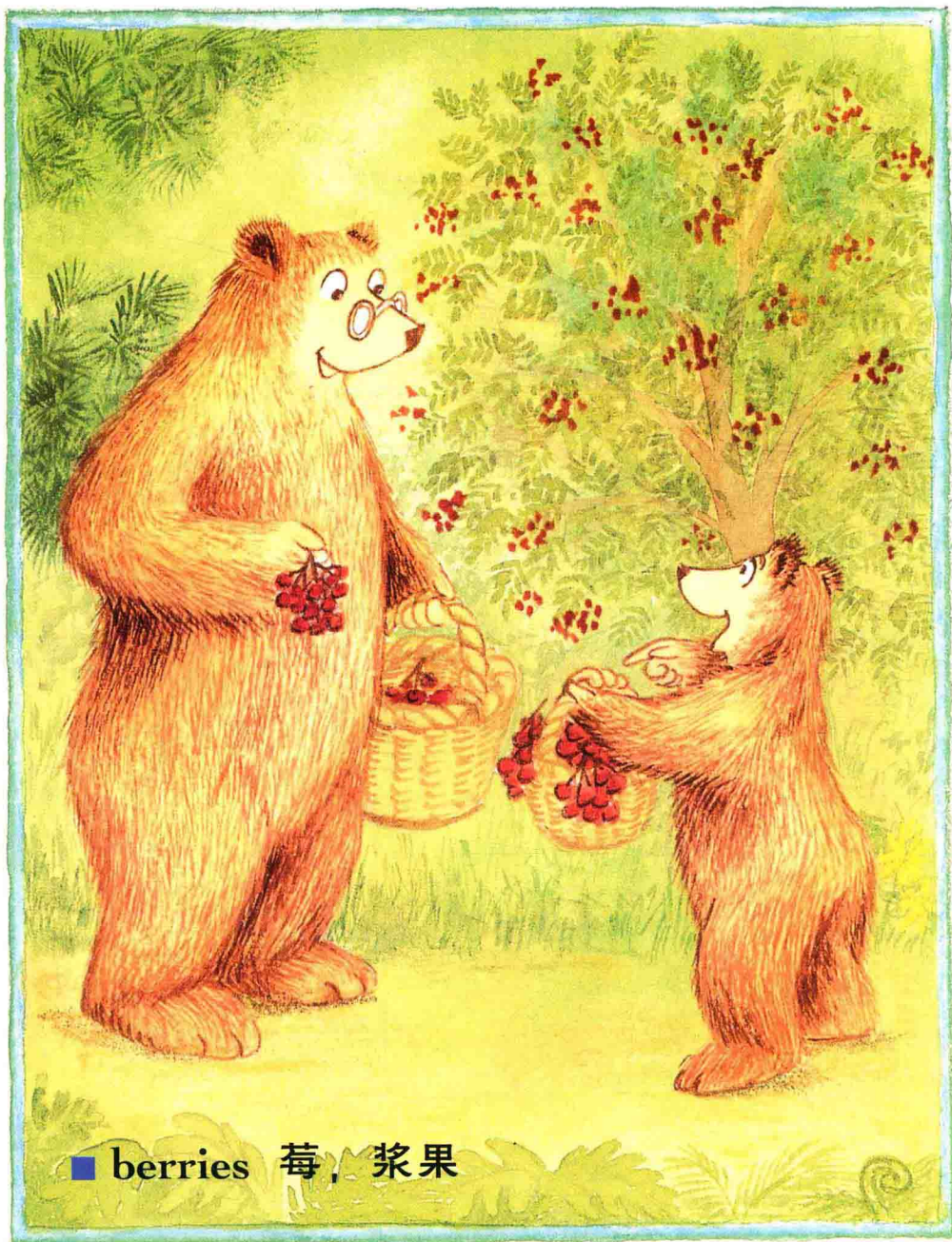
■ berries 莓, 浆果