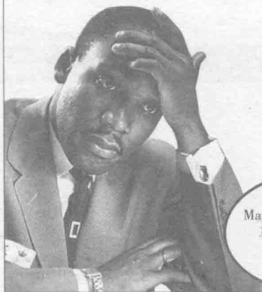
Martin Luther King, Jr. 马丁·路德·金 August 28, 1963