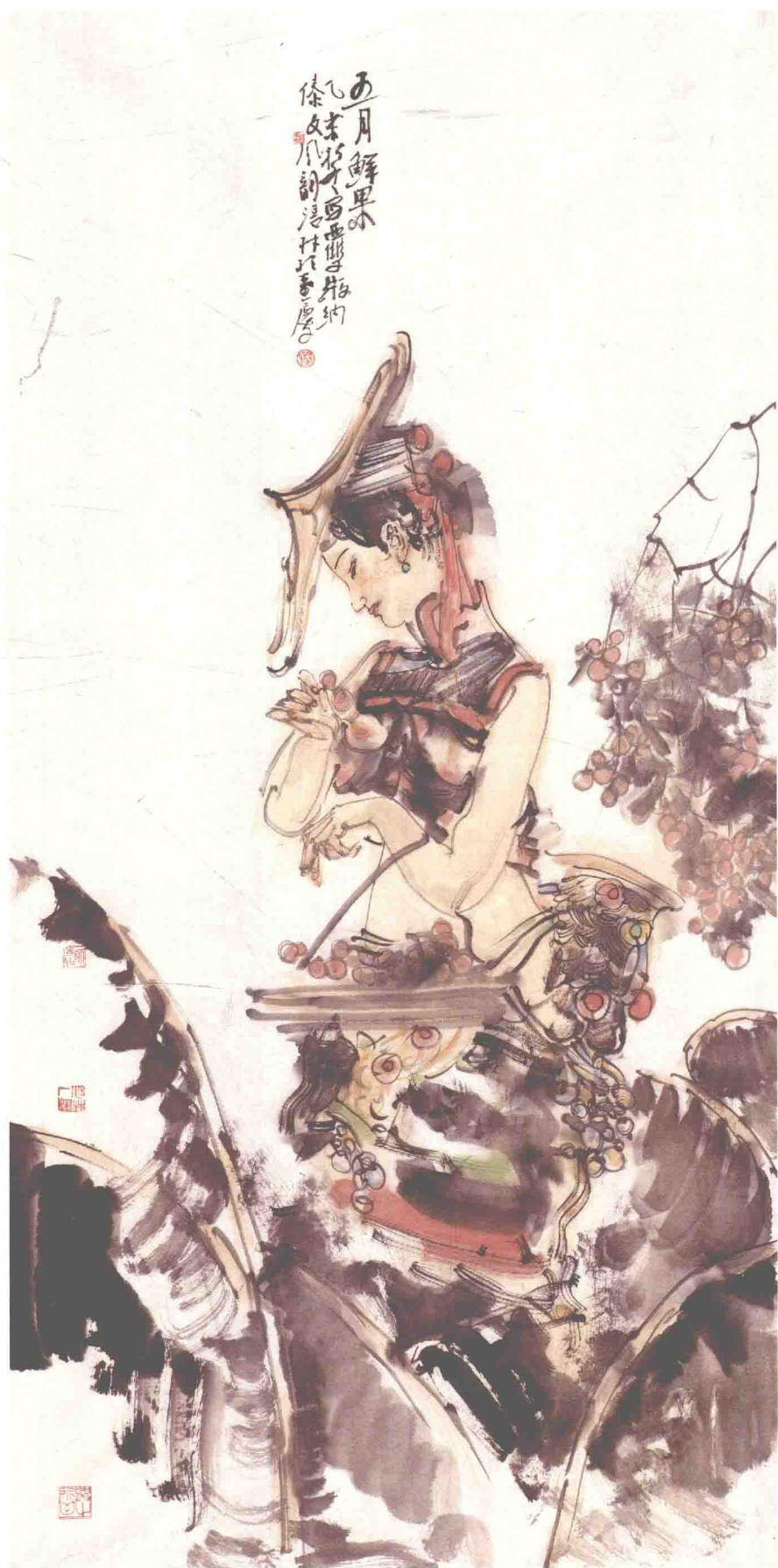
五月鲜果 136 cmX68 cm 2015