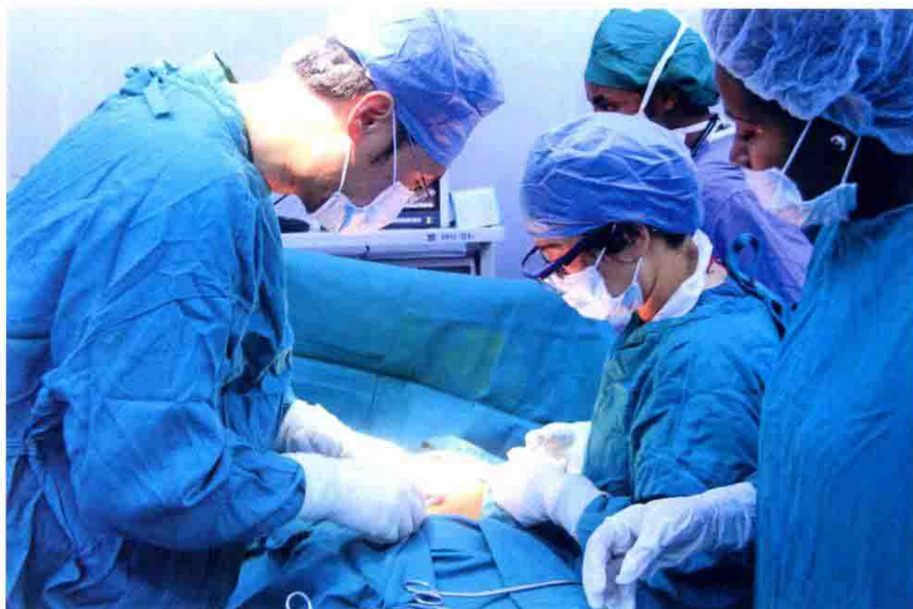
| Interdisciplinary collaboration and laparotomy