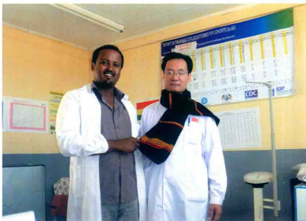
| Ethiopian local doctor presented scarf to the author