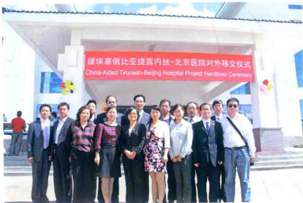
Picture of 16 th batch of China Medical Team to Ethiopia at the China-Ethiopia Friendship Hospital (Tirunesh-Beijing Hospital)