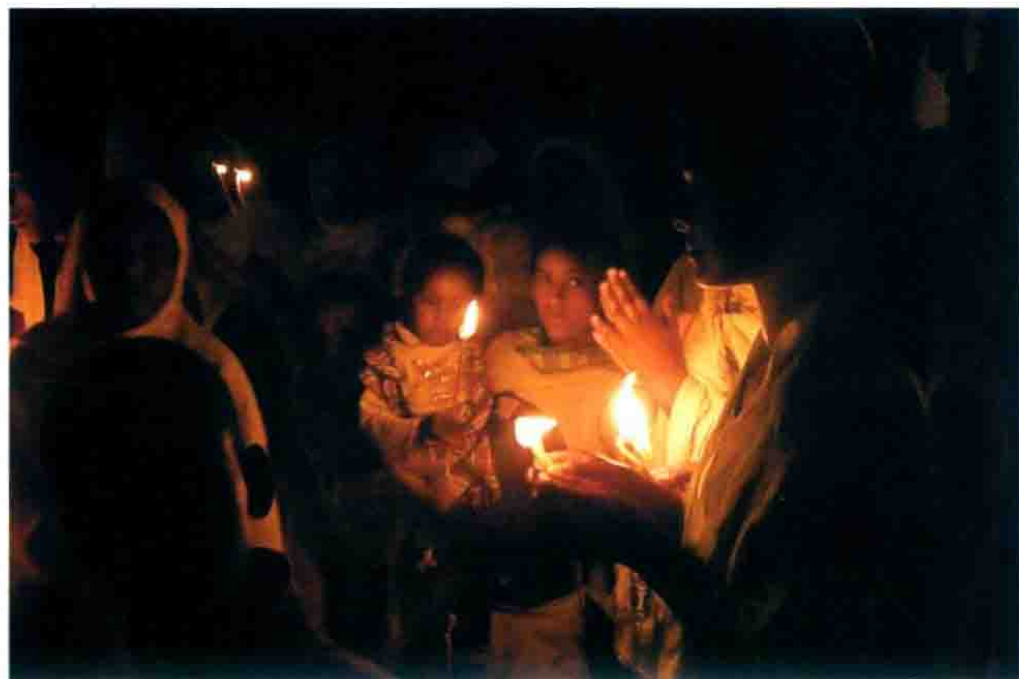
| Meskel Festival of Ethiopia