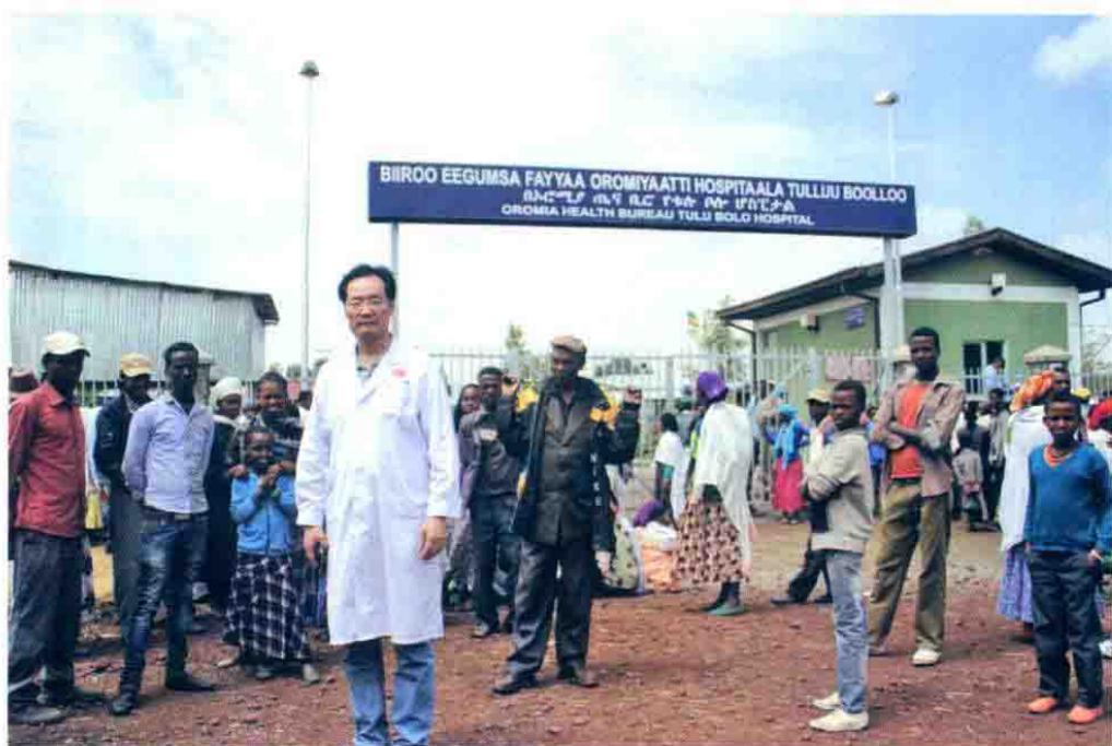
| The author's medical team made rounds of visits to a small town hospital in Ethiopia