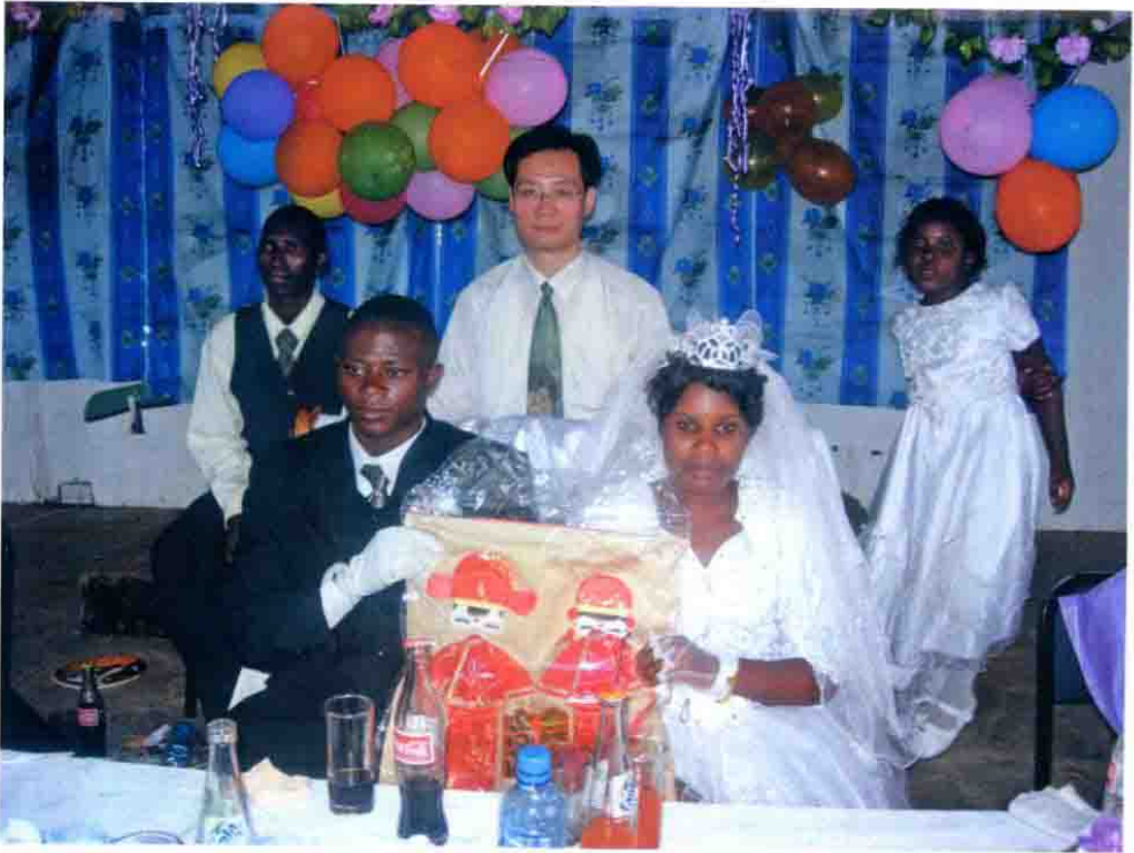
| The author was invited to attend a wedding in Zambia