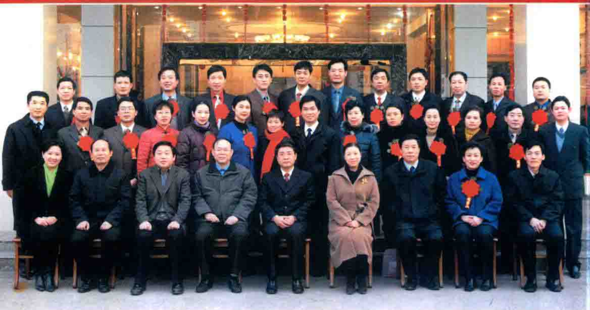
Picture of the 13 th batch of China Medical Team to Zambia and leaders of the Henan provincial health department before going abroad