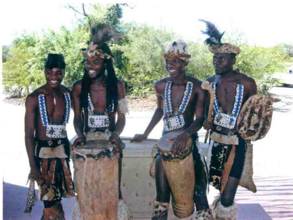
| Passionate African songs and dances