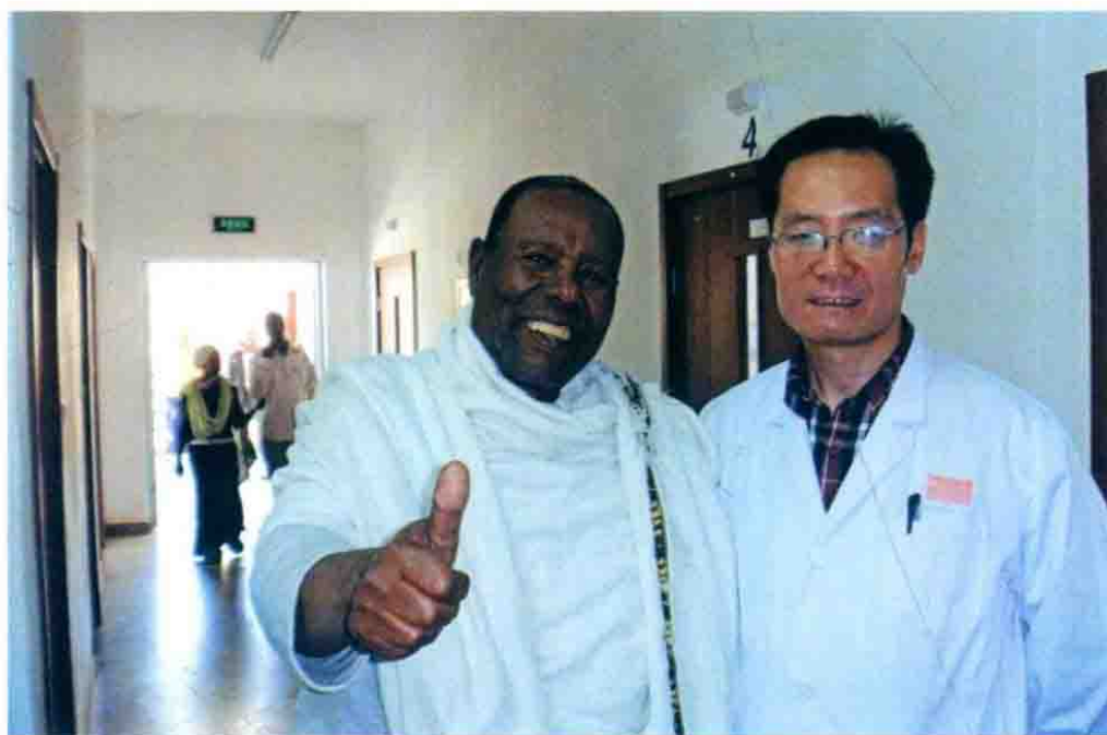
| The author and an Ethiopian patient