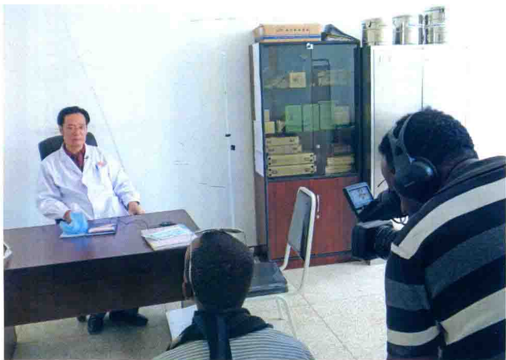
| The author was interviewed by local media in Ethiopia