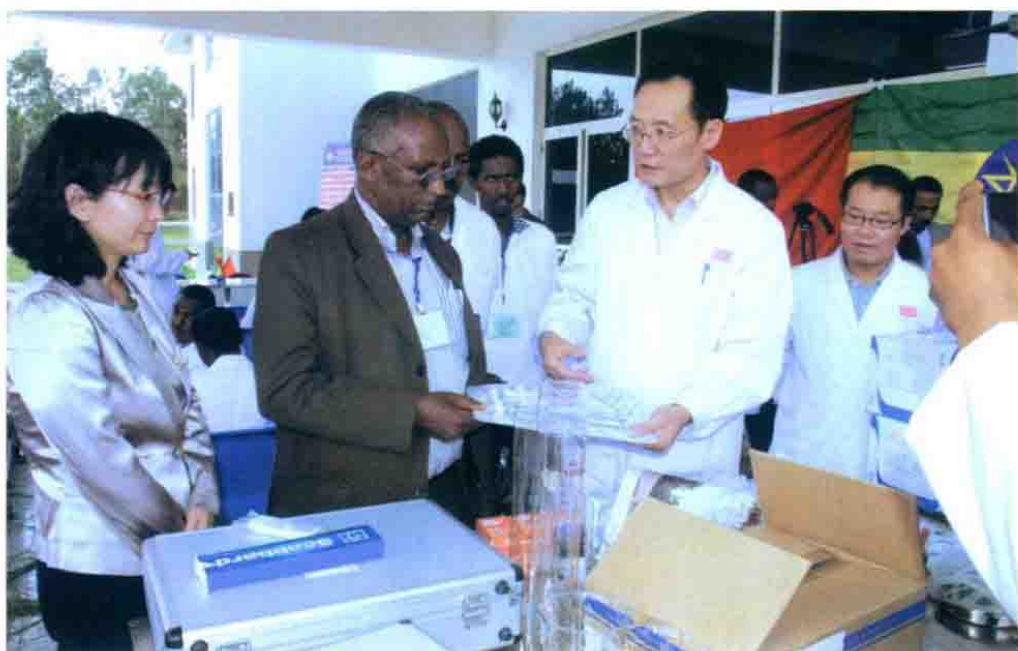
The author donated medicine and equipment to the Ethiopian side on behalf of China Medical Team