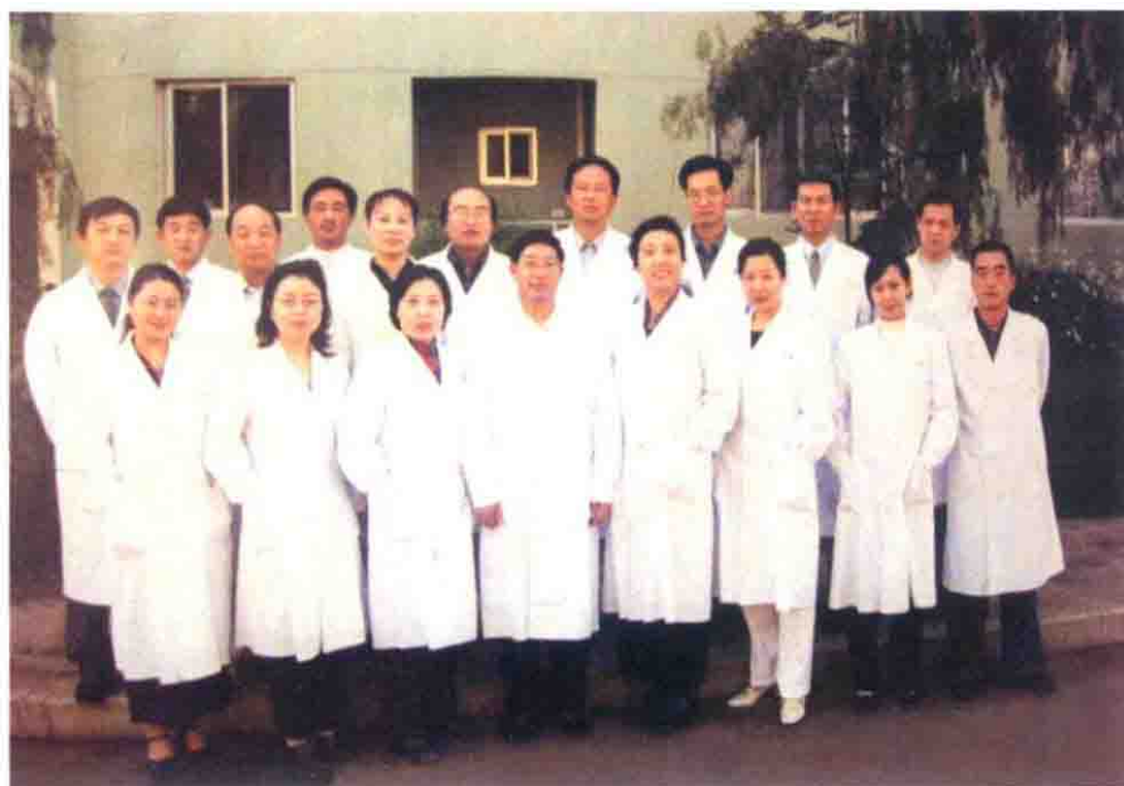
Picture of the 2 nd batch of China Medical Team to Eritrea at quarters