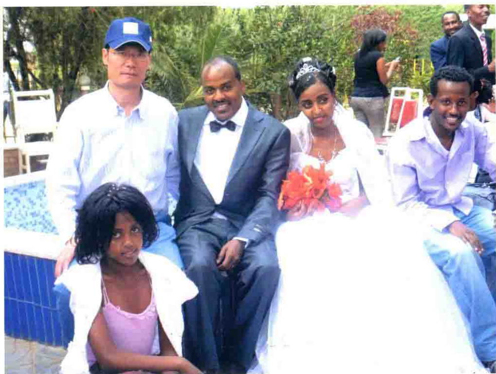
| The author was invited to attend a wedding in Ethiopia