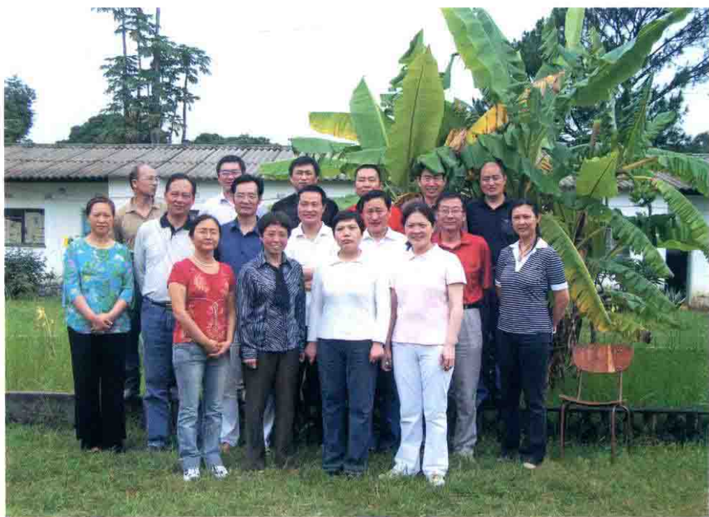
Picture of part of members of 14 th batch of China Medical Team to Zambia at quarters in Ndola in Spring Festival