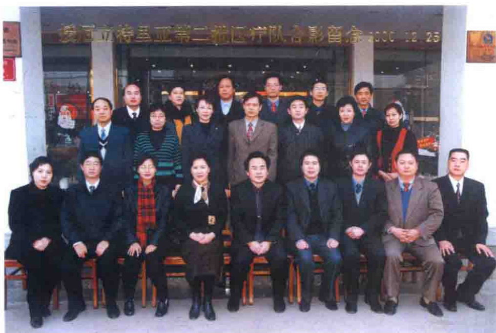
Picture of the 2 nd batch of China Medical Team to Eritrea and leaders of the Henan provincial health department before going abroad