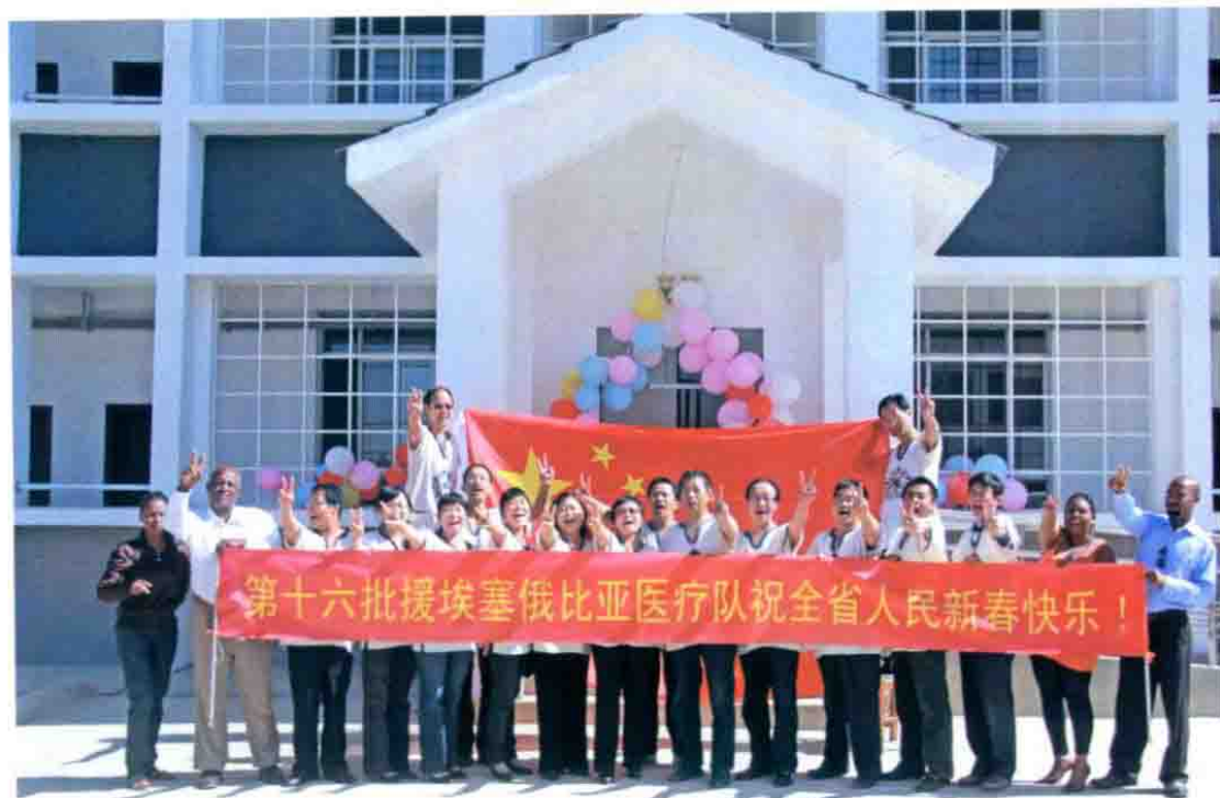
Picture of 16 th batch of China Medical Team to Ethiopia at quarters in Spring Festival