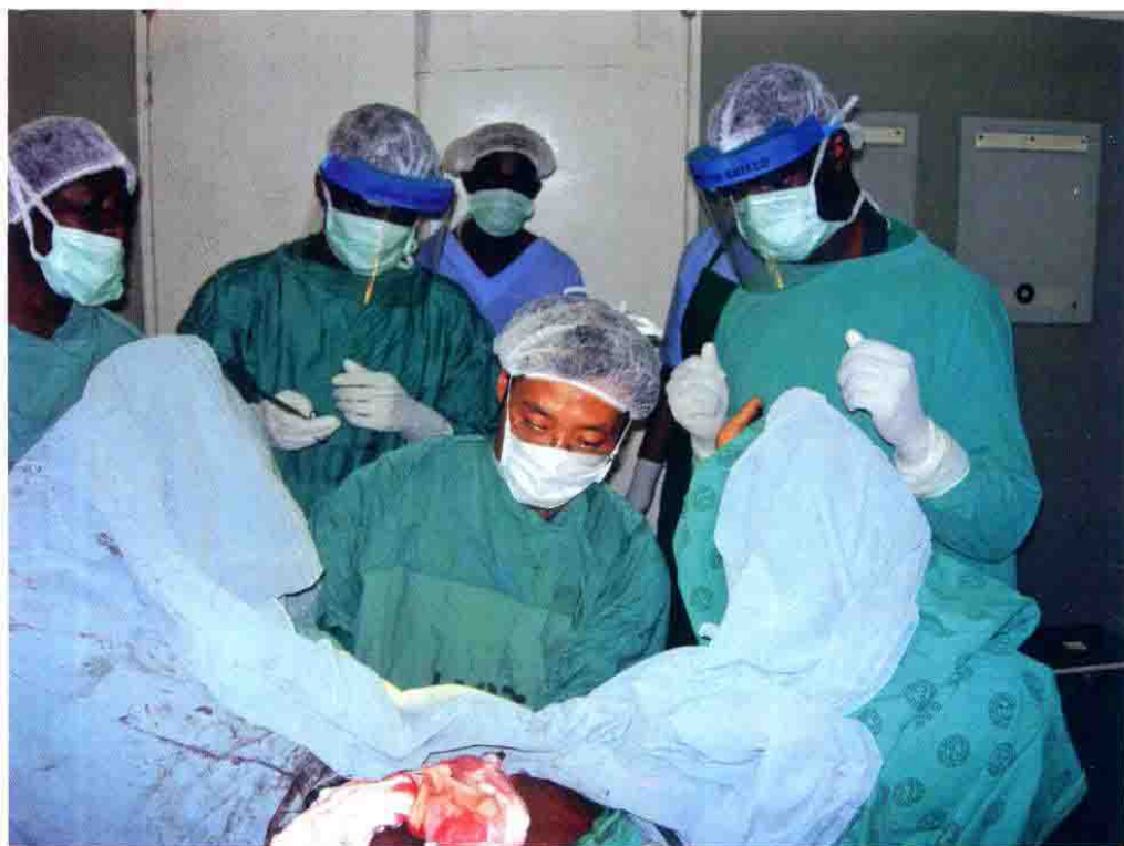
| Abdominal perineum combined with rectal carcinoma radical operation