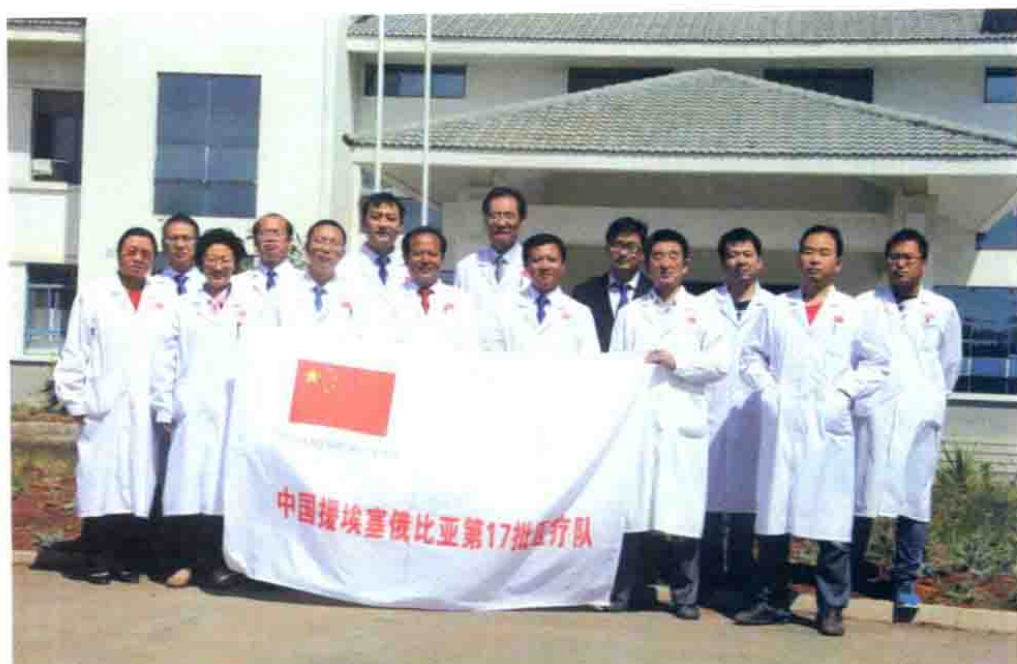
Picture of 17 th batch of China Medical Team to Ethiopia at the China-Ethiopia Friendship Hospital