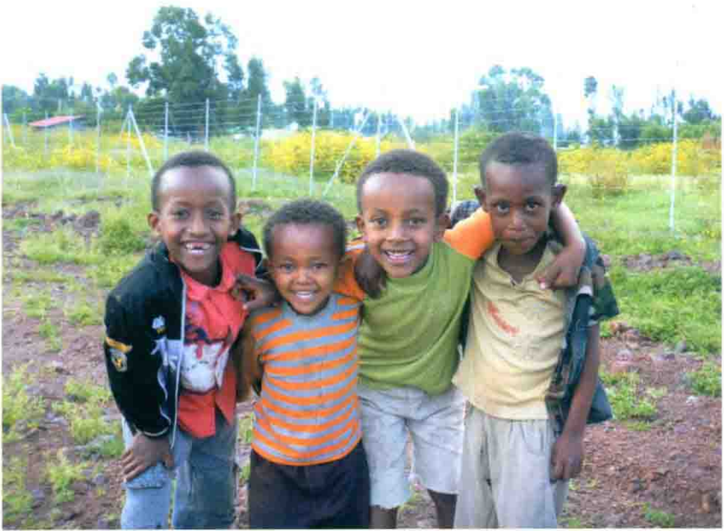
| Happy African children