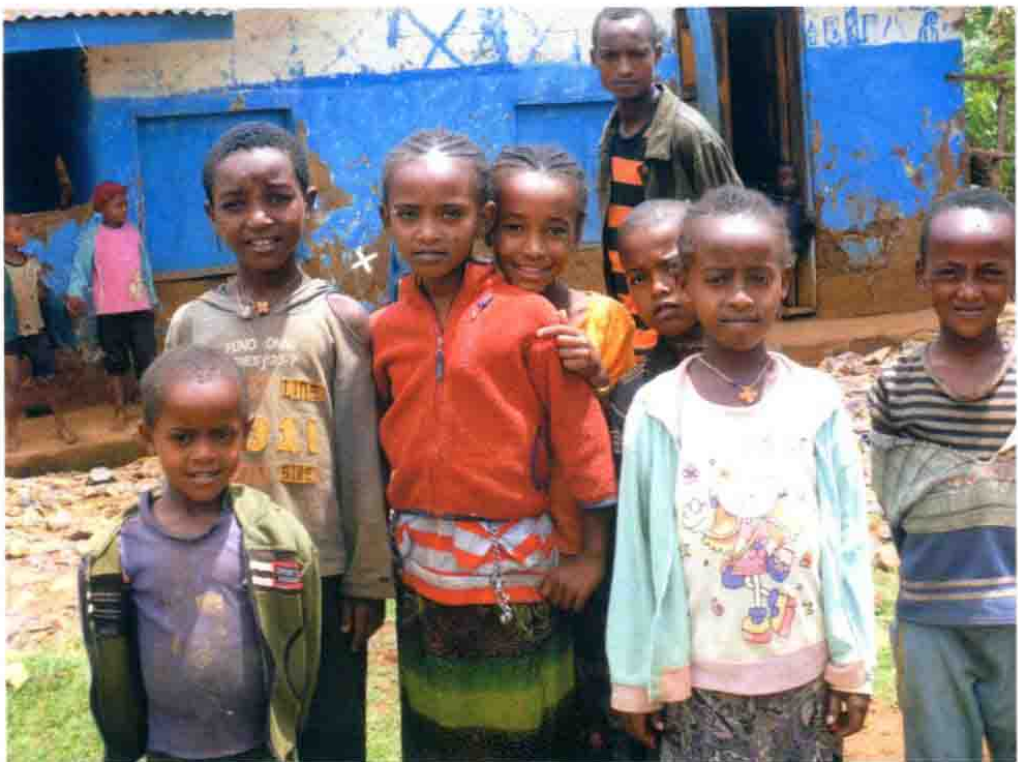
| Naive African children