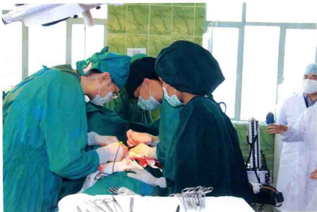
The author performed radical operation for breast cancer in a small town hospital in Ethiopia