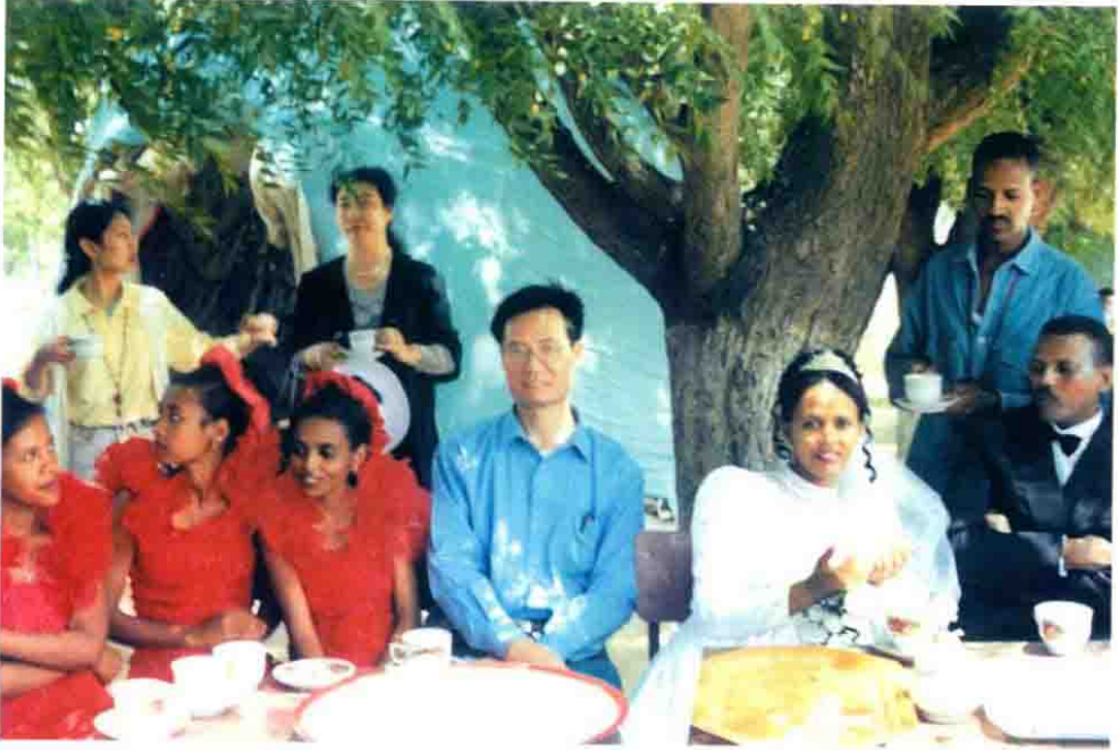
| The author was invited to attend a wedding in Eritrea