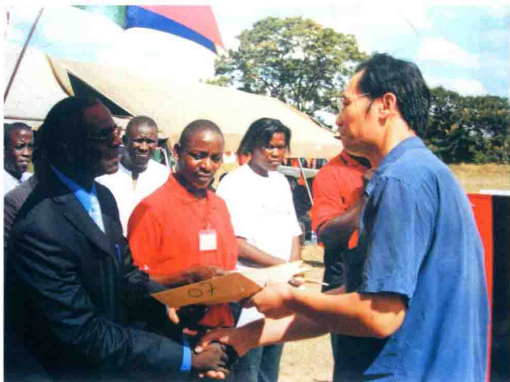
The Minister of Foreign Affairs of Zambia awarded the Certificated of Labour Day Award to the author