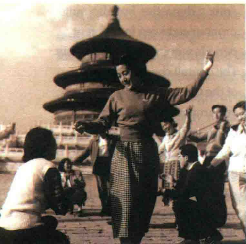
The students of Beijing University wearing Scotland checked skirts in 1950s. (Photographed in 1954)