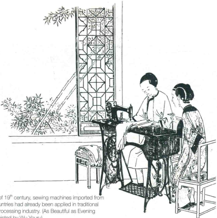
At the end of 19 th century, sewing machines imported from western countries had already been applied in traditional garments processing industry. (As Beautiful as Evening Primrose painted by Wu Youru)

The Wei, Jin and South and North Dynasties (220–589) was a period of ethnic amalgamation with, despite the frequent change in power and incessant wars, ideological diversity, cultural prosperity and significant scientific development. In this period, there was not only the Wei and Jin aristocratic style that the intelligentsia took delight in talking about, but also the shocks and transformations on the traditional Han culture brought about by the northern nomadic tribes when they migrated into the central plains. These ethnic minority people settled down with the Han