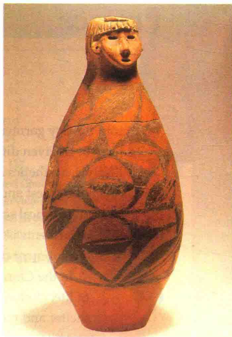
A relic of 5600 years history, the colored pottery bottle with a "head" shape bottle neck excavated in Dadiwan, Gansu Province in 1973. The pottery bottle is about 31.8 centimeters of the figure are clear with hair bang and a high nose. The bottle is painted with 3 rows of black color pattern composed of camber line triangle pattern and willow leaf pattern.

Over 1,000 archeological sites of the Neolithic age (6,000–2,000 BC) have been found in China, geographically covering almost the entire country. The major means of production had transformed from the primitive hunting and fishing to the more stable form of agriculture, while division of labor first appeared in weaving and pottery making. Ancient painted pottery pots from 5,000 years ago were found