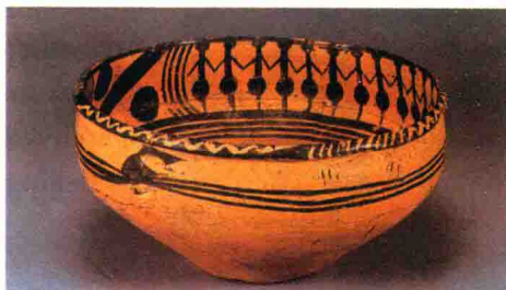
The picture shows the colored pottery basin excavated in Tongde County, Qinghai Province in 1975. The pattern is people wearing "distended" skirts dancing hands in hands. This kind of skirt is seldom seen in traditional Chinese garments.