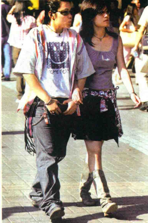
Fashionable young people on the street.

In October 2009, four Chinese designers held a joint fashion show in Shanghai Fashion Week.