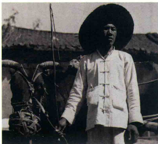
The traditional image of a peasant wearing a front closure Chinese jacket. (Photographed in 1950, provided by Xinhua News Agency photo department)

continuous transformation in dress style and customs. The distinction not only existed among dynasties, but also quite pronounced even in different periods within the same dynasty. The overall characteristics of the Chinese garments can be summarized as bright colors, refined artisanship, and ornate details. Diversity in style can be seen among different ethnic groups, living environments, local customs, lifestyles and aesthetic tastes.