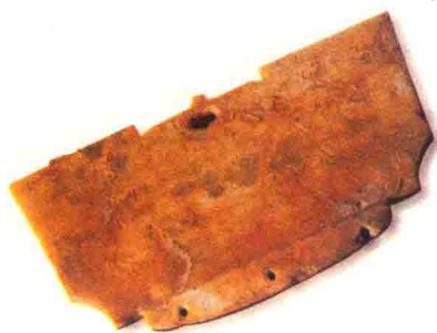
The neck adornments, butterfly shape jade plate and jade excavated in a Neolithic site.

in Qinghai Province of western China, decorated with dancers imitating the hunting scene. Some dancers wear decorative braids on their heads, while others had ornamental tails on the waist. Some wear full skirts that are rarely seen in traditional Chinese attire, but more similar to the whalebone skirt of the western world. In the neighboring province of Gansu, similar vessels were excavated, with images of people wearing what the later researchers called the " Guankoushan ," a typical style found in the early human garments: a piece of textile with a slit or hole in the middle from which the head comes through. A rope is tied at the waist, giving the garment a dress-like appearance. Another vessel portrays an image of an attractive young girl, with short bangs on the forehead and long hair in the back. Against the delicate facial features and below the neck a continuous pattern is found with three rows of slanting lines and triangles. It may well have been a lively young girl in a beautiful dress with intricate patterns on the mind of the pottery maker. In addition to the clay vessels, images of primitive Chinese garments were found in rock paintings of the early people wearing ear ornaments. In the Daxi Neolithic site of Wushan,