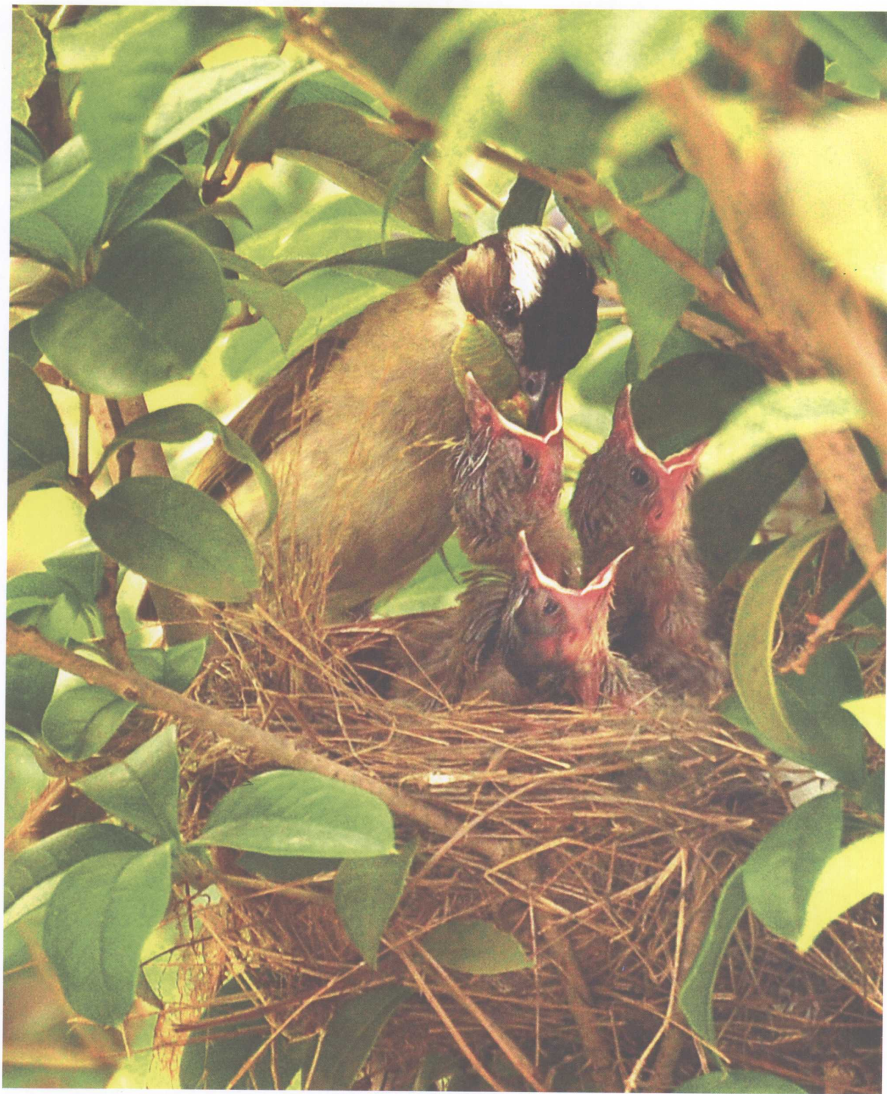
收获而归 A FEAST (2008 花都 Huadu)