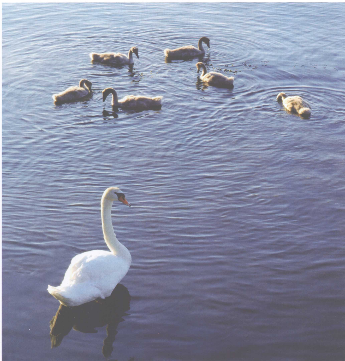
别走远了 STAY CLOSE TO ME. (2006 德国 Germany)