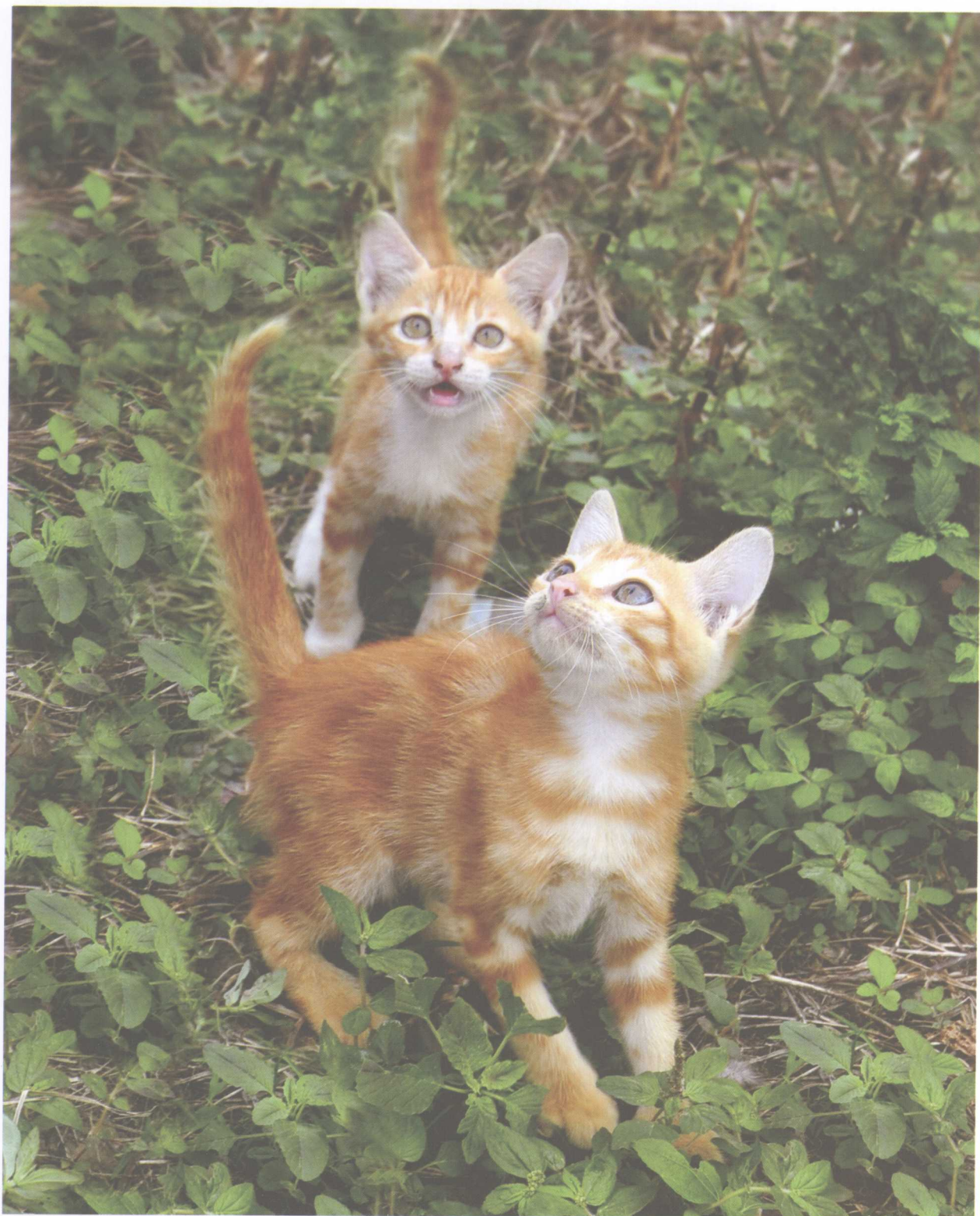
初出猫庐 WHAT A BRIGHT NEW WORLD! (2008 花都 Huadu)