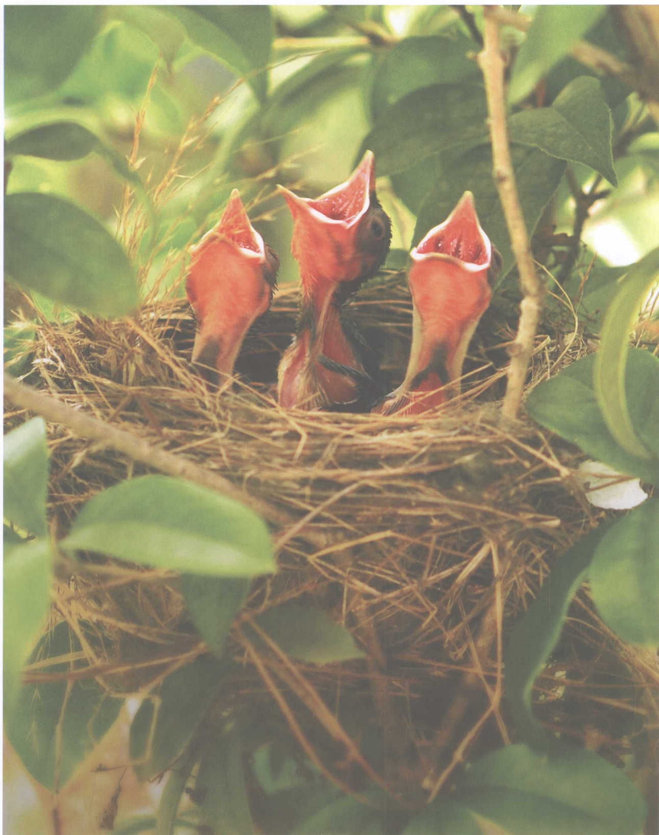
嗷嗷待哺 FEED US NOW. (2008 花都 Huadu)