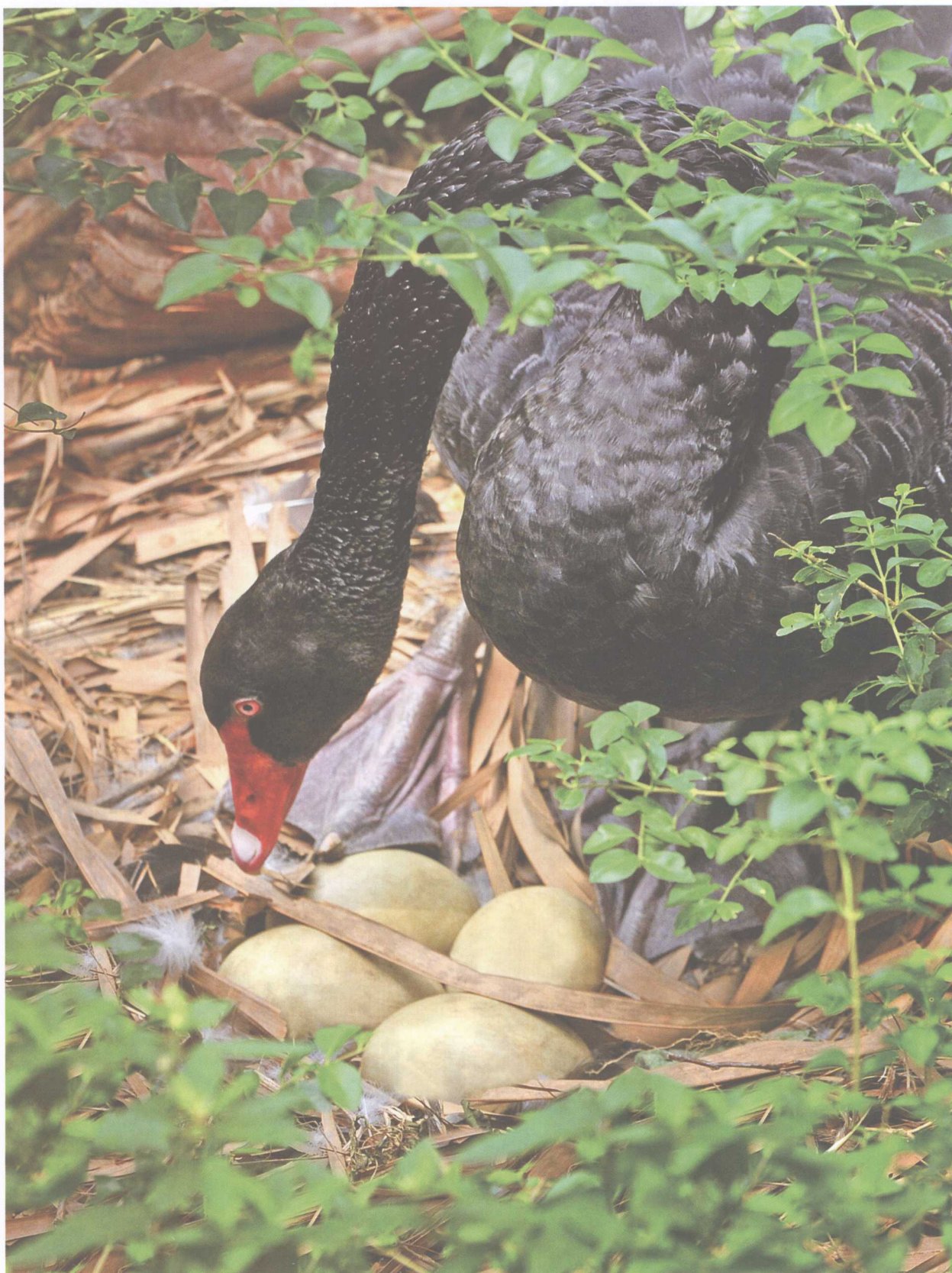
希望所在 HOPE RESTS ON YOU. (2008 番禺 Panyu)