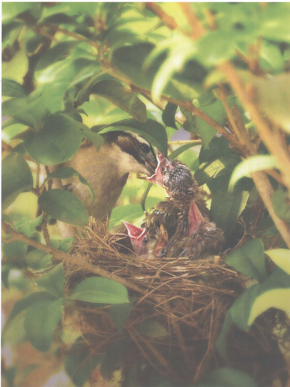
慢点孩子 BE PATIENT KIDS. (2008 花都 Huadu)