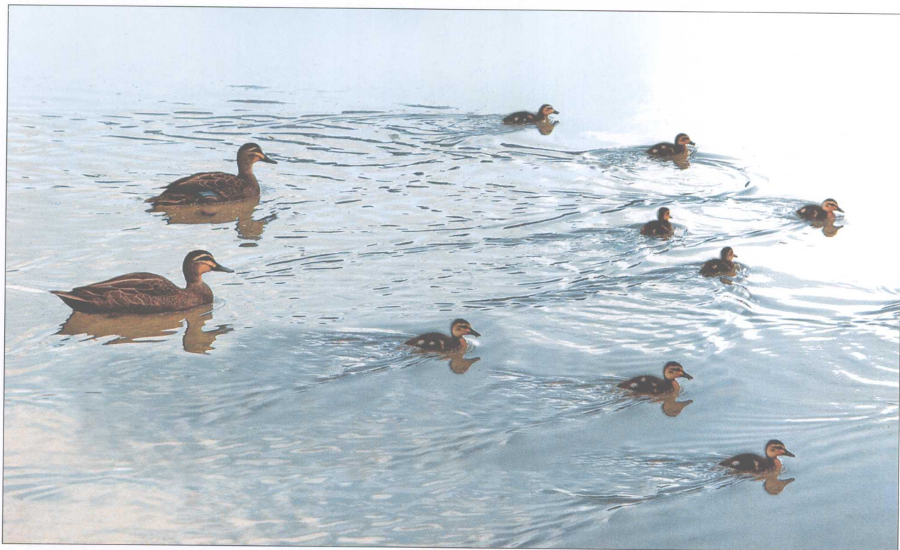
外面的世界 THE OUTSIDE WORLD (2006 澳大利亚 Australia)