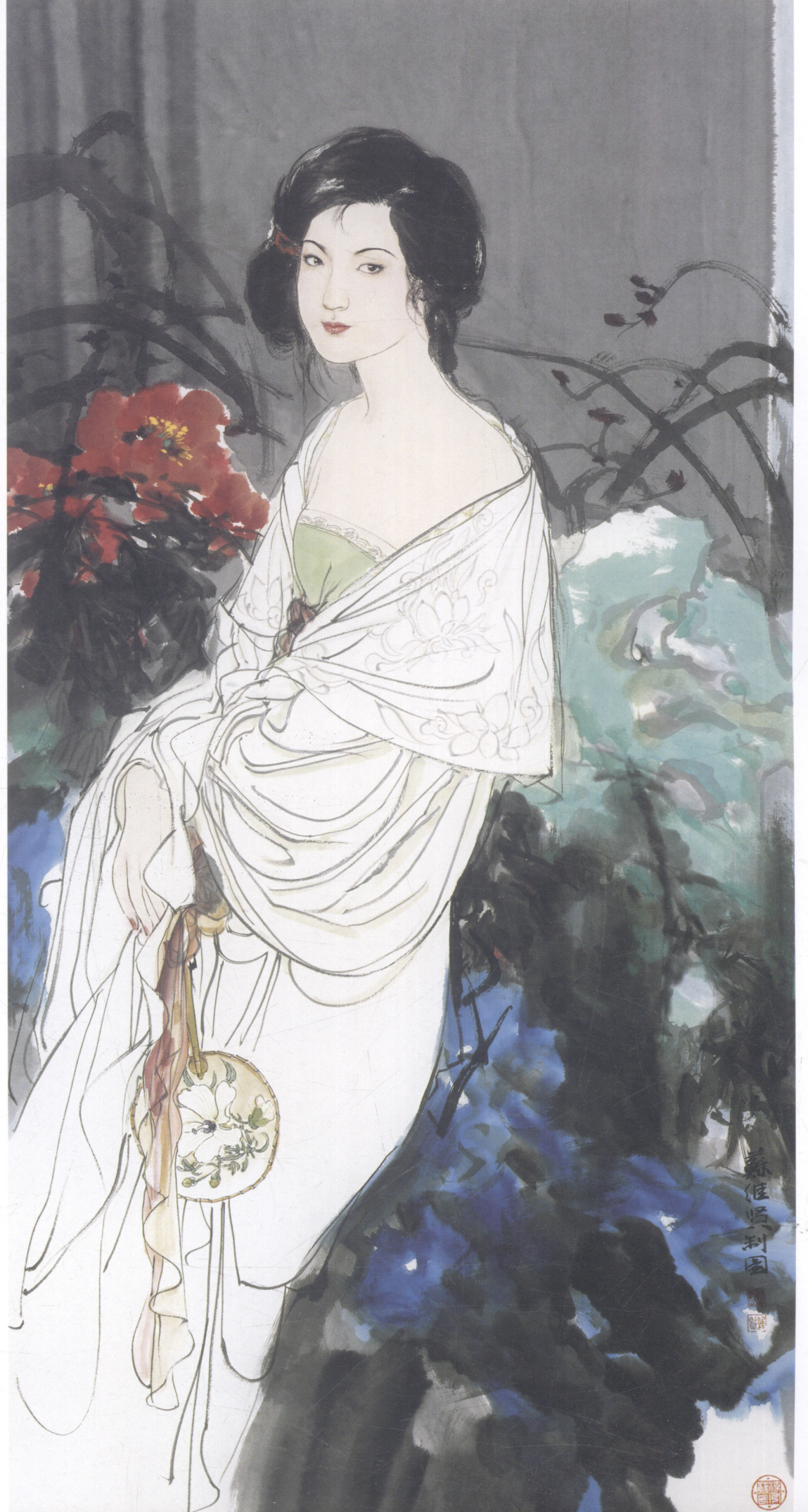
如玉 A Jade-liked Woman