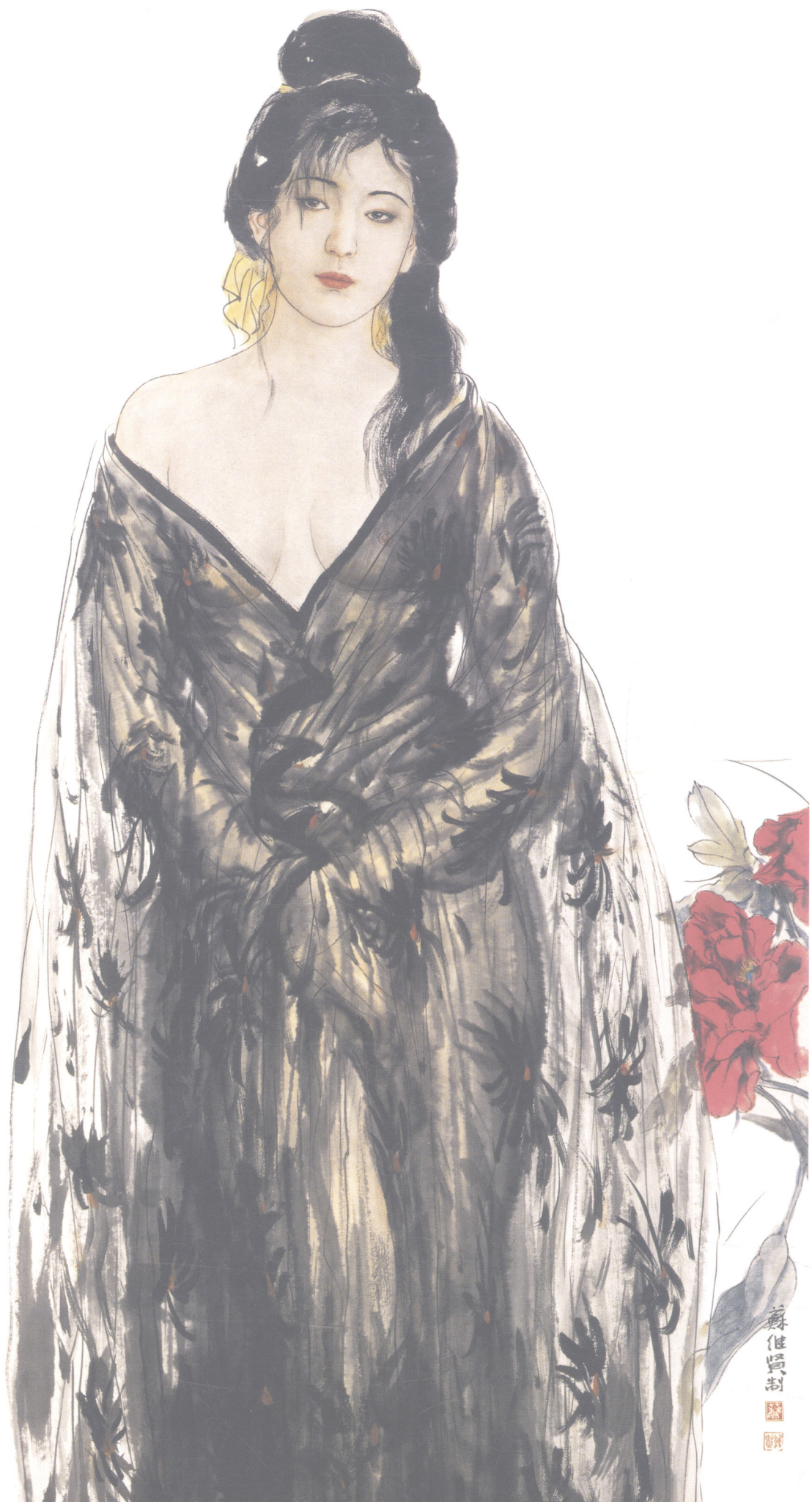
好事近 Arrival of Good News