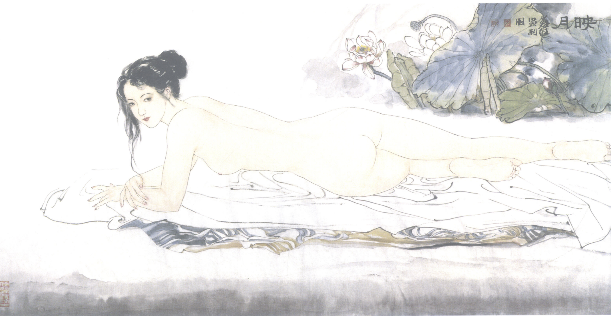
映月 Reflecting the Moon