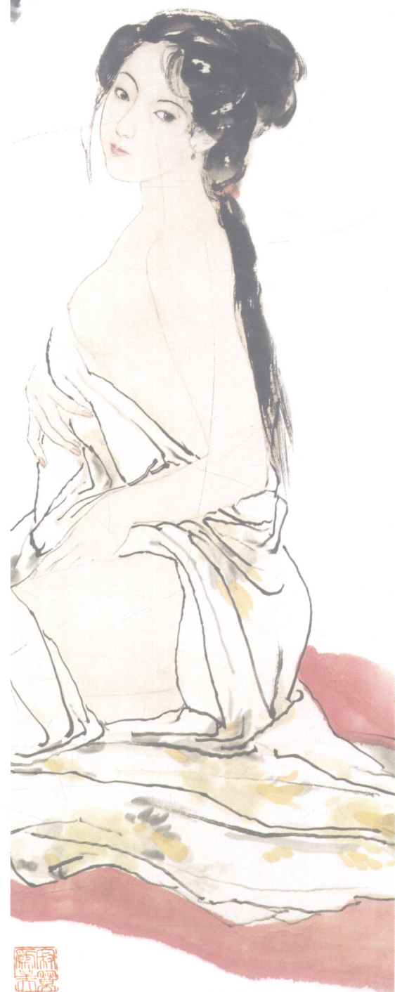
晚暮轻寒 Feeling Light Cold in Nightfall