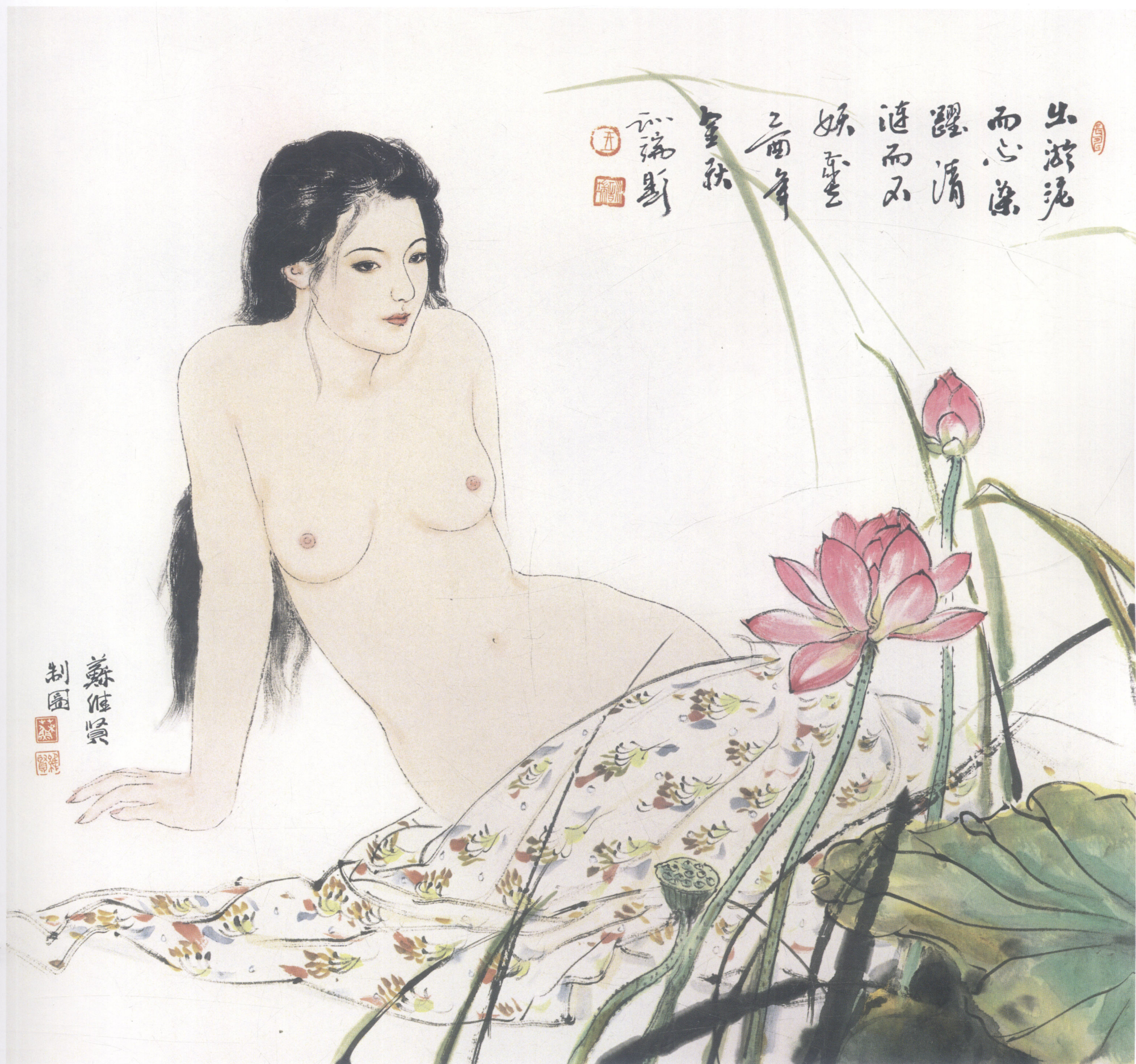
天生丽质 Born Beauty