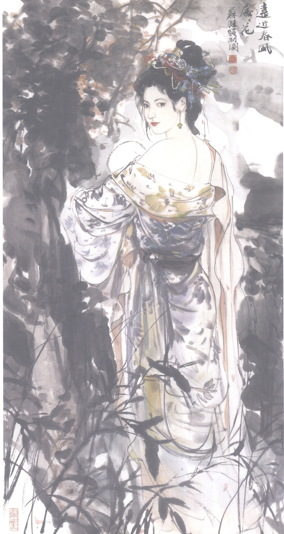
遠近春風處處花 Spring Wind and Flowers in Everywhere