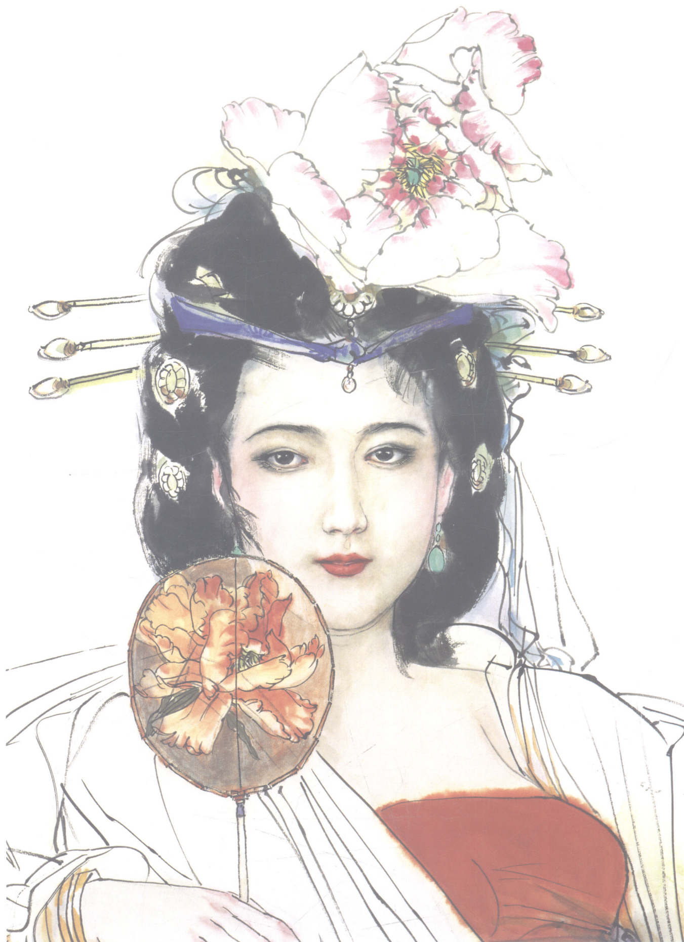
庭院深深 (局部) Deep Yard (Detail)