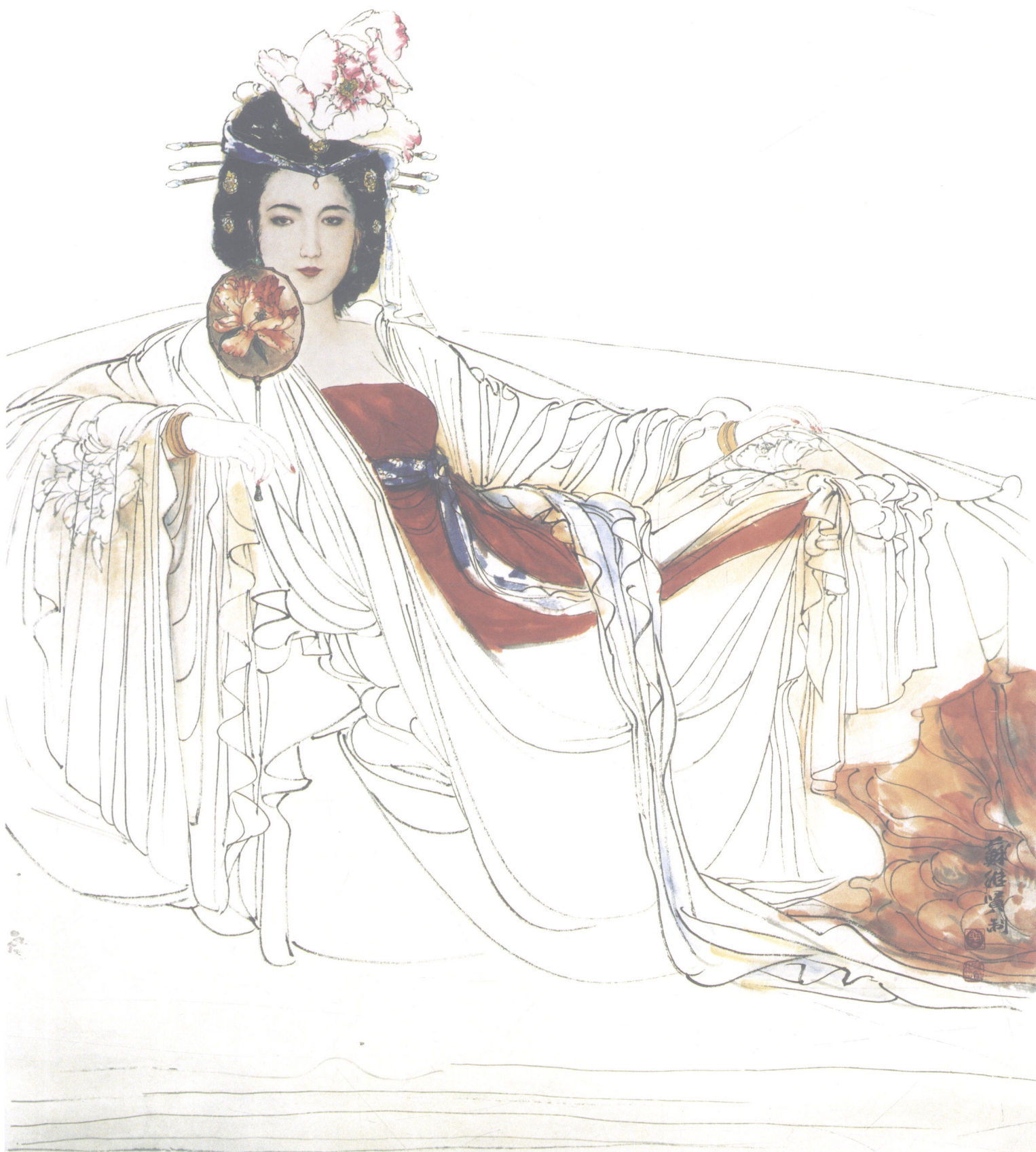
庭院深深 Deep Yard