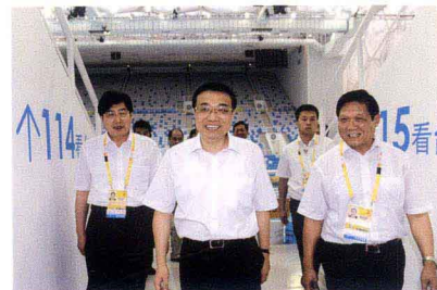
李克强 中华人民共和国国务院副总理 Li Keqiang, Vice Premier of the State Council of the People's Republic of China

The “Bird’s Nest” is spectacular and striking. Both the construction and management have demonstrated the innovative wisdom and capacity of the Chinese nation. The fancy design and unique concept of the “Water Cube” is impressive. Its builders are also impressive in their wisdom to overcome difficulties in construction. The National Indoor Stadium is an excellent combination of functional design, aesthetic design and environmental protection. It is effective in environmental protection. The Digital Beijing Building is a good example of how Modern Olympics promotes urban infrastructure construction.