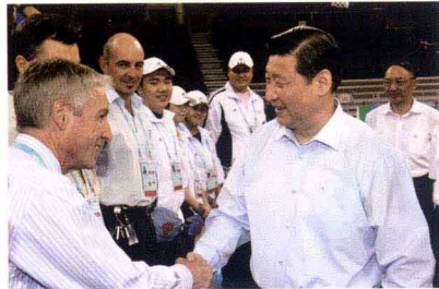
习近平 中华人民共和国副主席 Xi Jinping, Vice President of the People's Republic of China

With its modern human-centric design the MPC was one of the windows showcasing China's Olympic image. The all round reporting set up a bridge of friendship between the Chinese and other peoples in the world.