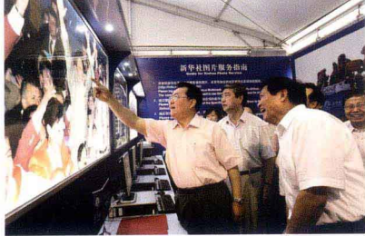
李长春 中共中央政治局常委 Li Changchun, Member of the Standing Committee of the CPC Political Bureau

主新闻中心的设施现代化、设计人性化，是展示奥运形象的重要窗口。丰富全面的奥运报道在中国人民和世界人民之间架起了一座友谊的桥梁。