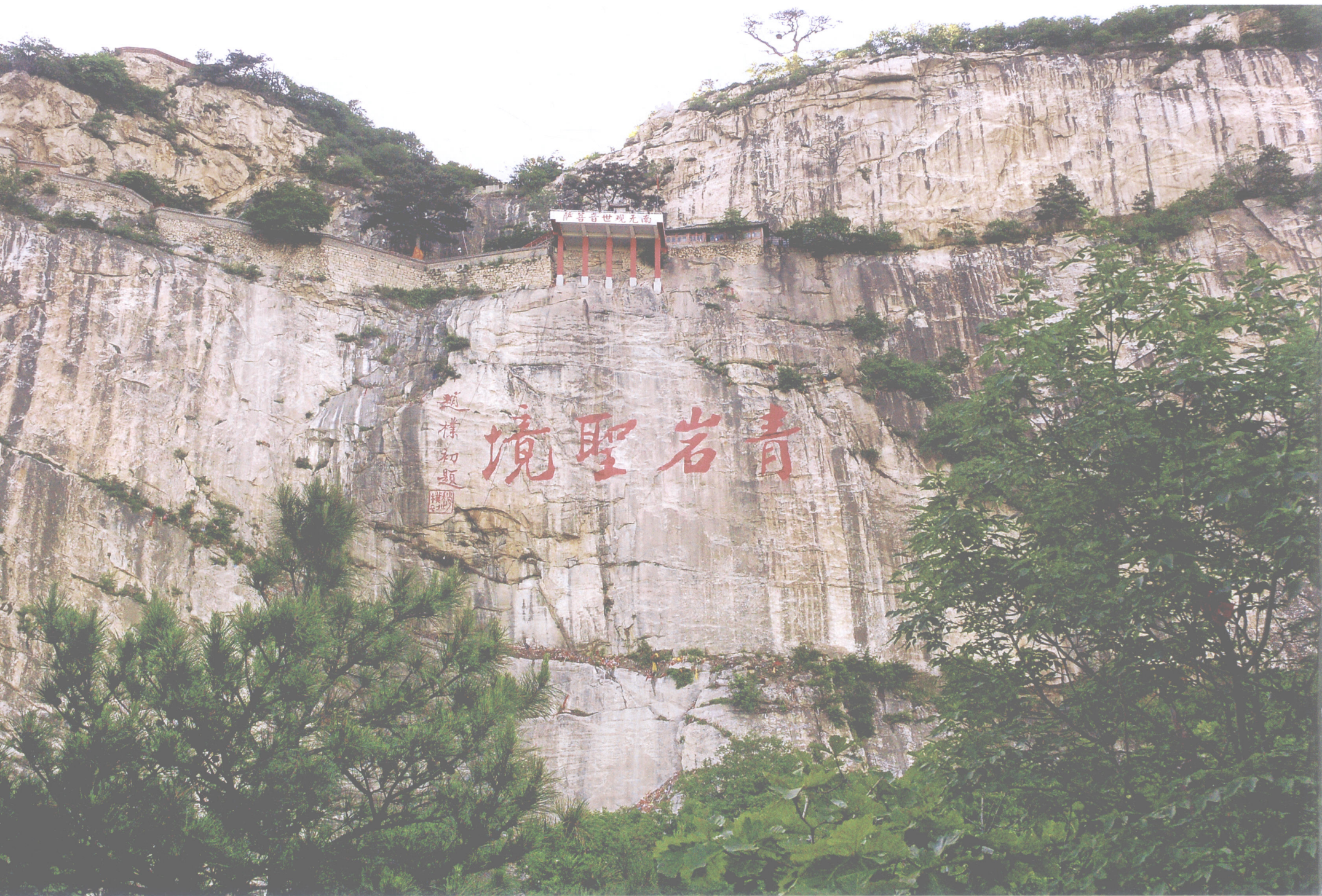
青岩圣境 Qingyan holy-land