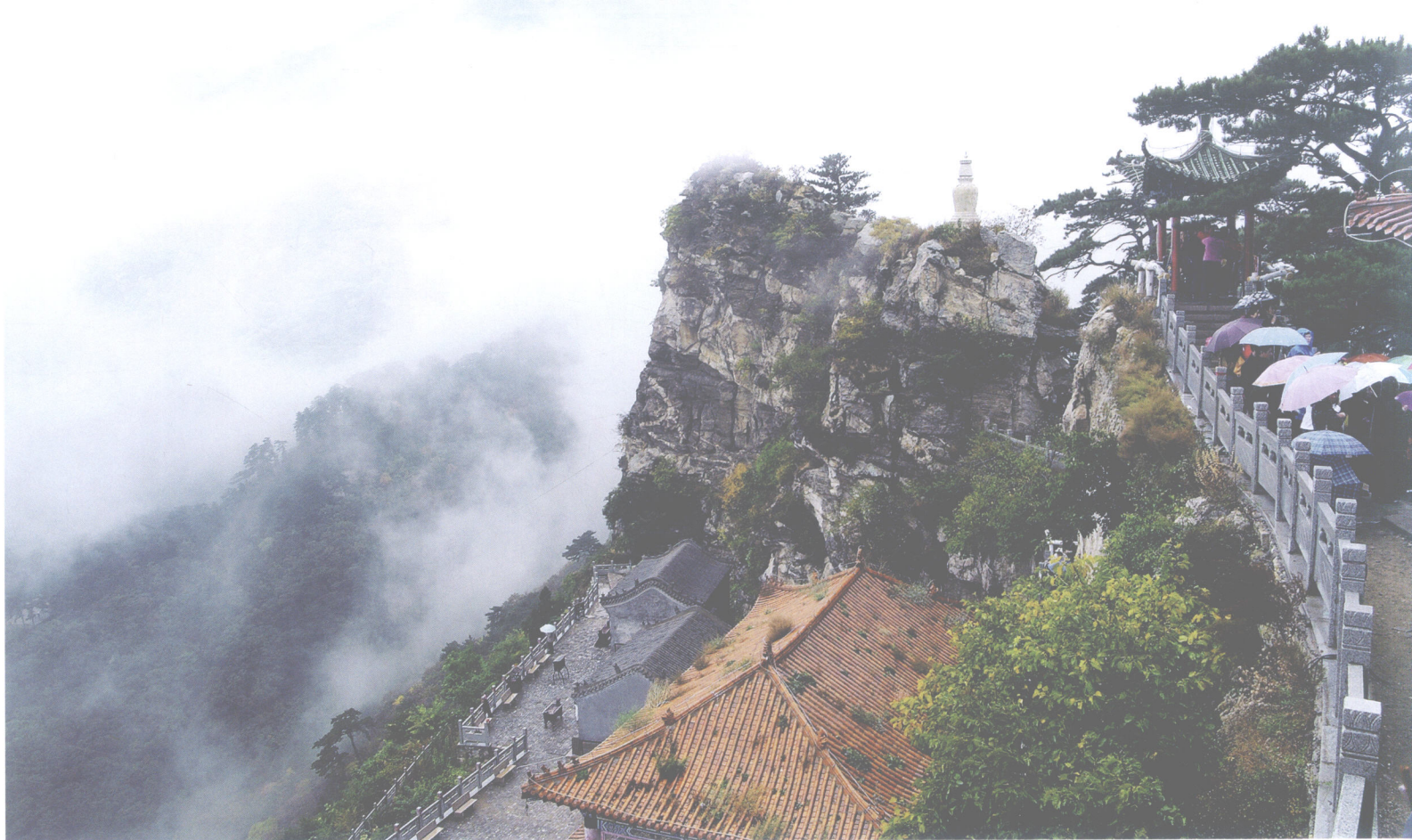
云岩胜境 Yunyan resort