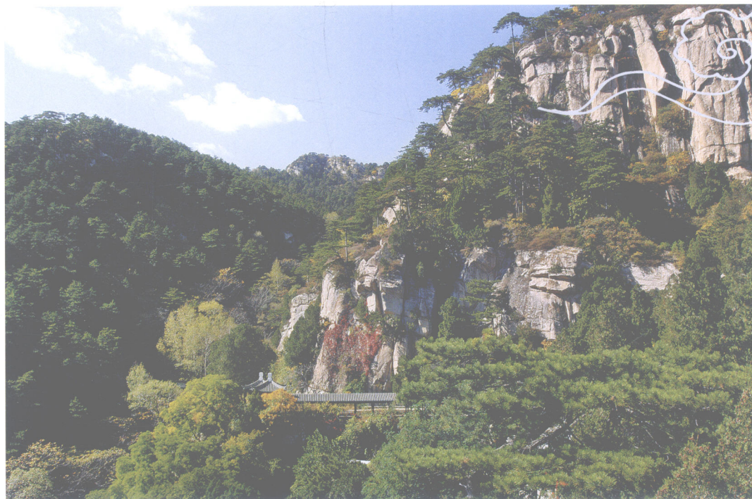
玉泉寺风光 Yuquan Temple scenery