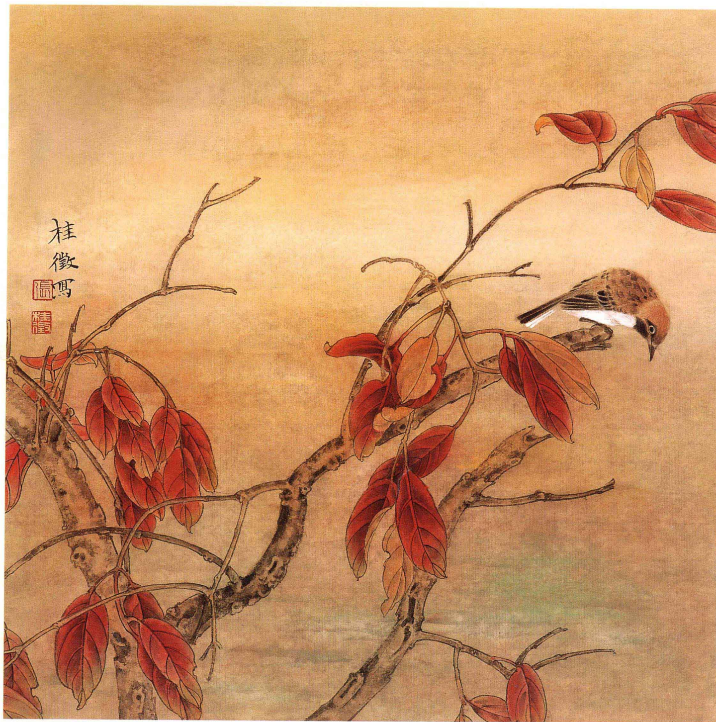
艳秋 1998年 (45cm x 43cm)