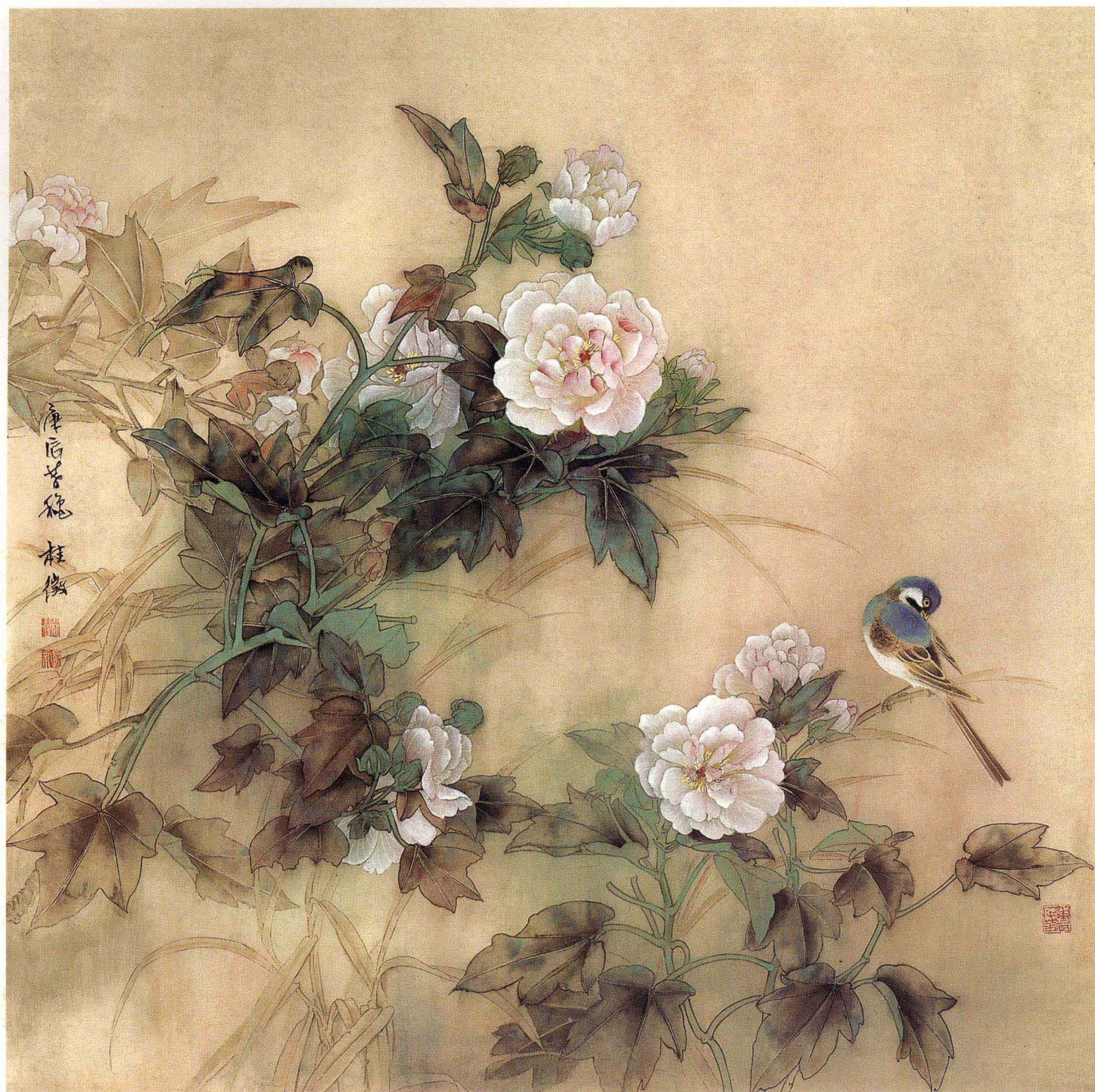
秋江冷艳 2000年 (90cm × 90cm) A bird among glory flowers