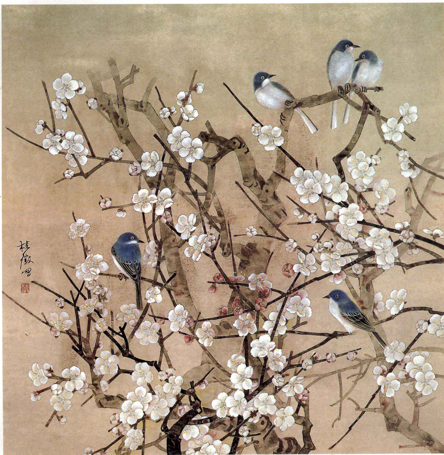
和韵 1998年 (66cm × 66cm)