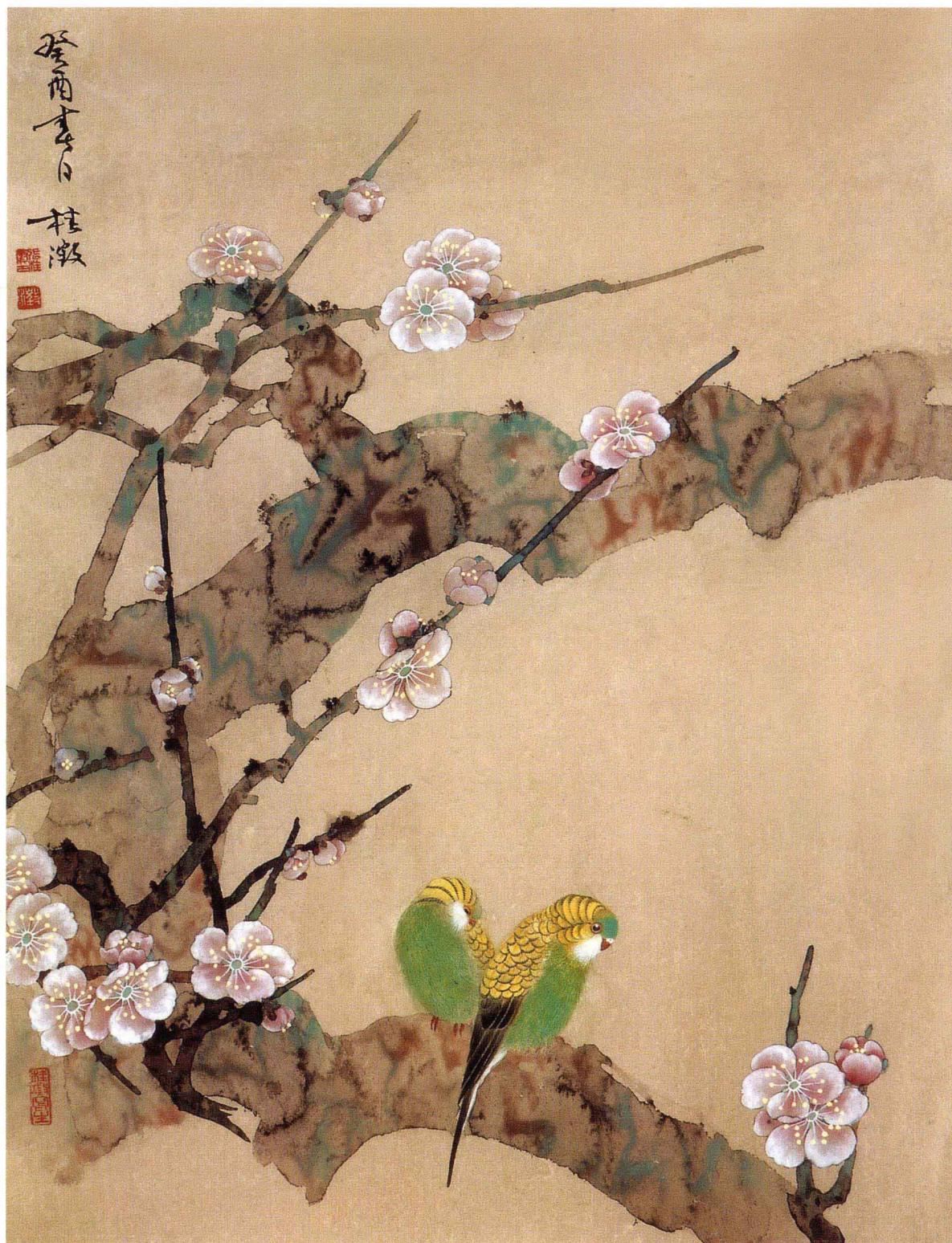
细语 1993年 (50cm × 35cm)

A pair of parrots perched on a plum branch