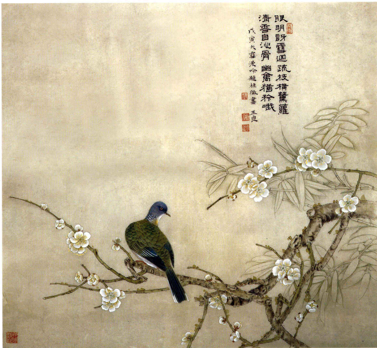
清友图 1994年 (70cm × 90cm)