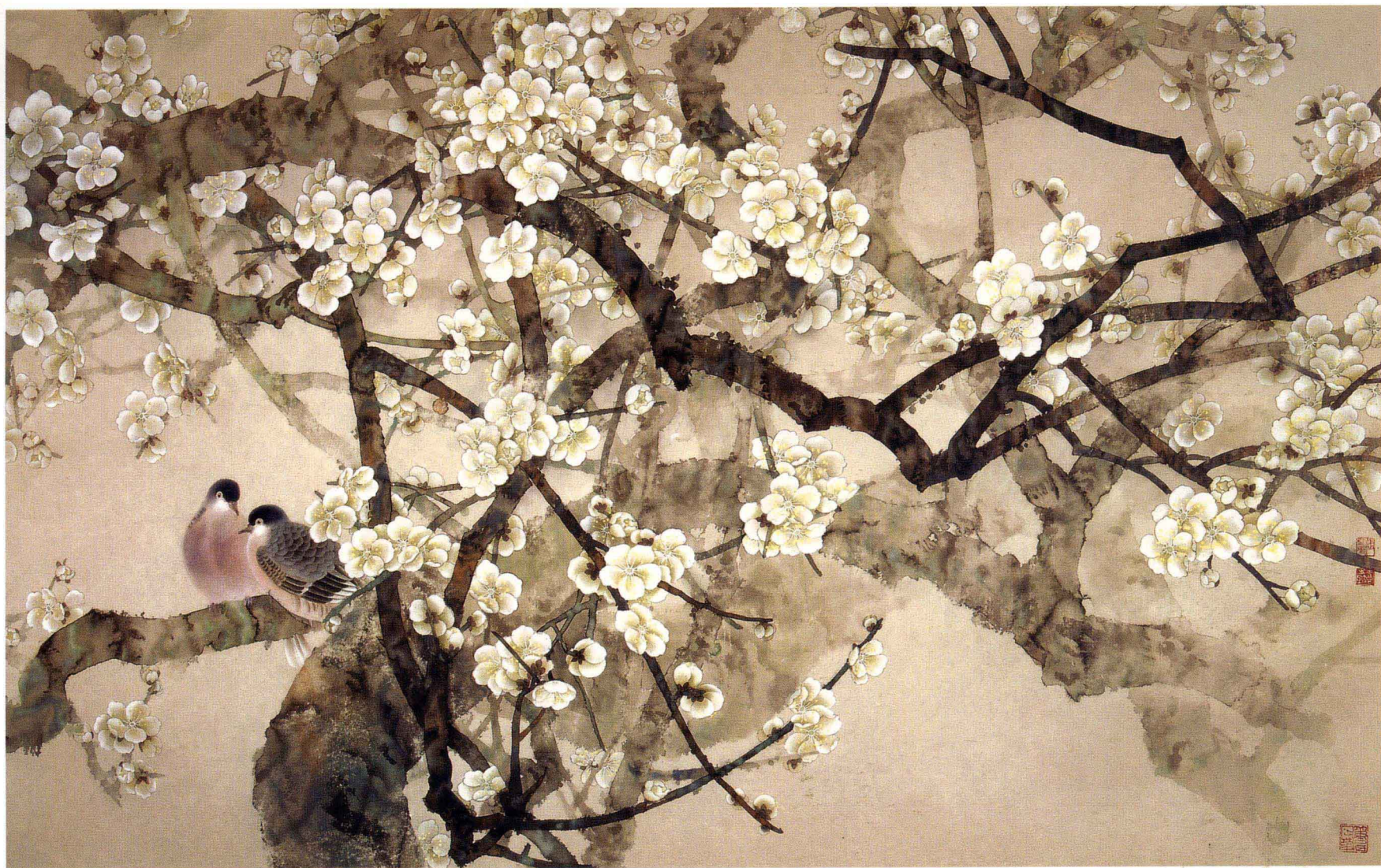
雪鸠图 1987年 (65cm×110cm)

A pair of Turtledoves on a Plum Tree Branch