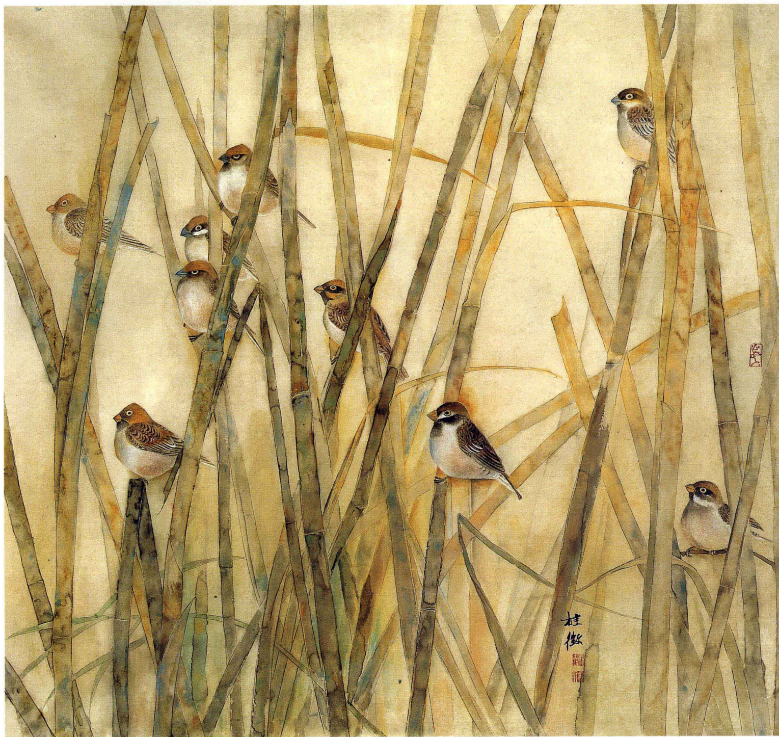
和鸣 1994年 (90cm × 94cm)

A flock of birds singing in the fields in deep autumn