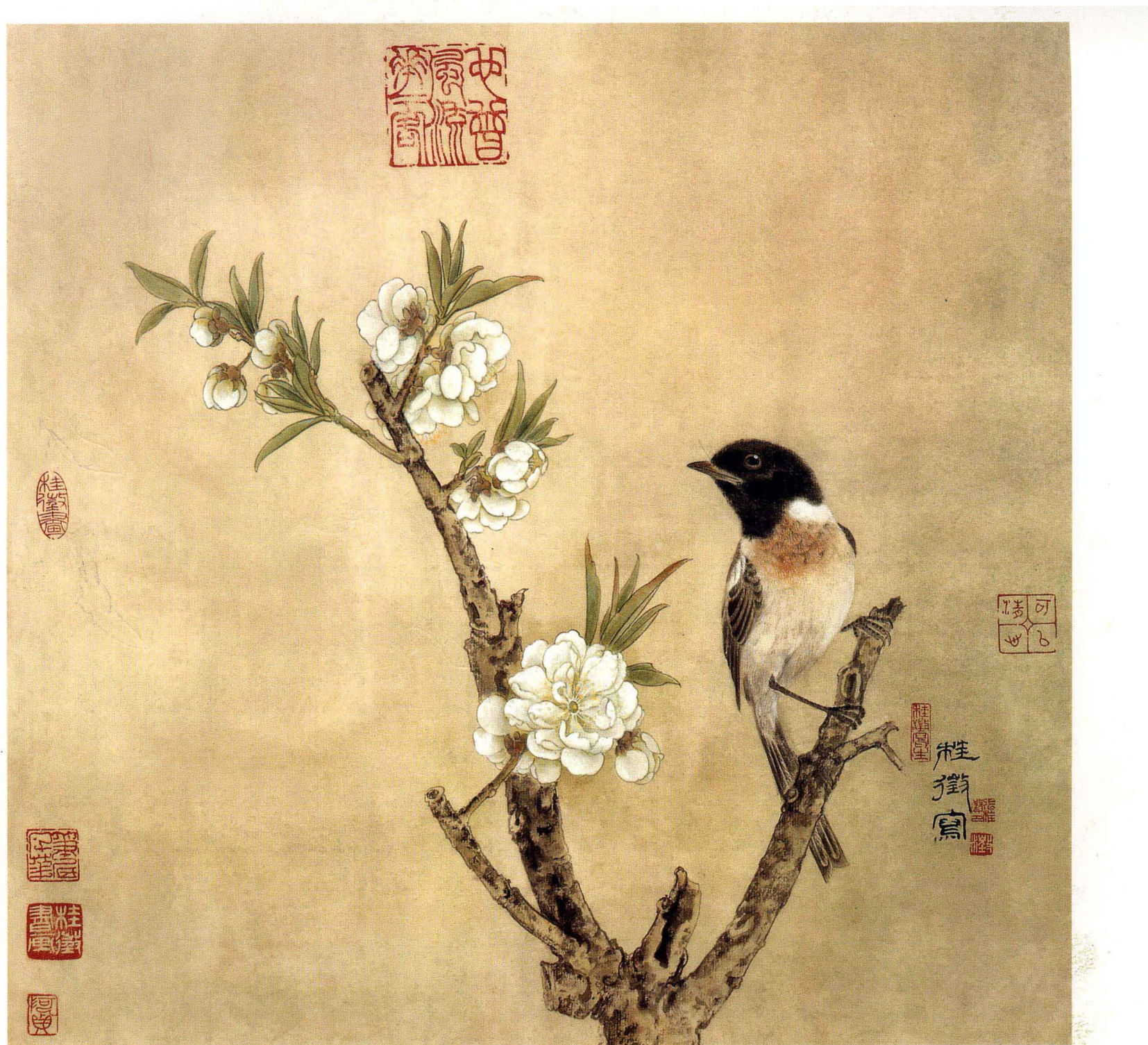
碧桃春声 1993年 (45cm × 43cm)

A bird on the branch of flowering peach in early spring