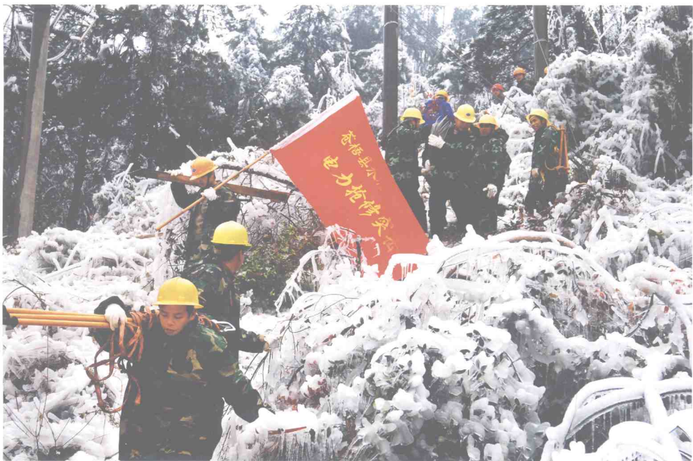
特等奖(组图)·为了灾区早光明 / 石团兵 The Special Award · For the Early Brightness of Disaster Area / Shi Tuanbing