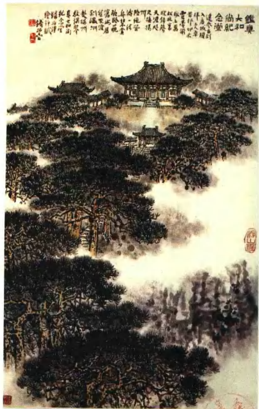
郭沫若为鉴真和尚圆寂一千二百周年而作 钱松喦 作