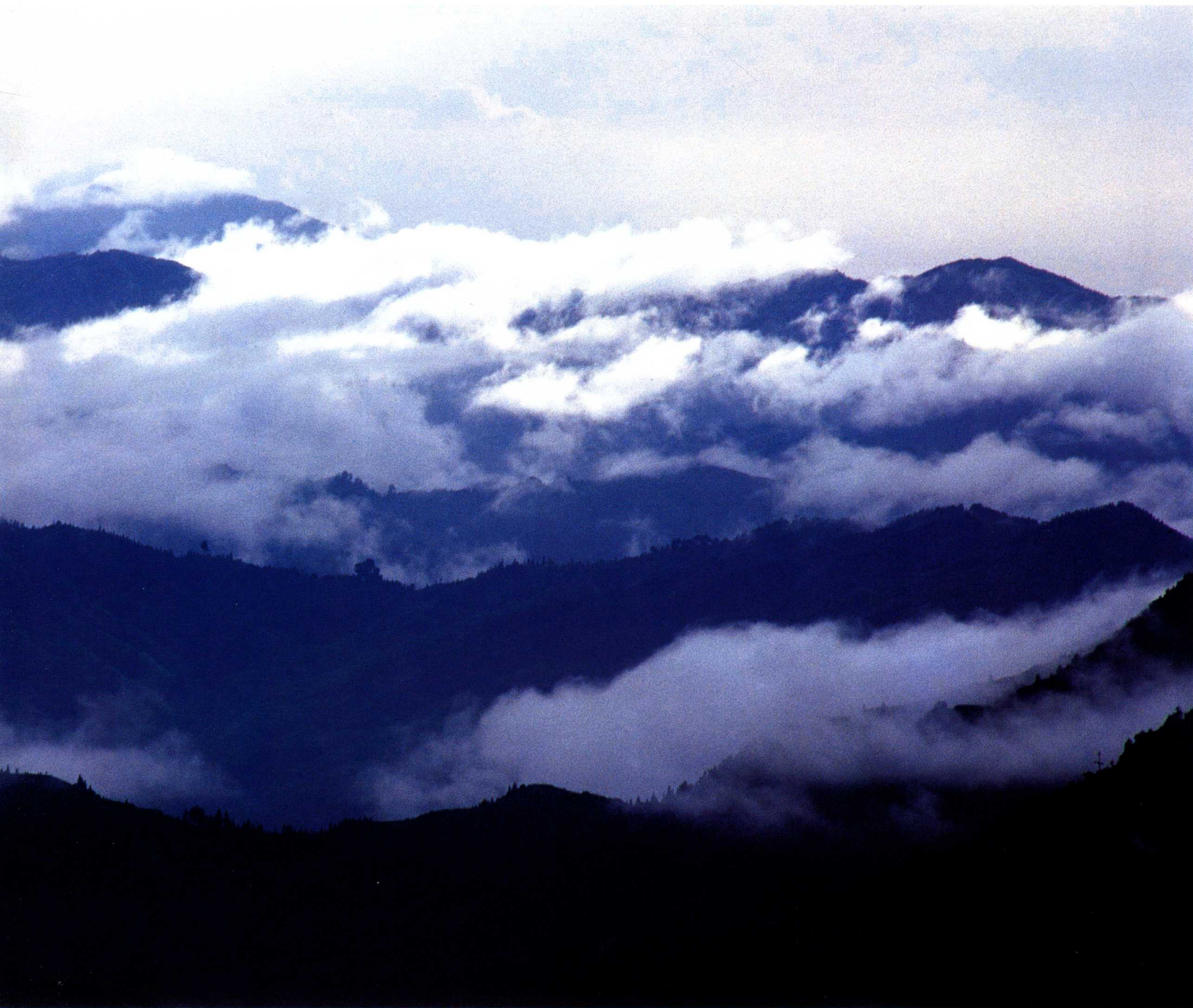
苍山如海 Mountains and Cloud