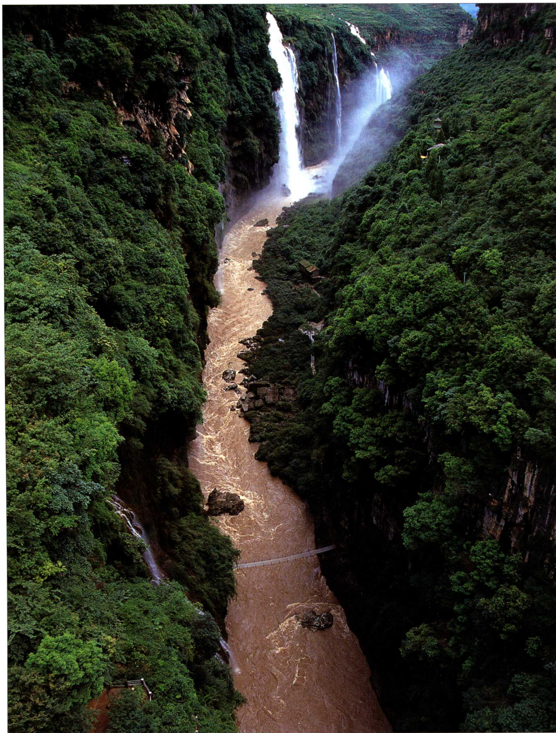
滚滚波涛 Large Ripple