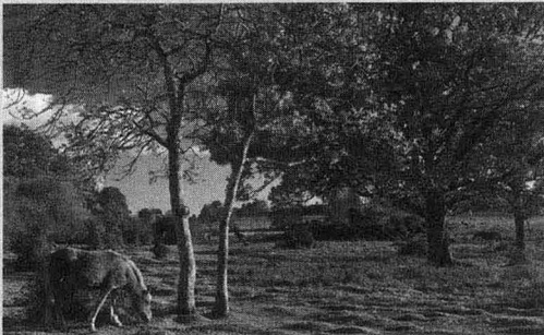
The contested New Forest landscape is carefully managed.