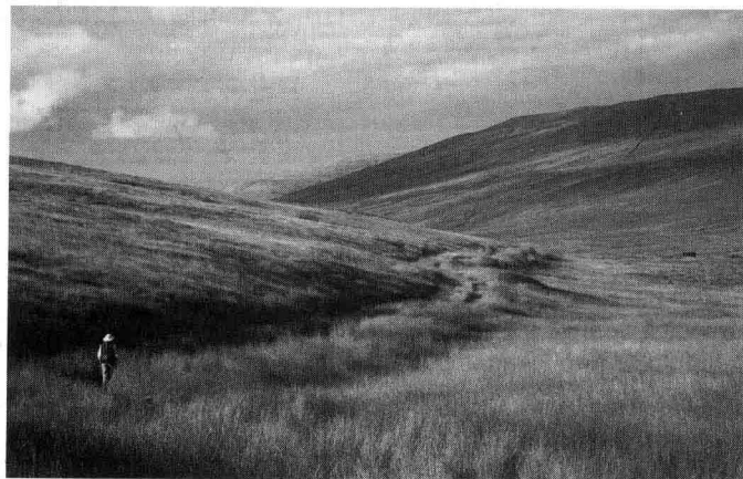
Tourists can cause lasting damage to precious landscapes.

Great colour photography from a variety of tourist attractions from across the world is used throughout the book.