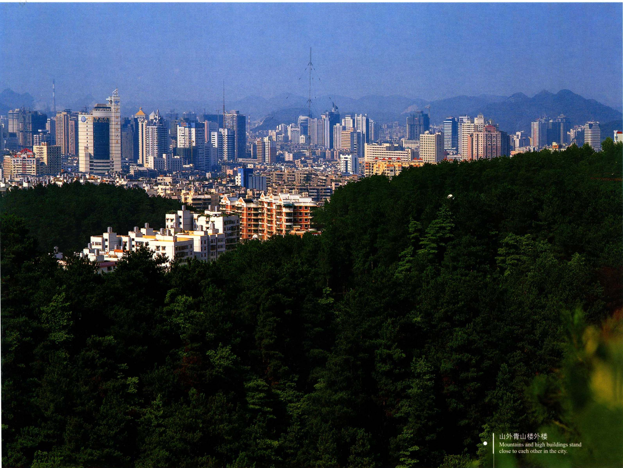
山外青山楼外楼 Mountains and high buildings stand close to each other in the city.