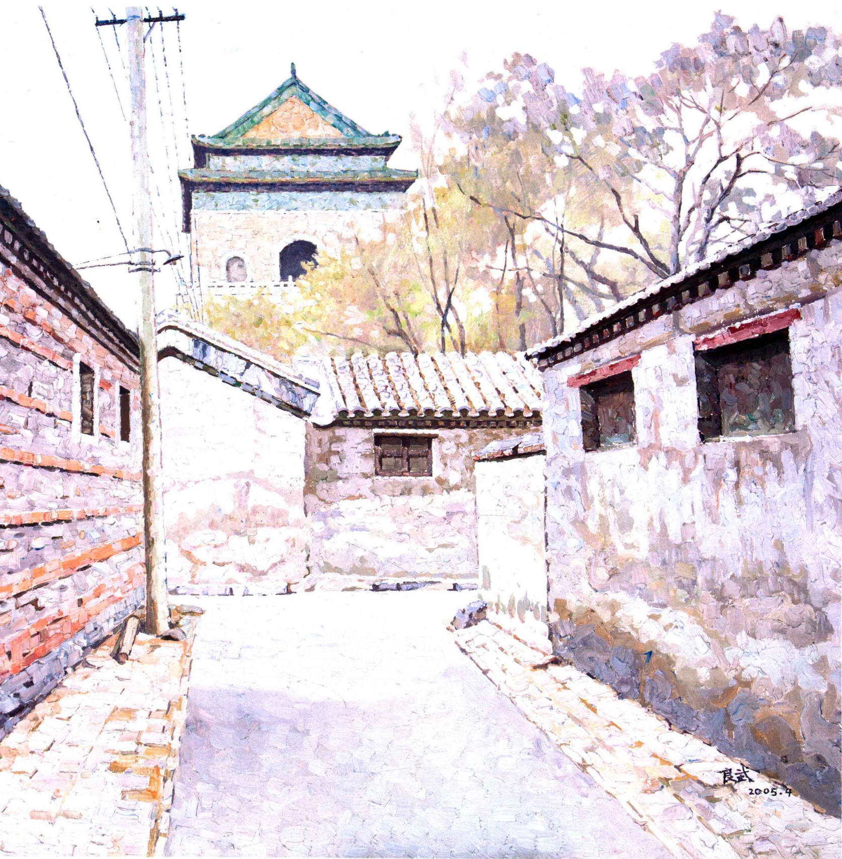
早春 Early Spring 60×60cm 2005年 布面油画 Oil painting on canvas