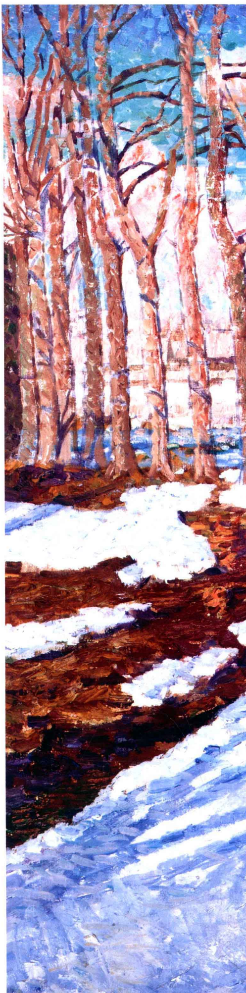
静雪 Fine Day after Snow 74.2 x 87.2cm 1997年 布面油画 OIL PAINTING ON CANVAS