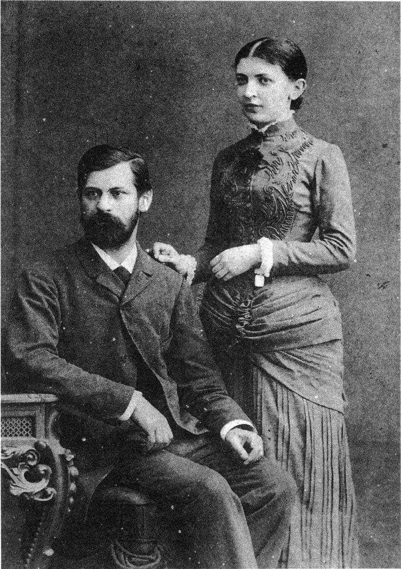
3. Freud and his fiancée Martha Bernays on their engagement, 1885