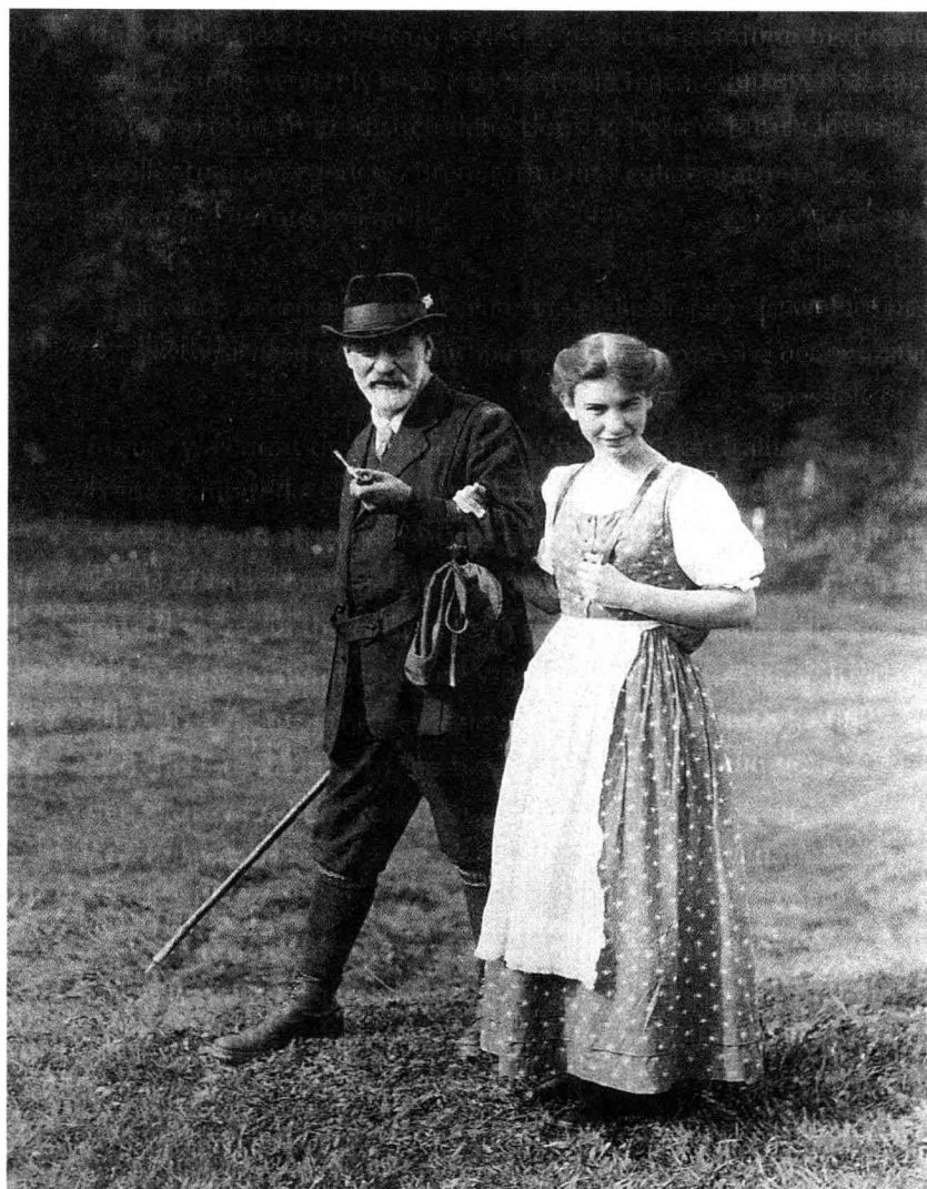
4. Freud in the Dolomites with his daughter Anna, 1913