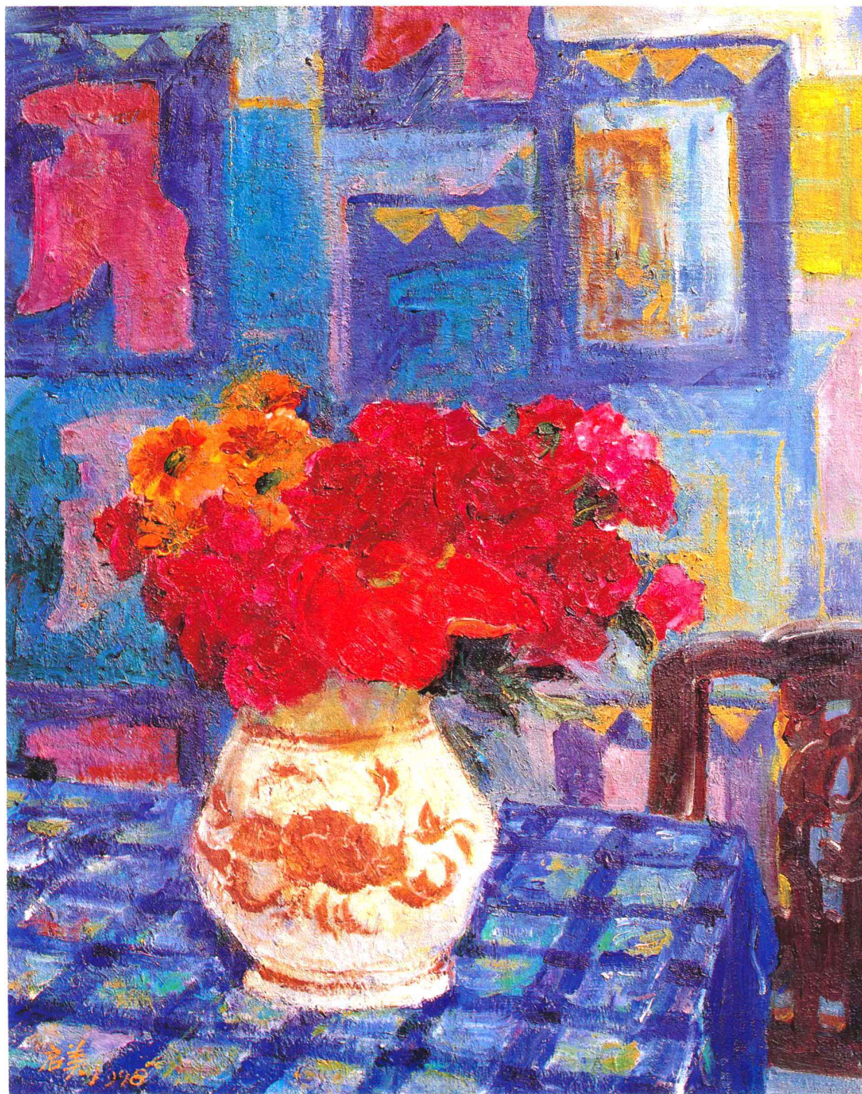
韦启美 红色的花 Wei Qimei Red Flower