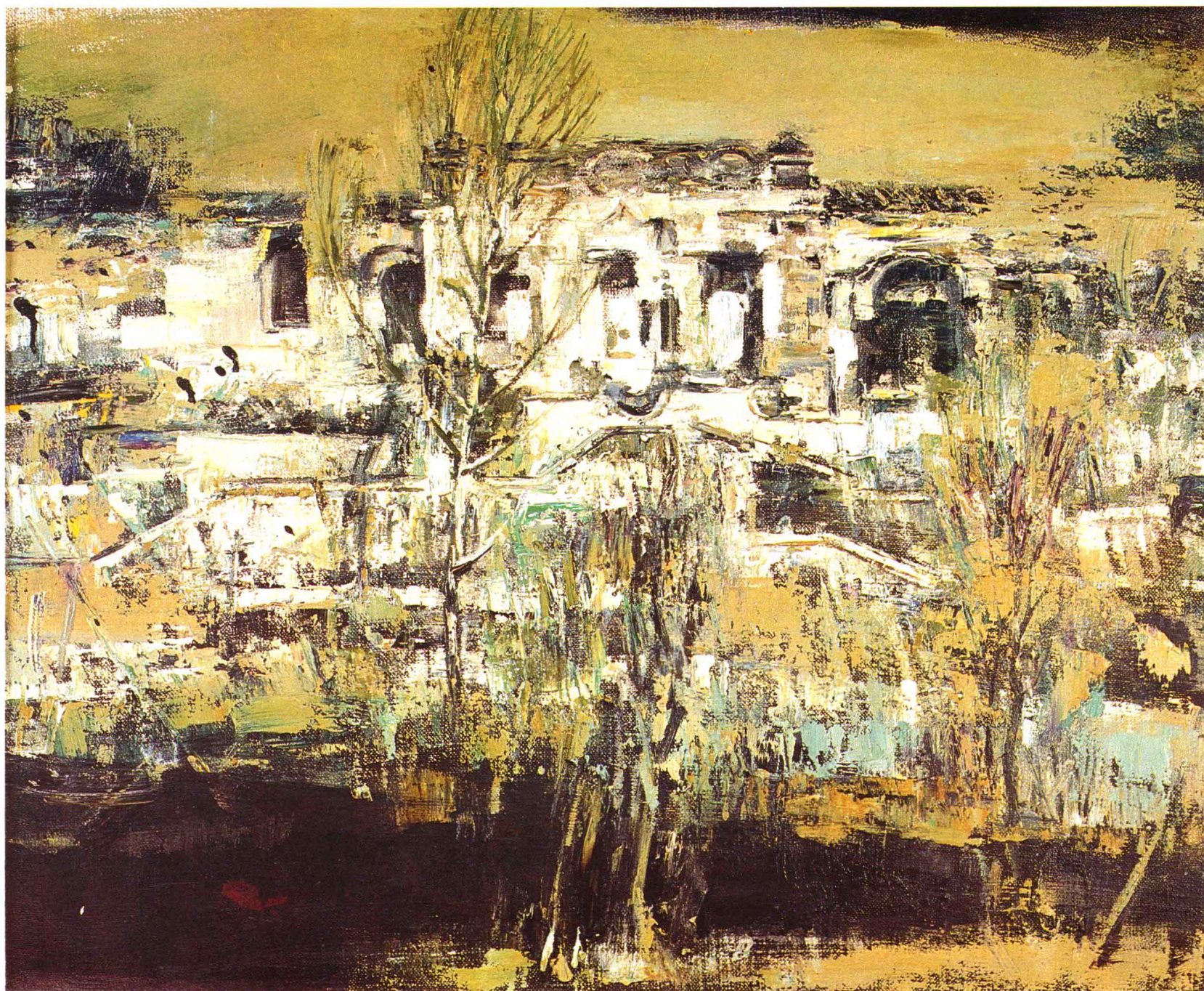
许江 殇园 Su Jiang Yard Shang