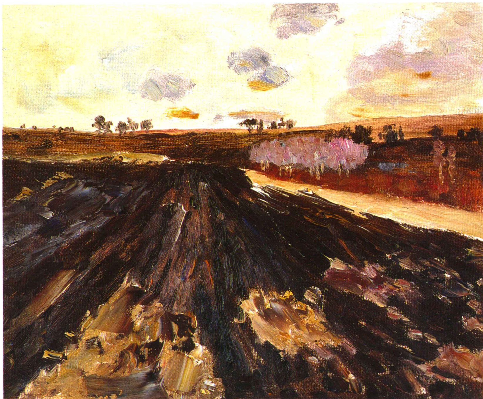
孙为民 黑土地 Sun Weimin Black Soil