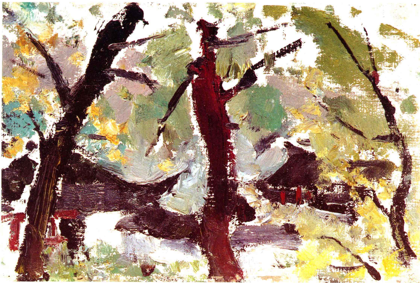
苏天赐 天平古刹 Su Tianci An Old Temple at Tianping