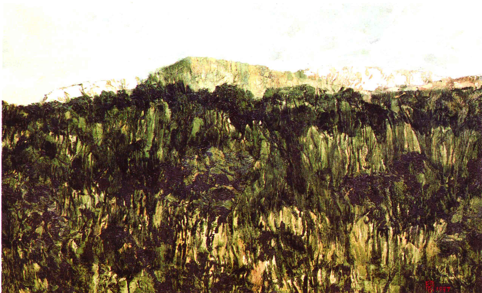
闻立鹏 静静的林海 Wen Lipeng Quiet Forest