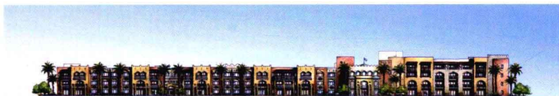
Northeast Elevation 东北立面图