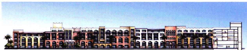
North Elevation 北立面图