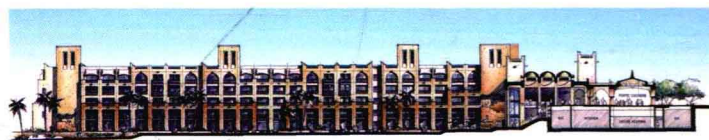
Northwest Elevation Section 西北立面与剖面