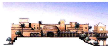
Entry Elevation 入口立面图