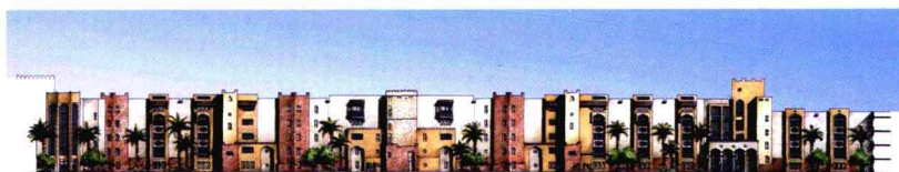
South Elevation 南立面图