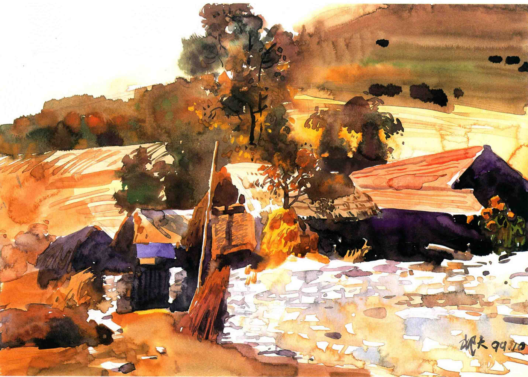
小村之恋 35.5cm × 25cm 1999 年