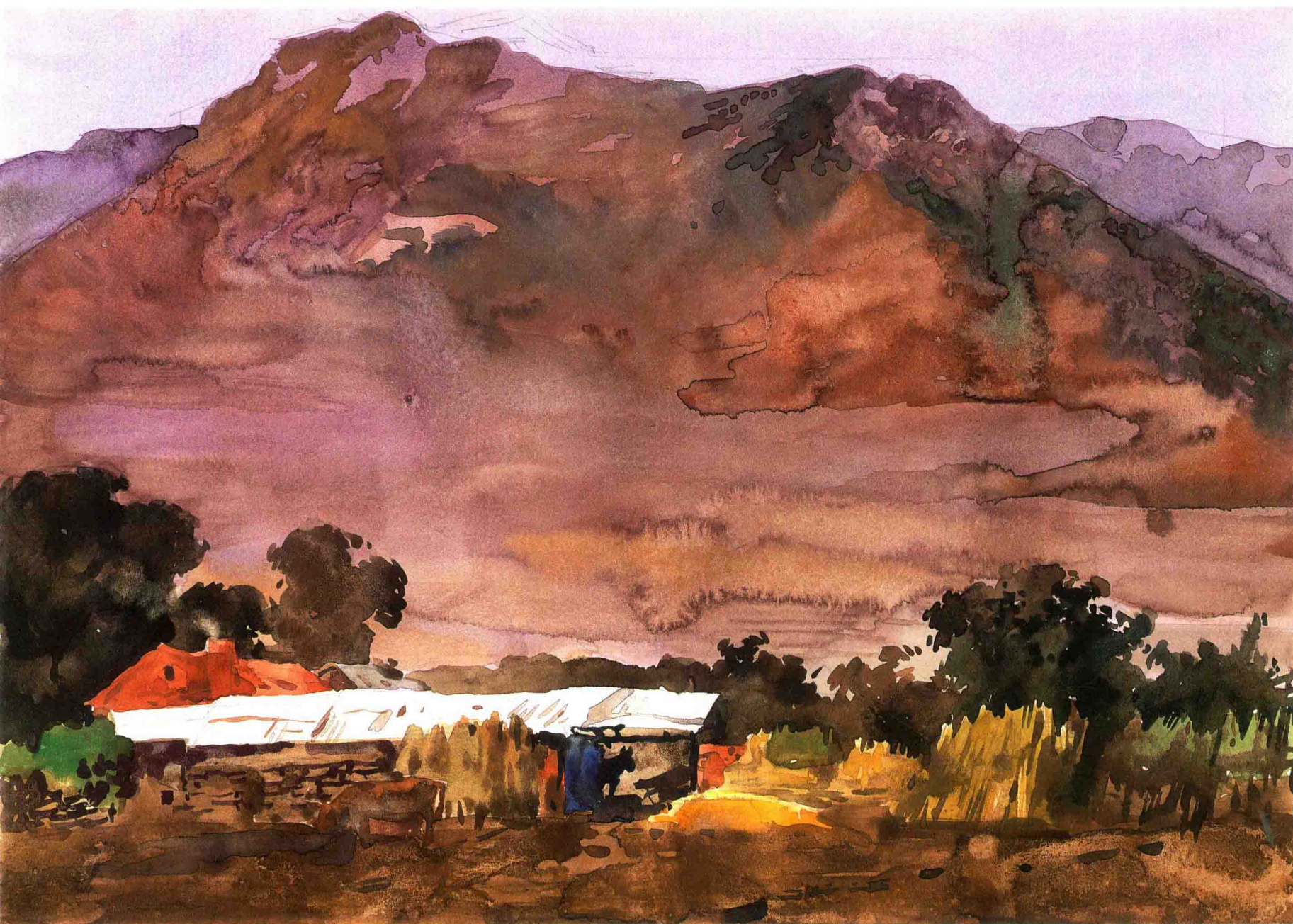
微风 35.5cm × 25cm 1999年