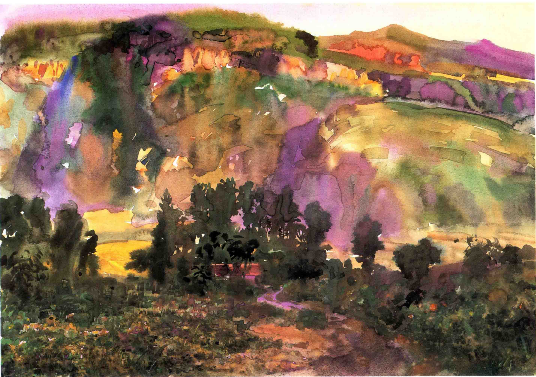
核伙沟 35.5cm × 25cm 1999 年