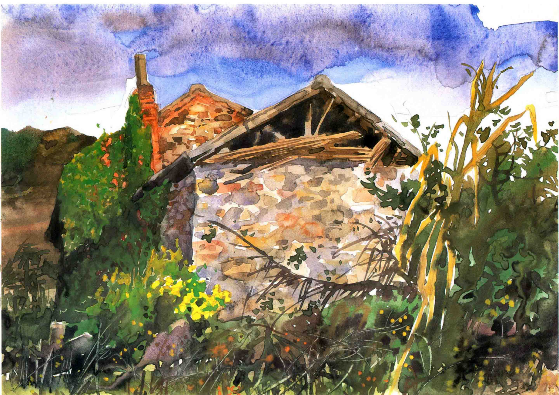
老房子 35.5cm × 25cm 1999 年