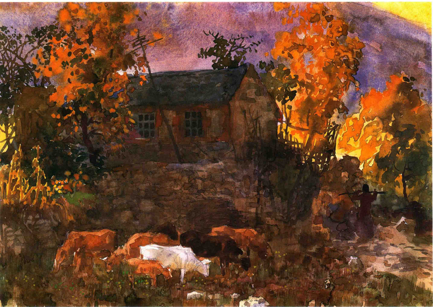
房东家的后院 35.5cm × 25cm 1999 年