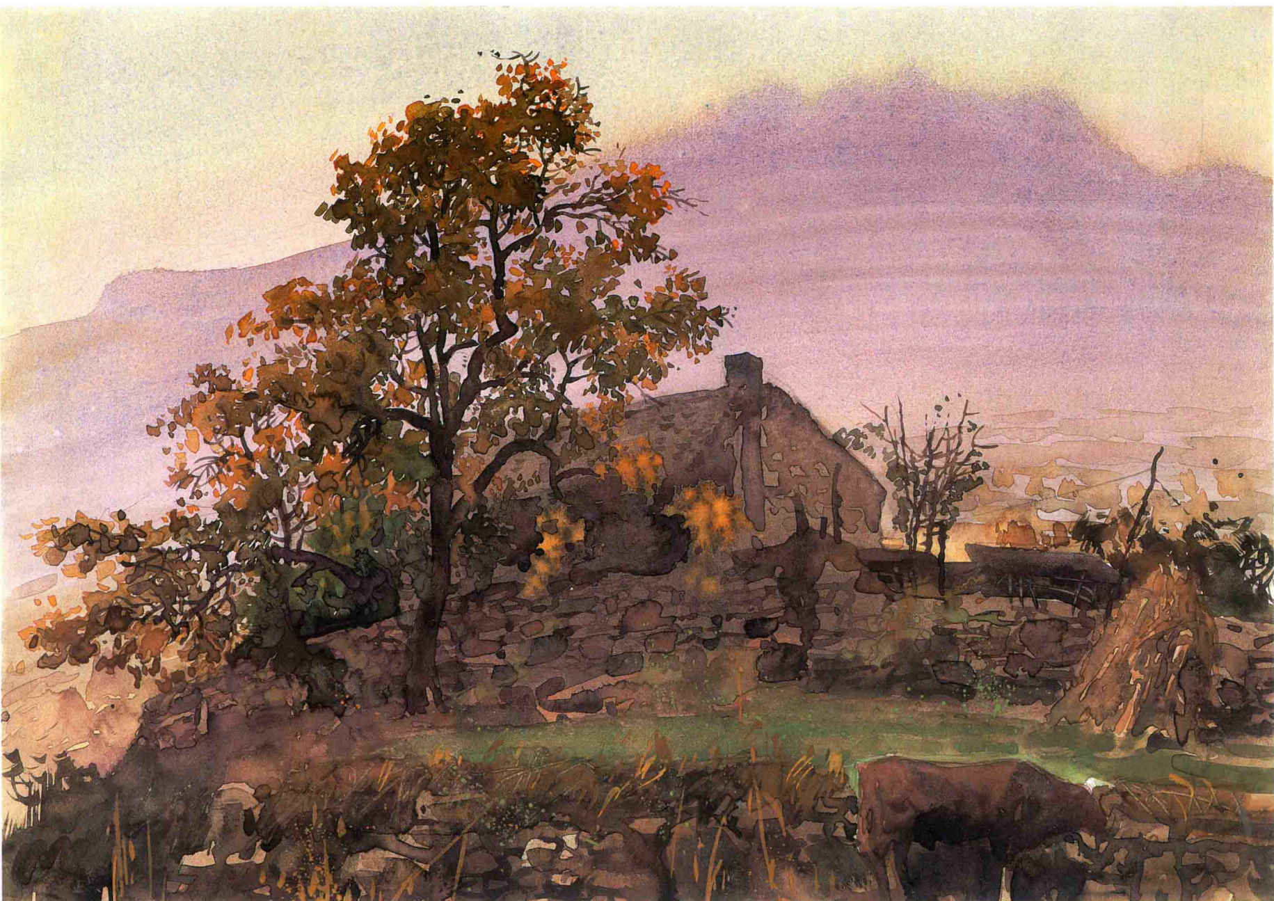
远山的雾 35.5cm × 25cm 1999 年