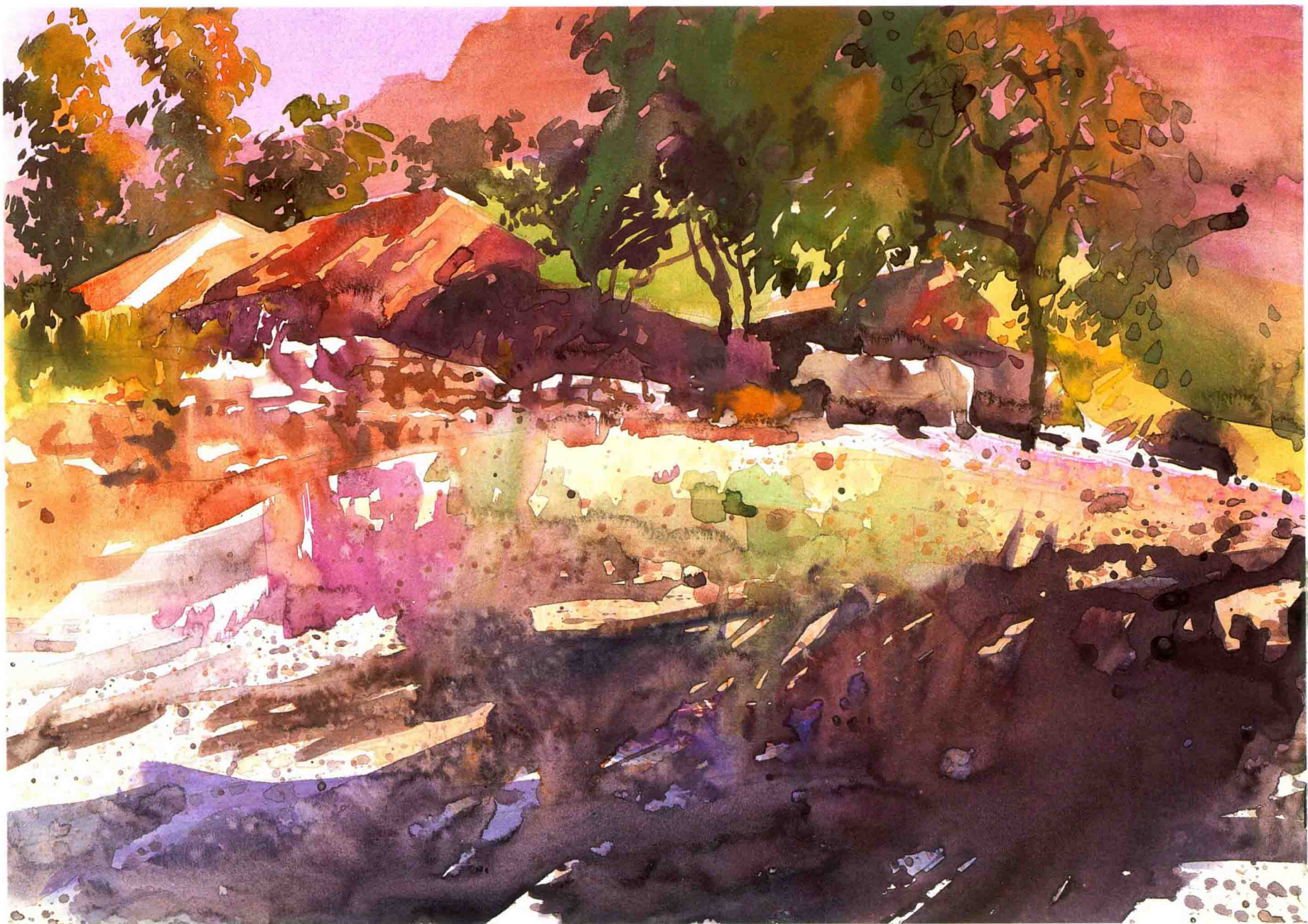
村 头 35.5cm × 25cm 1999 年