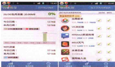
Picture 6 Build site traffic