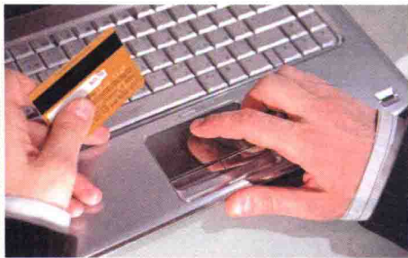
Picture 4 Online payment