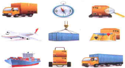
Picture 5 Determine product delivery methods