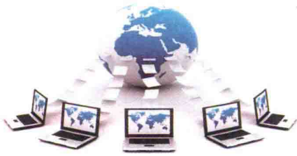
Picture 2 Find a web host