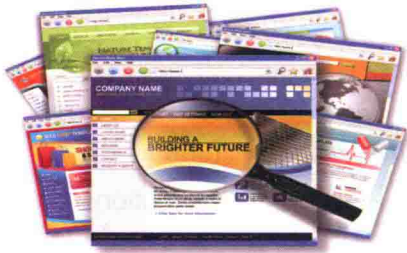
Picture 3 Design your website