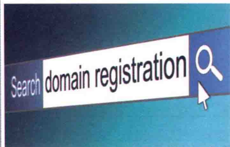
Picture 1 Register your domain

Eager to launch your online business, but not sure where to start? With the development of technology, including excellent online tools and lower costs, there has never been an easier time to start your online business.