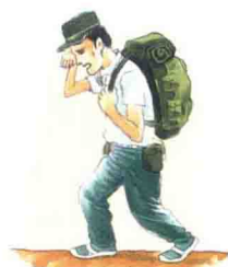
cā yì bǎ hàn 擦一把汗 to wipe off one's sweat