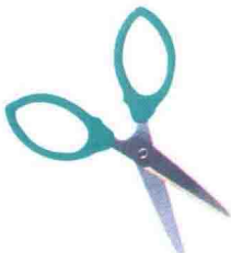
yī bǎ jiǎn dāo 一把剪刀 one pair of scissors