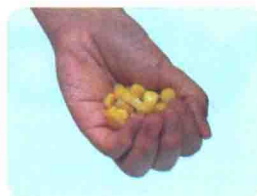
yì bǎ yù mǐ 一把玉米 one handful of corn