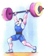
yì bǎ lì qì 一把力气 to be strong