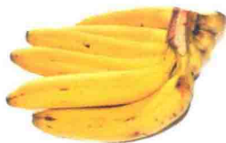
yì bǎ xiāng jiāo 一把香蕉