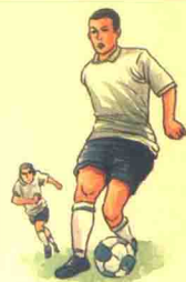
tī yì chǎng (qiú) 踢一场(球) to play a football game