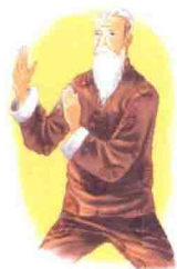
yì bǎ nián jì 一把年纪 to be getting old

4 用于某些抽象的事物，数词限于“一”。 For certain abstract ideas. Only the numeral 一 can be used.