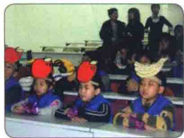
yì bān xué shēng 一班学生 one class of students