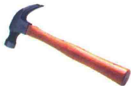
yī bǎ chuí zi 一把锤子 one hammer