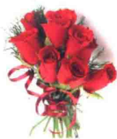
yì bǎ huā 一把花