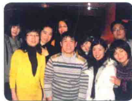
yì bān rén / nián qīng rén / péng you 一班人 / 年轻人 / 朋友 one group of people / young people / friends