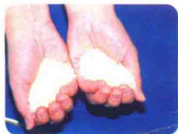
liǎng bǎ mǐ 两把米 two handfuls of rice