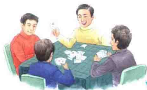
(dǎ pái) yíng le liǎng bǎ (打牌) 赢了两把 won twice (when playing cards)

6 (动量) 用于表示某些动作行为的次数。一般用于口语。 (verbal measure word) Colloquially represents a number of times something is done.