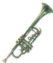
yì bǎ hào 一把号 one trumpet