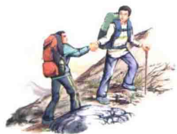
lā tā yì bǎ 拉他一把 to pull him up