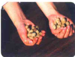
liǎng bǎ huā shēng 两把花生 two handfuls of peanuts