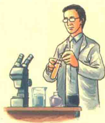
yí míng zhuān jiā 一名专家 one expert