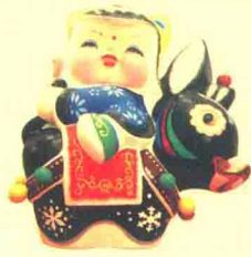
yí jiàn gōng yì pǐn 一件工艺品 one handicraft