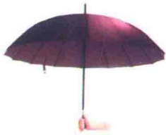
yī bǎ sǎn 一把伞 one umbrella

1 用于有把手或类似把手的东西。 For something with a handle.