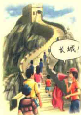
yí bāng yóu kè 一帮游客 a group of tourists