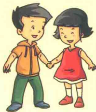
yí fèn yǒu yì 一份友谊 a friendship