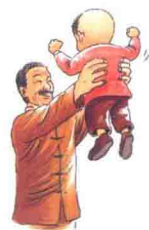
yì bǎ jǔ qǐ 一把举起 to lift up

6 (动量) 用于表示某些动作行为的次数。一般用于口语。 (verbal measure word) Colloquially represents a number of times something is done.