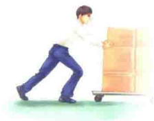
tuī yì bǎ 推一把 to give a push