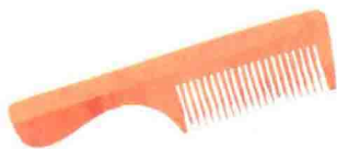
yì bǎ shū zi 一把梳子 one comb