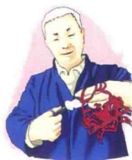
yì bǎ hǎo shǒu 一把好手 to be skilled

5 (动量) 用于和手有关的动作、行为。 (verbal measure word) For actions done with the hand.