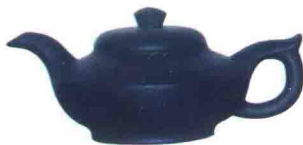
yī bǎ chá hú 一把茶壶 one teapot