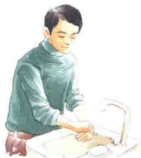
xǐ yì bǎ shǒu 洗一把手 to wash one's hands