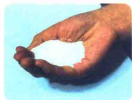
yì bǎ yán 一把盐 one handful of salt