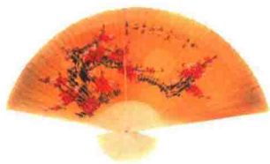
yì bǎ shàn zi 一把扇子 one fan