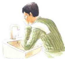
xǐ yì bǎ liǎn 洗一把脸 to wash one's face

5 (动量) 用于和手有关的动作、行为。 (verbal measure word) For actions done with the hand.