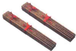
liǎng bǎ kuài zi 两把筷子