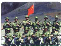
yì bān shì bīng 一班士兵 one group of soldiers