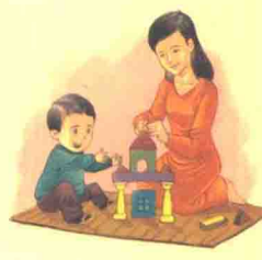
wán yí zhèn 玩儿一阵 to play for a while