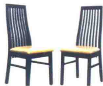
liǎng bǎ yǐ zi 两把椅子 two chairs