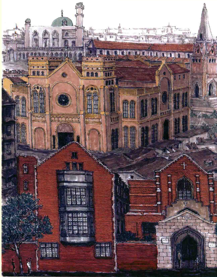
《上海教堂》，戴红倩插画，2013 The Churches of Shanghai , illustration by Dai Hongqian, 2013