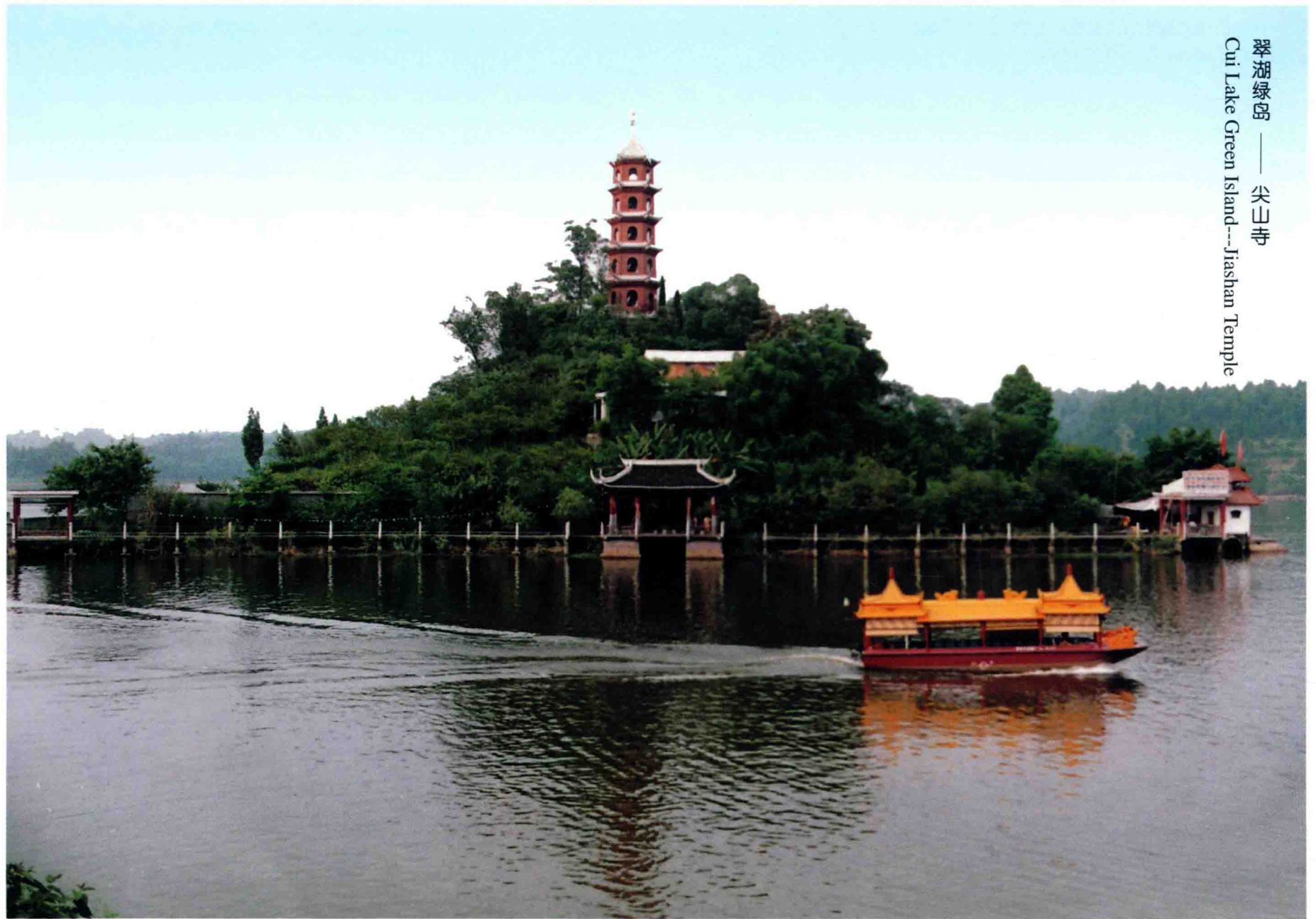
翠湖綠島 —— 尖山寺 Cui Lake Green Island --- Jiashan Temple