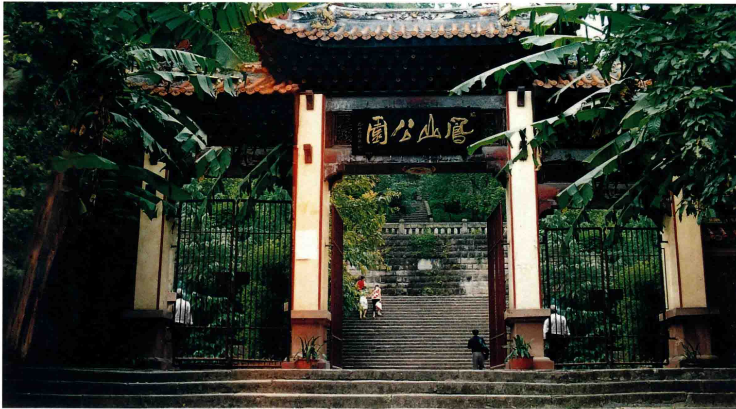
凤山公园 Fengshan Park