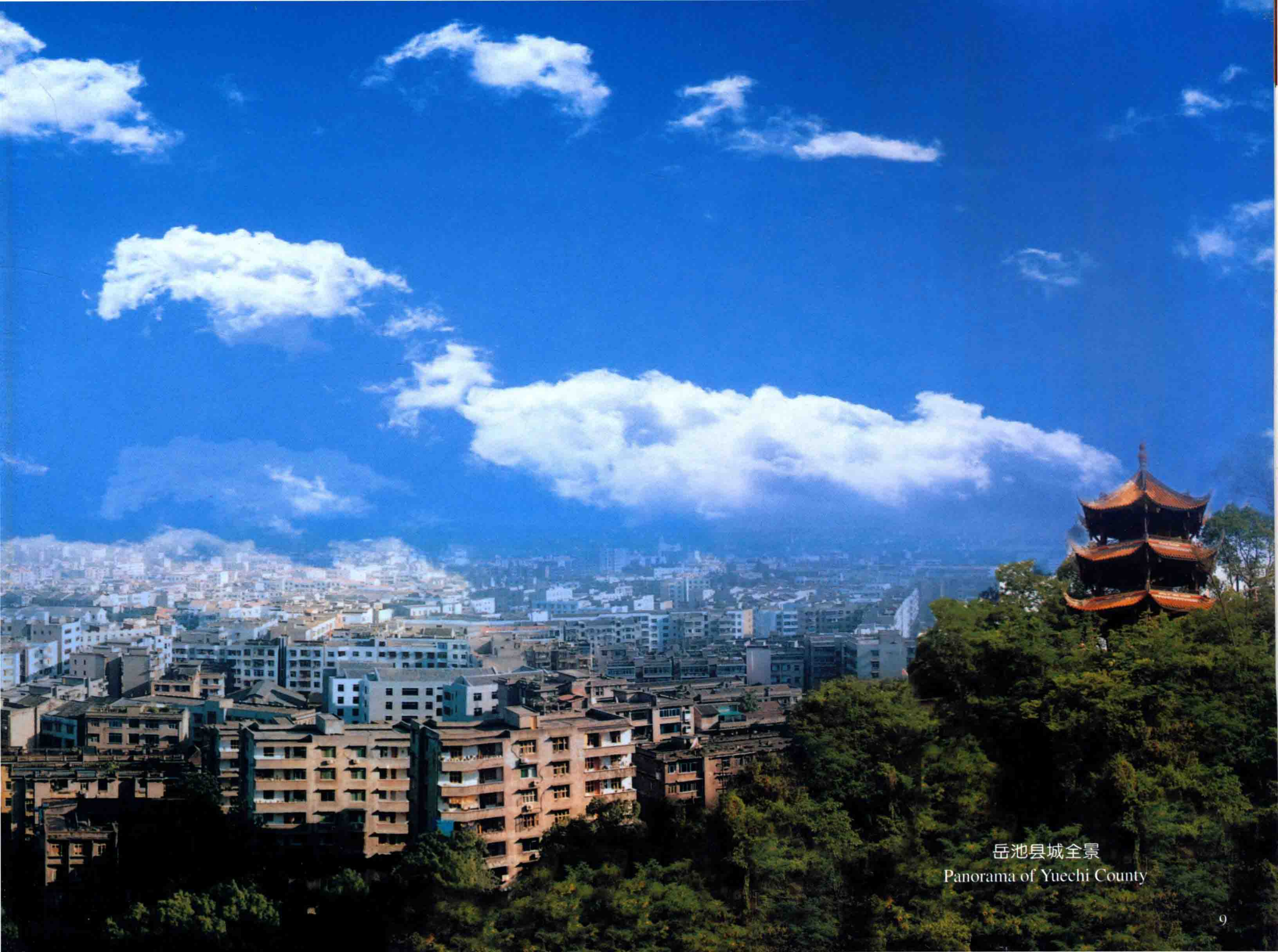
岳池县城全景 Panorama of Yuechi County