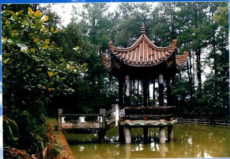
金城山风景一角 Part of Jincheng Mt. Scenery

省级森林公园——金城山 Provincial forest park-Jincheng Mt.