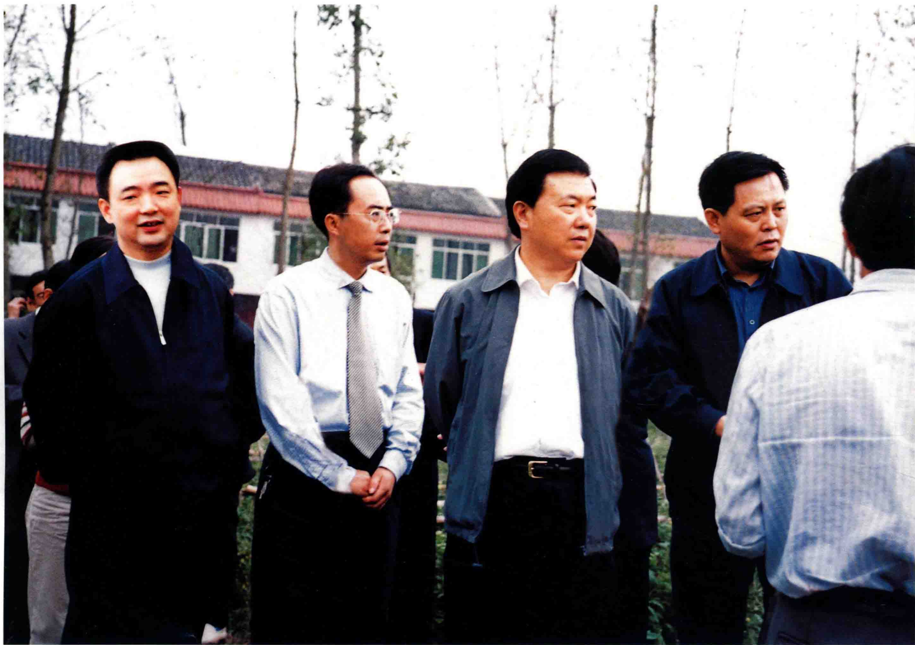
中共四川省委副书记王三运同志(右三)视察岳池 Sichuan Province Deputy The Party Committee Wang Sanyun (the third on the right) visit Yuechi