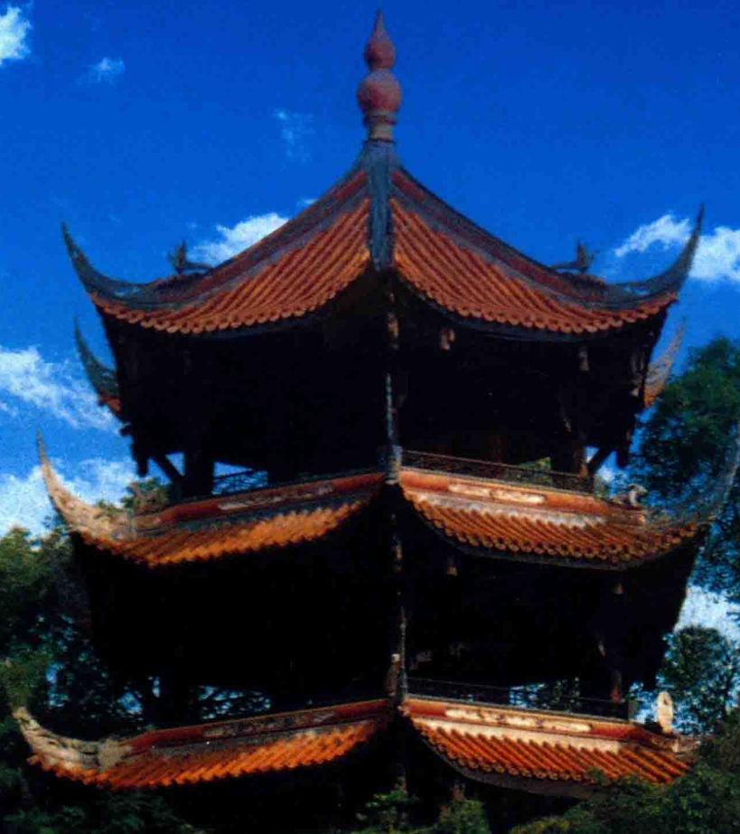
陆游亭 Lu You Pavilion