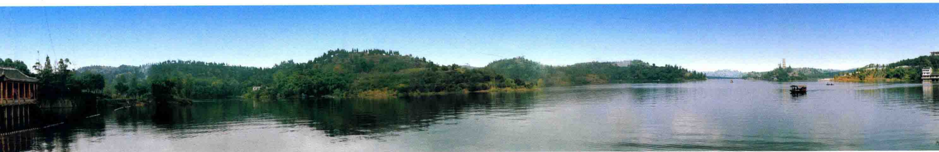
翠湖全景 Panorama of Cui Lake