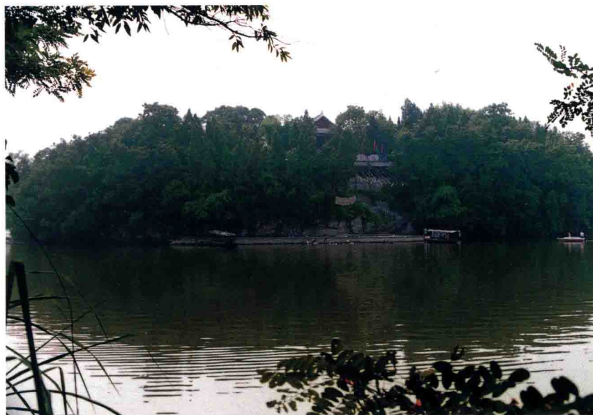
翠柏掩映的龙华阁 Longhua Tower among green cypresses