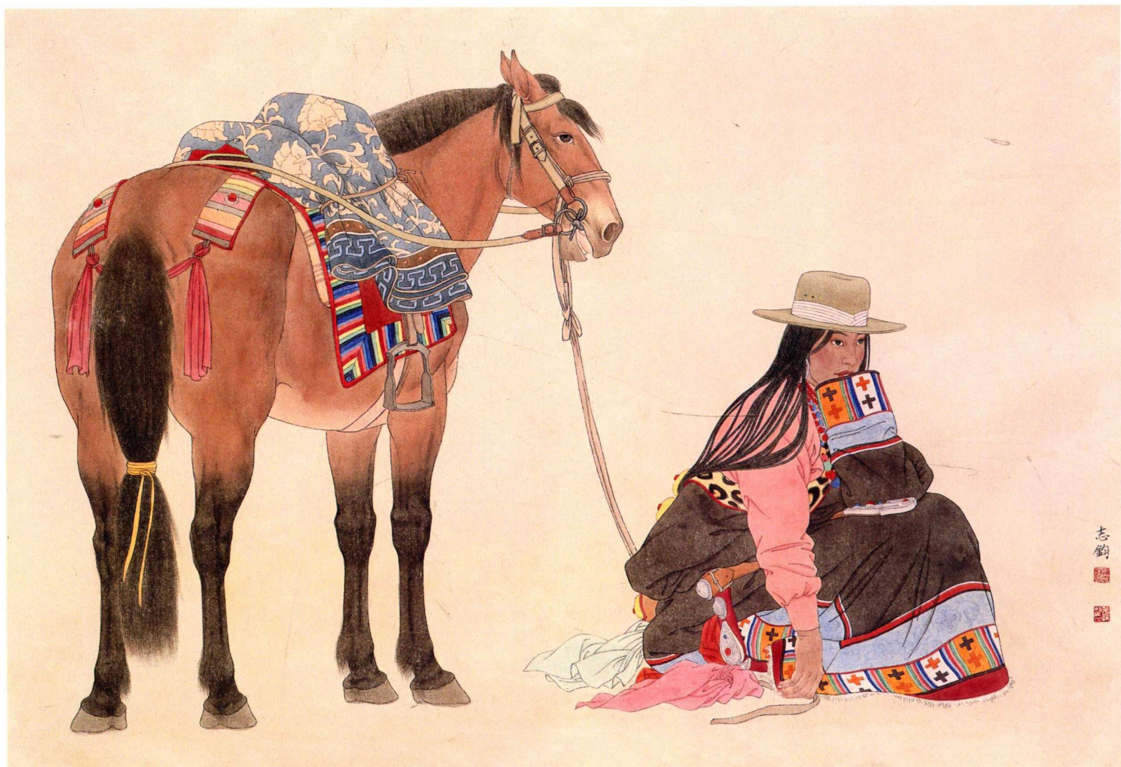
郎木寺的藏女 Tibetan Girl at Langmu Temple 200cm x 110cm 孙志钧