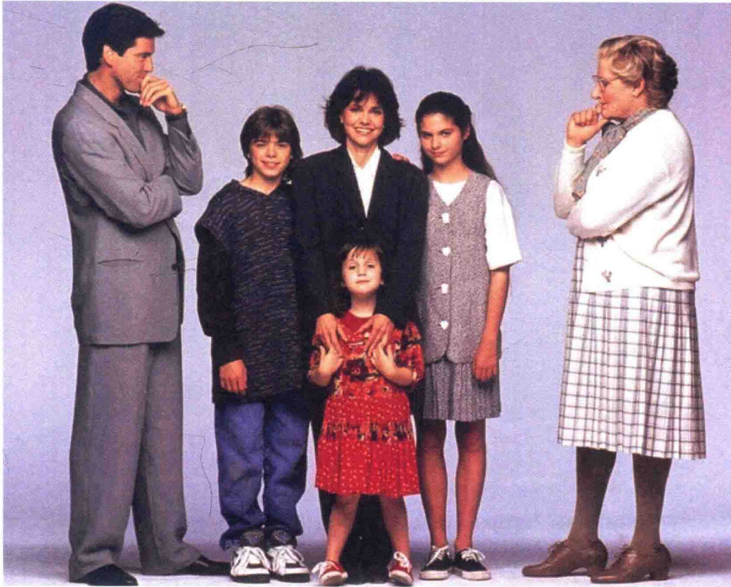
Mrs. Doubtfire 窈窕奶爸

1. Watch an English movie clip about a family and try to play roles with your partners. Mrs. Doubtfire is an example.