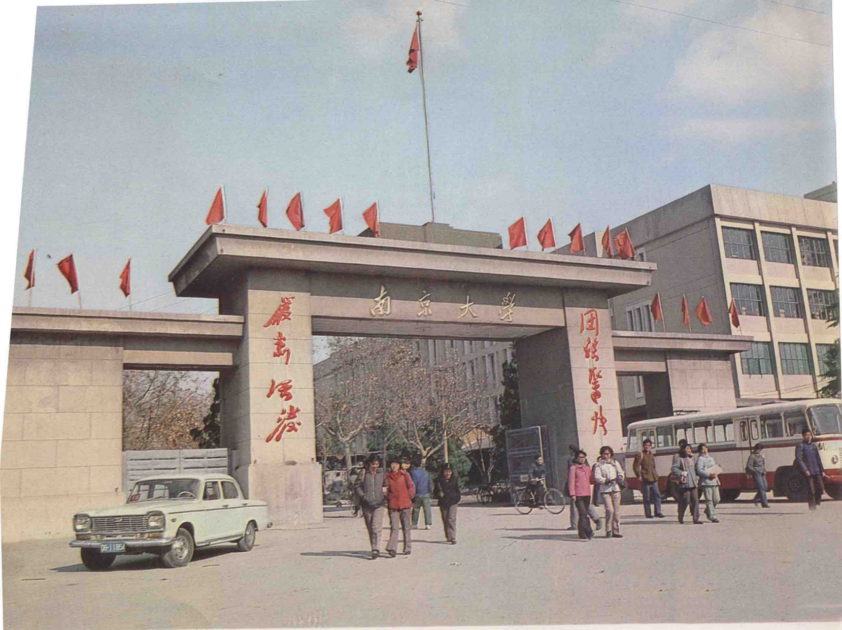
校 门 The university gate