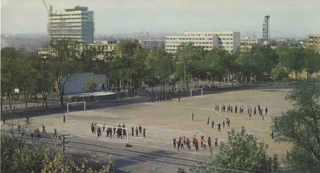
校 体 育 场 The university stadium