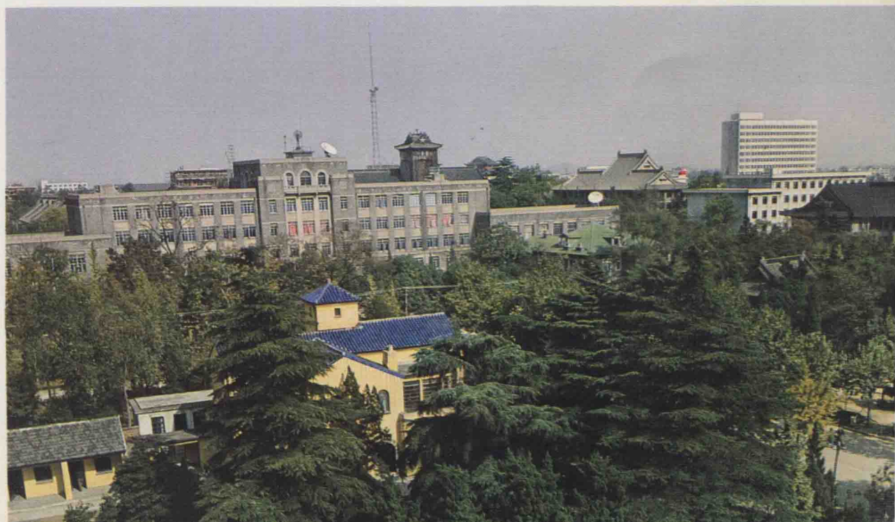
青松翠柏掩映中的教学楼 Classroom building amidst green pines and cypresses