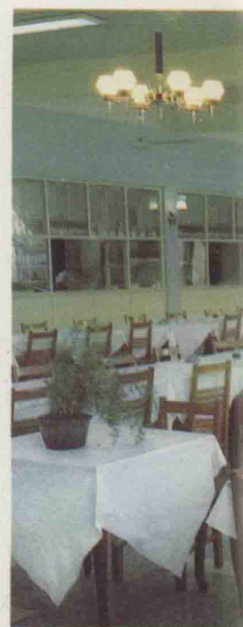
燕乐堂——外宾餐厅 Yenle Hall—dining- hall for foreign guests