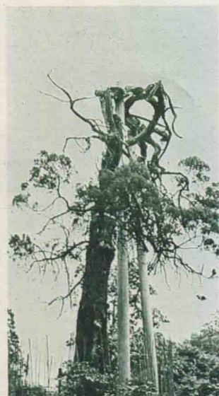
六朝古松 "Six-Dynasty" pine tree